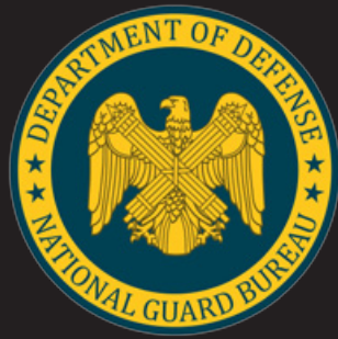
TABLE OF CONTENTS Trusted at Home, Proven Abroad