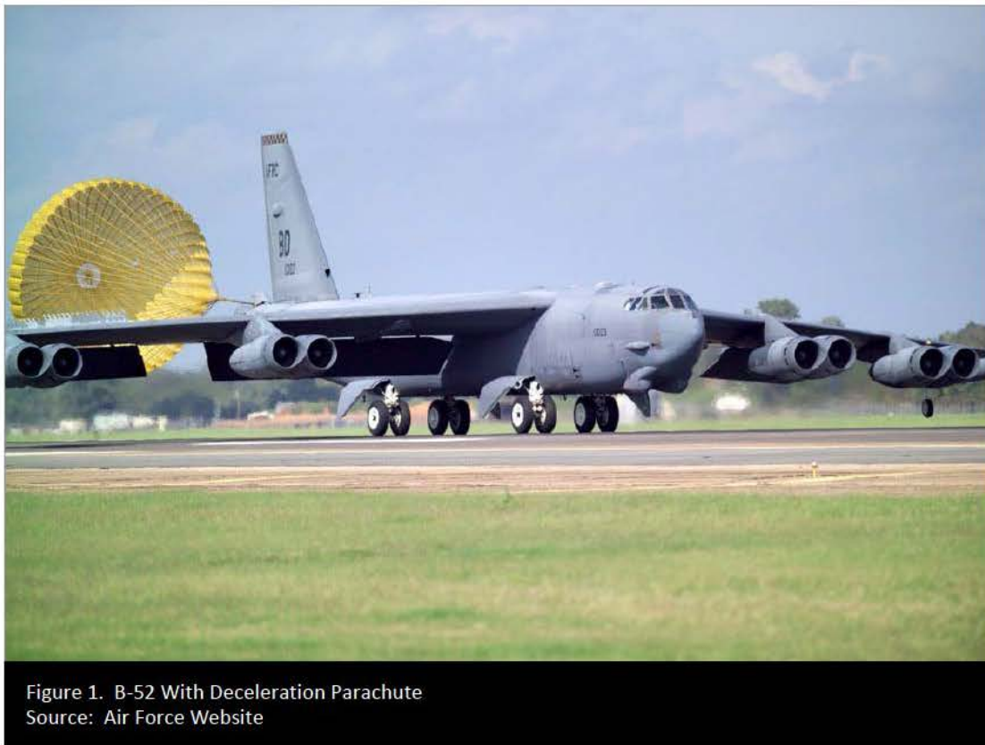
Figure 1. B-52 With Deceleration Parachute

Specifically, DLA has purchased spare parts, components, assemblies, and subassemblies to support various aircraft. For example, DLA purchased a deceleration parachute for the B-52 Stratofortress (see Figure 1).