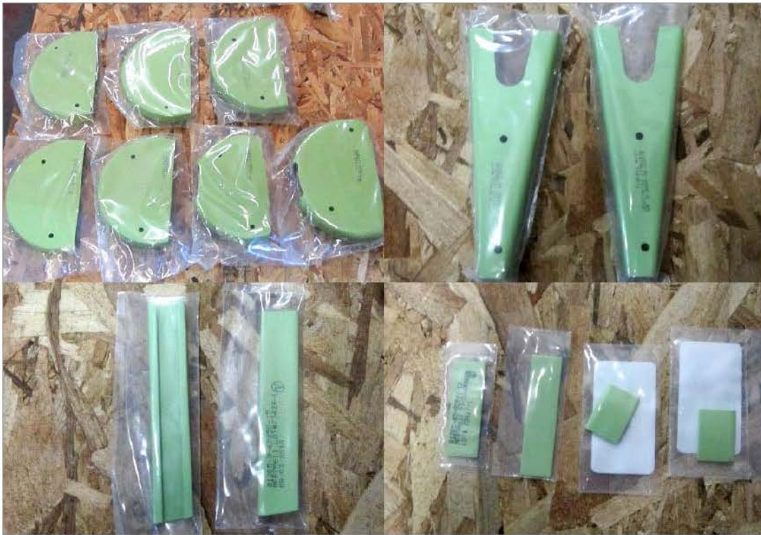
Figure 6. Parts Kit

DoD OIG identified in three of the seven reports that DoD had problems with excessive contractor pass-through costs on long-term contracts where DoD continued to pay the negotiated price for spare parts placed on the contract, while contractors acquired the parts at lower rates from its suppliers. In one instance, DLA Aviation contracting officers awarded a long-term contract, with a period of performance from 2002 through 2014, and established prices for each spare part when it was initially added to the contract. These prices were then used throughout the contract. DLA Aviation guidance did not suggest the best practice that required contracting officers to complete a subsequent review of pricing for spare parts after the parts were initially placed on long-term contracts. Therefore, the contractor received a lower price for a spare part, while the Government continued to pay the higher negotiated price. For example, DLA Aviation paid twice as much as it should have for an aircraft parts kit (see Figure 6) because the contractor received a lower price from a subcontractor after negotiating the parts kit price with DoD and did not pass the savings onto DoD.