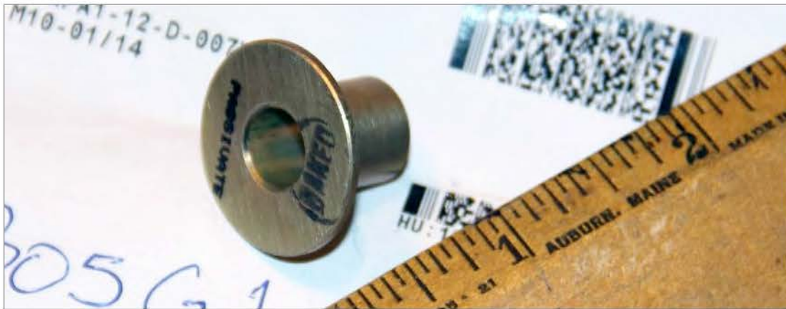
Figure 2. Commercial Bushing

For example, DLA obtained a bushing (see Figure 2) from a contractor with less than 45 percent commercial sales and accepted the price as fair and reasonable without obtaining cost or pricing data and performing a cost analysis. DoD OIG performed a cost analysis and identified DLA paid 1,049.1 percent over the fair and reasonable price for the bushing.