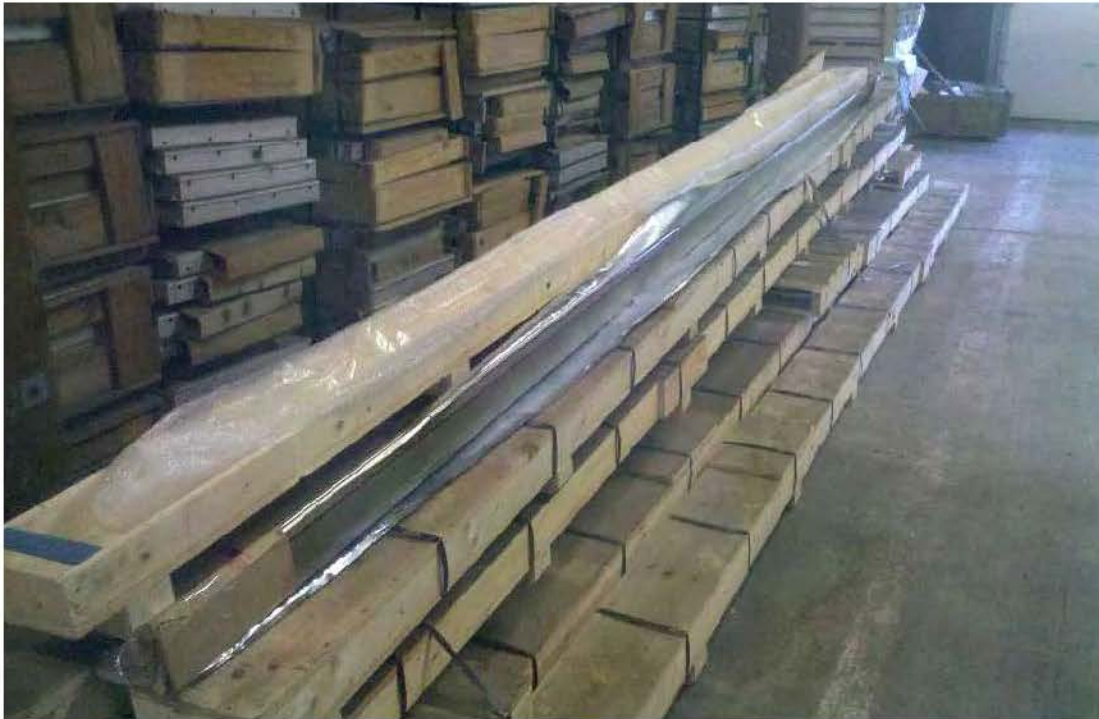
Figure 5. Titanium Blade Sheath Assembly

However, contractors negotiated for lower prices from their suppliers shortly after negotiating the contract price with DoD, proposed a manufacturing price then procured the part from a supplier at a lower cost, and negotiated a price using low quantities then purchased larger quantities at a lower price but did not pass on the savings to the Government. For example, in one report, DoD OIG identified that the Army paid $11.8 million more than fair and reasonable prices for 28 spare parts. AMCOM and a contractor accepted unreasonable price increases from subcontractors resulting in excessive pass-through costs. In one instance, AMCOM paid $6.6 million in excessive profit because the contractor did not review supplier costs below the first tier subcontractor and accepted price increases from suppliers for titanium blade sheath assemblies (see Figure 5).