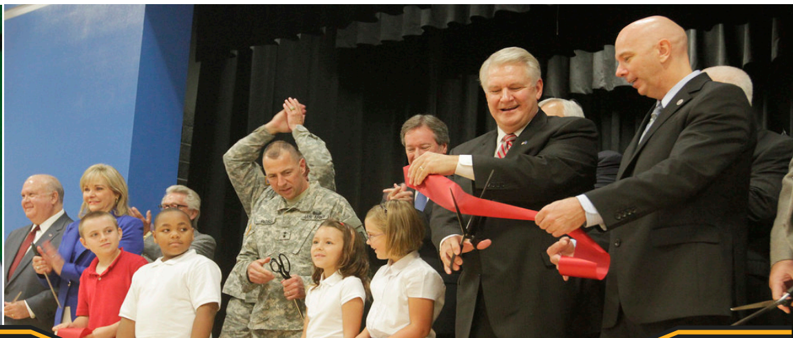
Freedom Elementary School ribbon-cutting in August.