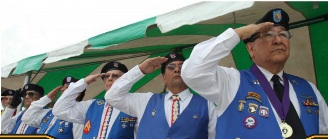
Members of the Comanche Indian Veterans Association salute during the playing of the national anthem during the dedication of the Code Talker Hall on Fort Sill in March.