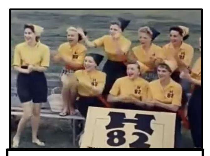
SOS Spouses At Field Events- 1959