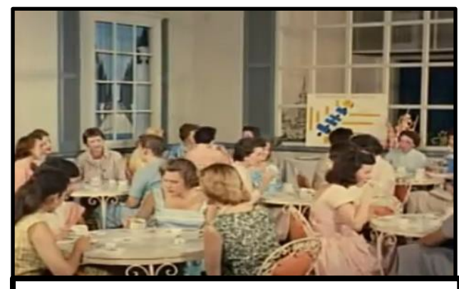
SOS Spouses Social Gathering-1959