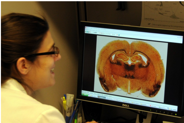
Neuropathology assessments in experimental closed-head brain injury research