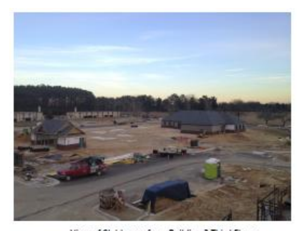
View of Clubhouse from Building 3 Third Floor