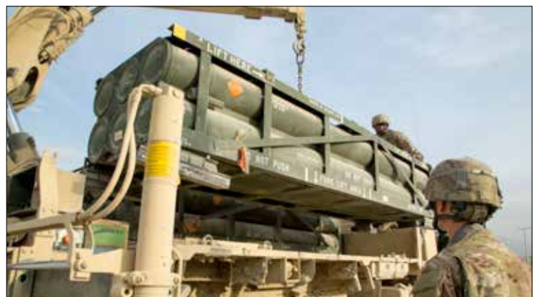
The 2014 Field Artillery Alexander Hamilton Award has been awarded to: A Battery, 1st Battalion, 181st Field Artillery Regiment (Tennessee Army National Guard).