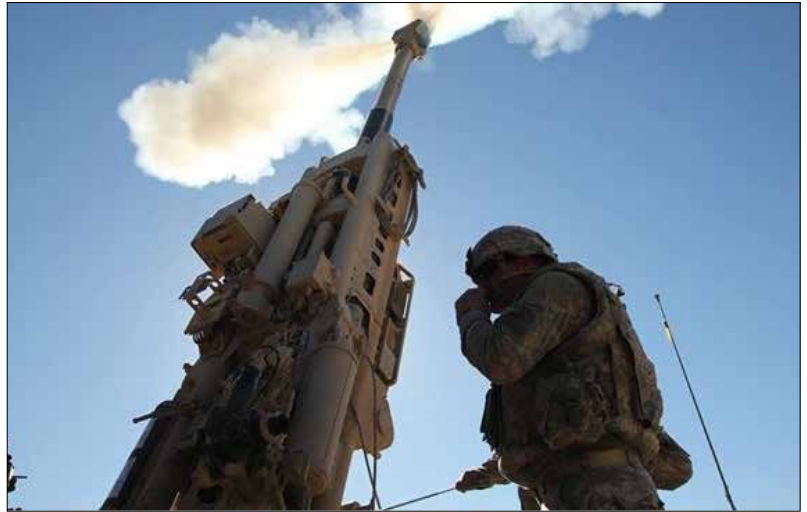
The 2014 Field Artillery Henry A. Knox Award was awarded to: B Battery, 4th Battalion, 27th Field Artillery (Fort Bliss, Texas).