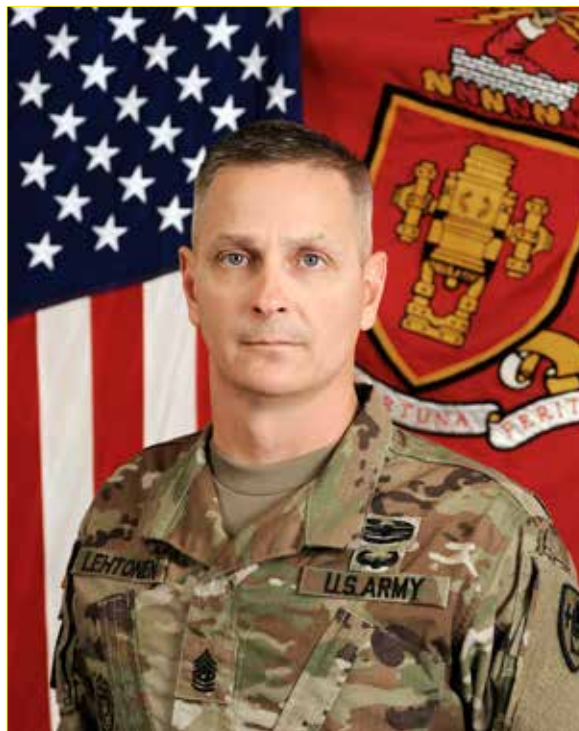
CSM Robert G. Lehtonen II is the 11th Command Sergeant Major of the U.S. Army Field Artillery and the United States Army Field Artillery School.

Don't let your units or outstanding FA individuals go unnoticed. Get your packets together and submitted today. The eligibility criteria for the Knox and Hamilton Awards are outlined in a memorandum of instruction (MOI) that can be found online at http://sill-www.army.mil/USAFAS/index.html . Click on the photo of the "Number One Man" on the home page.