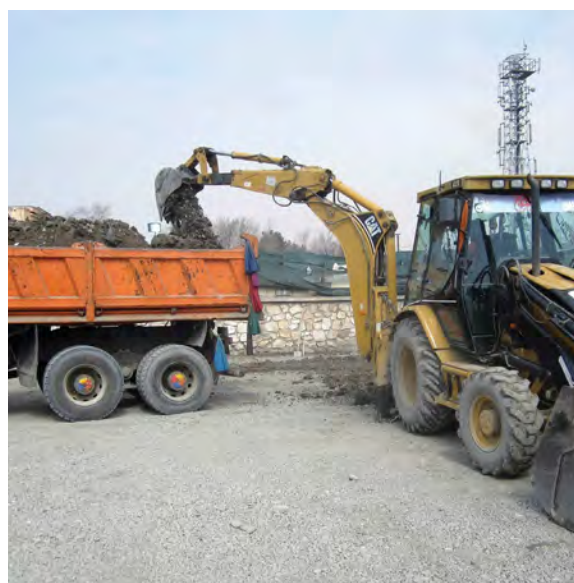
Construction at Camp Sullivan.