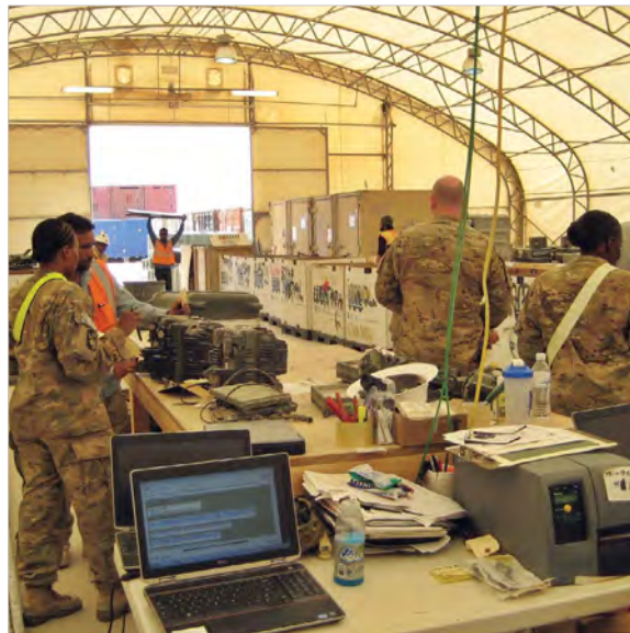
DoD IG inspects the activities at a Retrograde Sort Yard.

In FY 2015, the remaining challenges will likely be the removal of any remaining equipment in Afghanistan, transporting cargo/equipment throughout the region, accounting for equipment returning to the Continental U.S., and entering equipment into reset processes. Each of these remaining tasks will have to be accomplished with a diminished force to execute the retrograde and provide security.