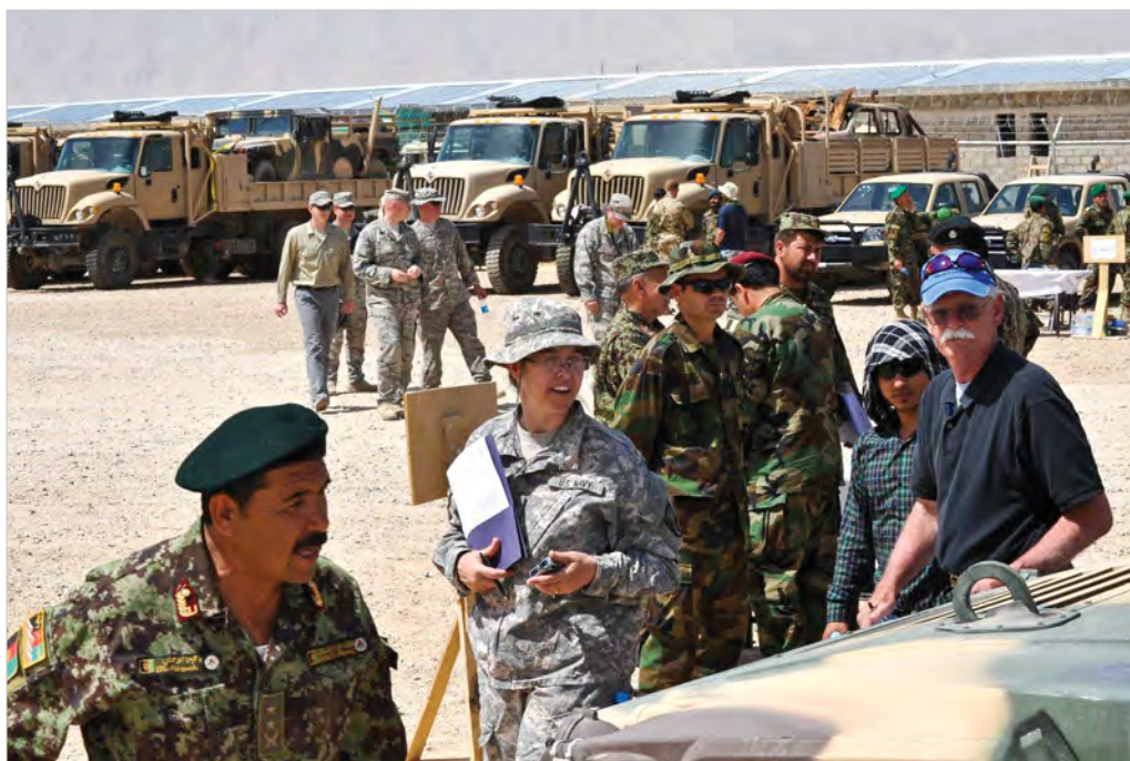
SIGAR visits site of new vehicles being transferred from CSTC-A to ANSF.

Note: One project may impact two or more countries.