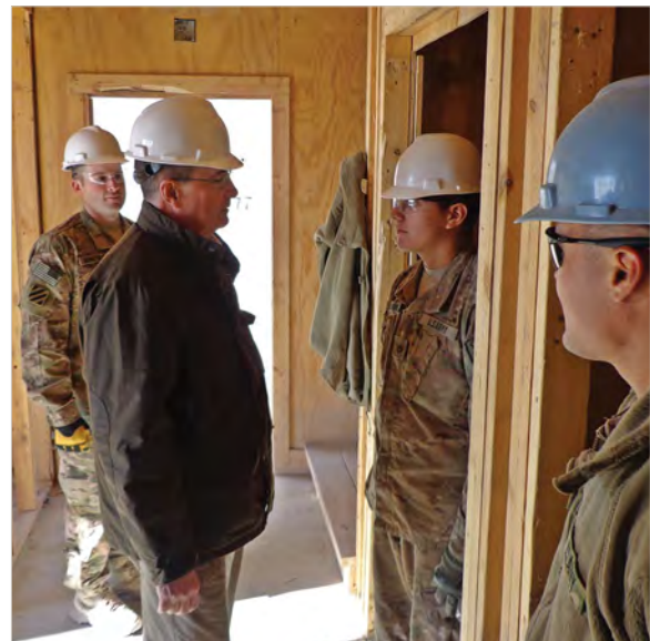
DoD IG Jon T. Rymer at the construction site of the Ministry of Defense Headquarters in Kabul.

The U.S. Government's support to governance in Afghanistan is designed to empower government and its institutions to be representative, accountable, responsive, and constitutionally legitimate. Further, stability development programs are intended to ensure the government is capable of performing necessary functions and providing key services such as essential healthcare, education, and power transmission and connectivity. Failure by the U.S. Government to adequately address the capacity of the GIRoA to sustain U.S. reconstruction programs and investments will not only waste U.S. taxpayers' funds, but undermine local government credibility and impede progress in reconstruction and stabilization.