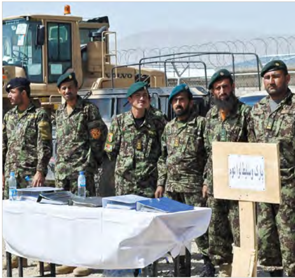
Soldier field instruction.

end of 2015, the United States will reduce that presence by roughly half, and by the end of 2016, the United States will drawdown to a normal embassy presence in Kabul, with a security assistance component, as was done in Iraq.