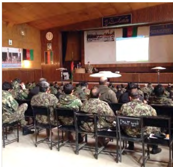
ANSF officers and NCOs receiving U.S. instruction on resource management.

respective departments and agencies to include financial, acquisition/contracting, logistics, transportation, and security operations. During FY 2014, several high-ranking military and civilian leaders gave situational briefings as keynote speakers during quarterly SWA JPG meetings.