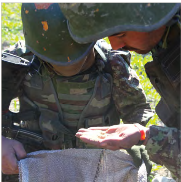
Afghan soldiers inspect opium poppy seeds.

Congress appropriated $7.4 billion for counternarcotics and law-enforcement/rule-of-law initiatives in Afghanistan from FY 2002 through March 31, 2014. FY 2014 appropriations were $545 million. The bulk of appropriated funds were for the DOS's International Narcotics Control and Law Enforcement Fund (INCLE) and DoD's Drug Interdiction and Counter-Drug Activities. INCLE appropriations have also included funds for the Administration of Justice, Justice Sector Support, and Corrections System Support Programs carried out in Afghanistan.