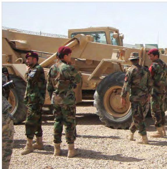
Inspection of heavy equipment.

U.S. reconstruction funds have been applied to the core task of building and sustaining the Afghan National Security Forces (ANSF), promoting governance and rule of law, supporting anticorruption and counternarcotics initiatives, and fostering economic development.