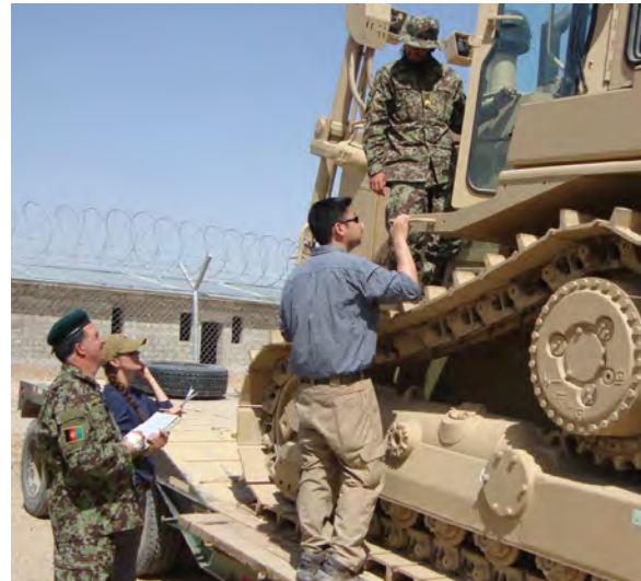
Inspection of heavy equipment provided to the ANSF.