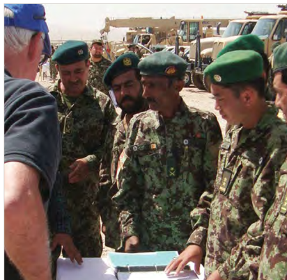
SIGAR personnel conducting site visit.

On May 27, 2014, the President announced a plan to end the U.S. combat mission in Afghanistan in December 2014. At the beginning of 2015, and contingent upon the Afghans signing a Bilateral Security Agreement and a status of forces agreement with NATO, the United States will execute the Resolute Support train, advise, and assist mission, with 9,800 service members in different parts of the country, along with NATO allies and partners. By the end of 2015, the United States will reduce that presence by roughly half, consolidating U.S. troops in Kabul and on Bagram Airfield. By the end of 2016, the United States will drawdown to a normal embassy presence in Kabul, with a security assistance component, as was done in Iraq. Beyond 2014, the mission of U.S. troops will be training Afghan forces and supporting counterterrorism operations against the remnants of al-Qaeda. 1