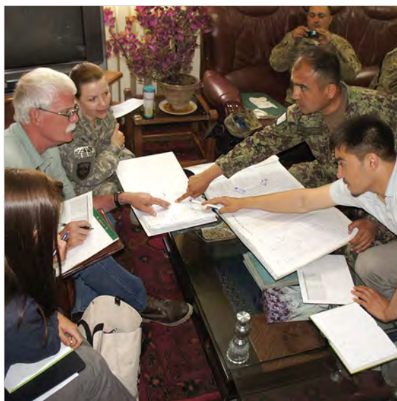
SIGAR reviews transfer documents from CSTC-A to the ANSF

The FY 2015 COPSWA incorporates the planned and ongoing oversight by the Inspectors General of the DoD (DoD OIG), U.S. Department of State (DOS OIG), and the U.S. Agency for International Development (USAID OIG); the Special Inspector General for Afghanistan Reconstruction (SIGAR); the U.S. Army Audit Agency (AAA); the Naval Audit Service (NAVAUDSVC); and the U.S. Air Force Audit Agency (AFAA). The FY 2015 update also includes ongoing oversight efforts by the U.S. Government Accountability Office (GAO) related to Southwest Asia. This oversight plan is as of September 1, 2014.