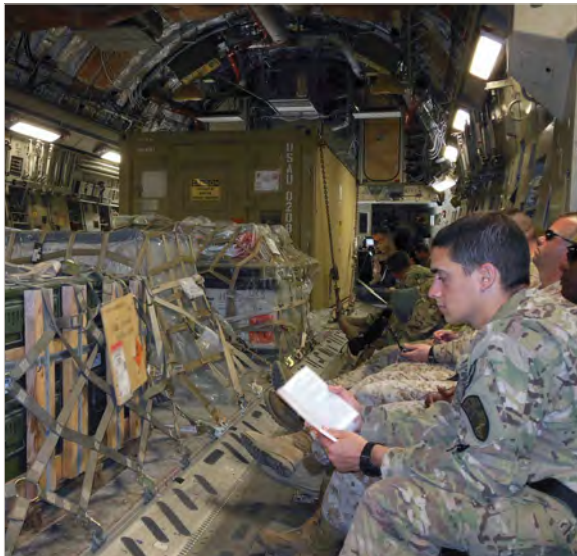
C-17 Flight.

Projects previously included in the FY 2014 COPSWA that were either ongoing or planned as of September 1, 2014, were carried over in the FY 2015 COPSWA, and are included in Section 1—Afghanistan, and Section 2—Other Than Afghanistan, respectively, along with new projects proposed for FY 2015. For Sections 1 and 2 of the COPSWA, projects are listed by the executing SWA JPG organization; and in the order of the unique COPSWA reference number. A reference number is assigned by the DIG-SWA staff for each project submitted by a SWA JPG contributing organization, and is a unique identifier for tracking purposes only. Section 2 of the FY 2015 COPSWA identifies