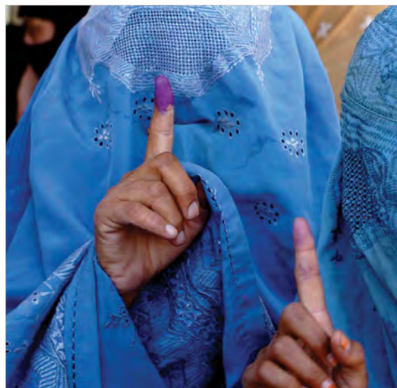
Afghan women proudly display their ink-stained fingers after casting their ballots.

ISAF. He commended the fact that elections took place on schedule, with a vibrant political debate among the candidates, the public, and in the media. He also anticipates the election process would continue in a transparent and inclusive way, and conclude in an outcome that is acceptable to the Afghan people. He added that it is important that any allegation of electoral irregularities be addressed through the established institutional mechanisms. 13