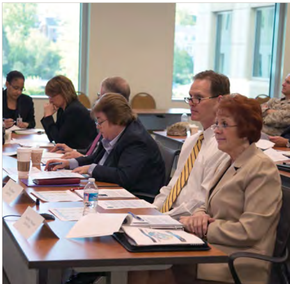
2nd Quarter meeting of the Southwest Asia Joint Planning Group.

For FY 2015, the COPSWA includes an updated Joint Strategic Oversight Plan for Afghanistan. This FY 2015 joint plan was developed by SWA JPG contributing organizations with emphasis on Afghanistan because most of the ongoing and planned oversight work in Southwest Asia is occurring in Afghanistan or is related to Afghanistan.