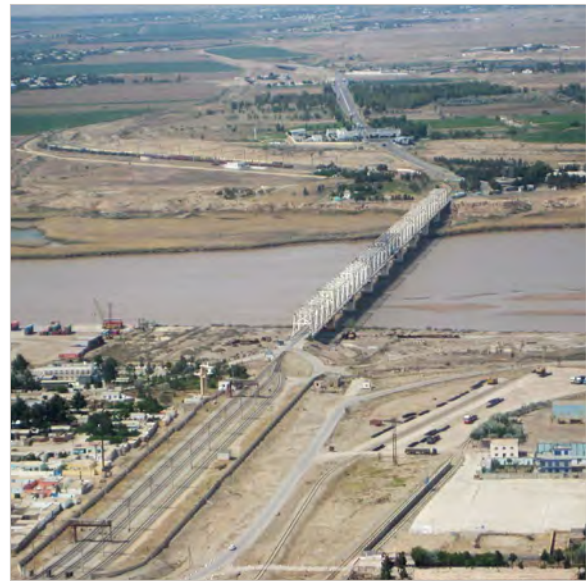
Freedom Bridge Connecting Afghanistan and Uzbekistan.

The information for the plan was obtained directly from each contributing organization, which also validated the content submitted for accuracy and completeness. All decisions regarding the selection, location, and dates of projects were made by the respective contributing organization. DIG-SWA staff compiled the report and reviewed the content for potential duplicative planned projects, errors, omissions, and timing updates. Where unclear input was identified, the DIG-SWA staff asked the