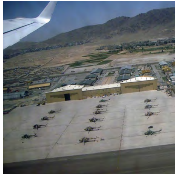
ANA rotary wing aircraft.

The U.S. and coalition mission to train and equip the ANSF has changed from force generation to force sustainment, with ANSF in the lead for security across Afghanistan. This includes providing materiel support to the ANSF through the NATO Training Mission-Afghanistan (NTM-A) and the Combined Security Transition Command-Afghanistan (CSTC-A). Support will eventually be through the Office of Security Cooperation-Afghanistan to ensure the ANSF can operate independently after the withdrawal of U.S. and Coalition combat forces.