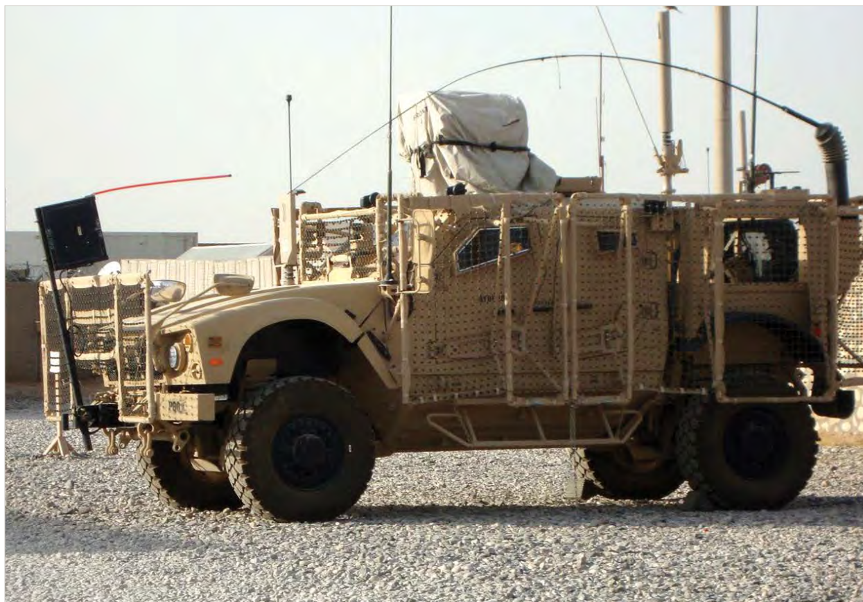
Mine-Resistant Ambush Protected vehicle.