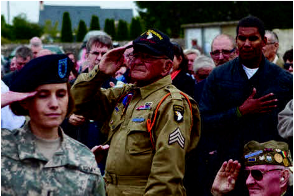
Figure 4-3. Soldiers for life

4-21. Today less than one-half of one percent of Americans serves in the military, and only about half of them are Soldiers. Being a Soldier is far more than a job; it is a calling, a vocation. Former Chief of Staff of the Army Eric Shinseki, although badly wounded in Vietnam as a young officer, always said, "Soldiering is an affair of the heart," a phrase he adopted from General Abrams. Taking off the uniform does not mean the end of pride in one's service to the Nation. It means taking that pride, discipline, and confidence into other areas, and never forgetting that each veteran will always be part of a proud tradition of sacrifice and service.