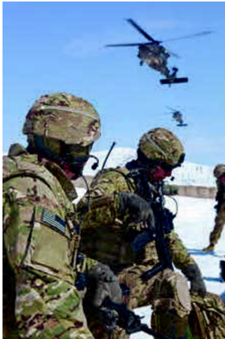
Introductory Figure. Soldiers—the strength of the nation

During the first year of the American Revolution, on 14 June 1775, the Second Continental Congress established “the American Continental Army.” The United States Army is the senior Service of the Armed Forces. As one of the oldest American institutions, it predates the Declaration of Independence and the Constitution. For almost two and a half centuries, Army forces have protected the Nation. Our Army flag is adorned with over 180 campaign and battle streamers, each one signifying great sacrifices on behalf of the Nation. Because of the Army, the United States is independent and one undivided nation. The Army explored the Louisiana Purchase, ended slavery on the battlefields of the Civil War, helped build the Panama Canal, played a major part in winning two world wars, stood watch throughout the Cold War, deposed Saddam Hussein, and took the fight to Al Qaeda.