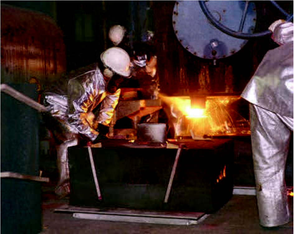
Figure A-2. Army Civilian Corps members

A-7. The Army has the largest civilian workforce in the Department of Defense. Army Civilians are full-time, long-service members of the profession. The Army Civilian Corps provides the complementary skills, expertise, and competence required to project, program, support, and sustain the uniformed side of the Army. Title 5, USC, governs the Army Civilian Corps.