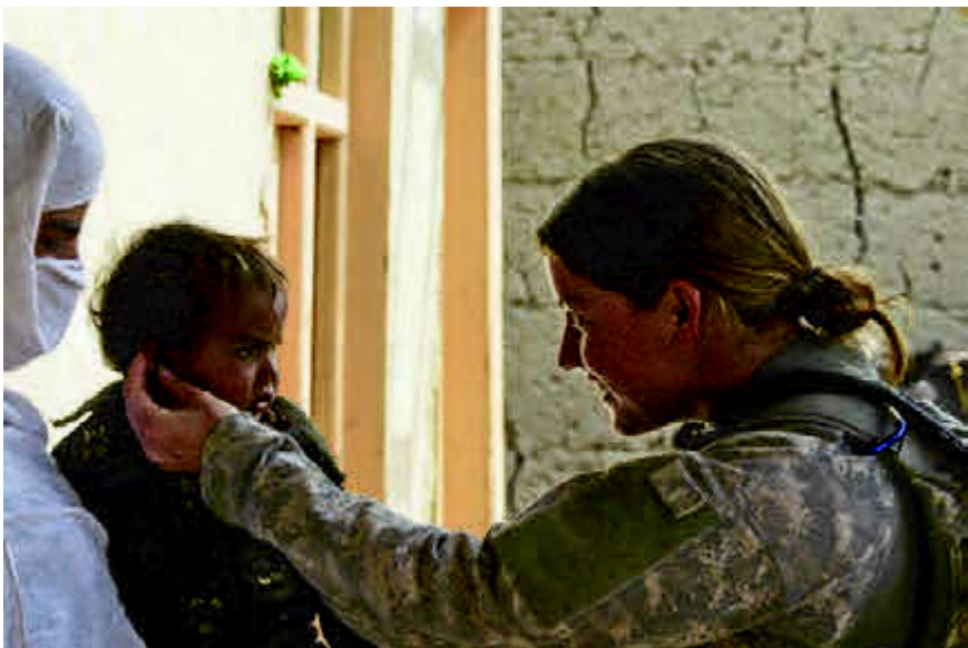
Figure 1-2. Landpower makes permanent the temporary effects of battle

1-9. No major conflict has ever been won without boots on the ground. Strategic change rarely stems from a single, rapid strike, and swift and victorious campaigns have been the exception in history. Often conflicts last months or years and become something quite different from the original plan. Campaigns require steady pressure exerted by U.S. military forces and those of partner nations, while working closely with civilian agencies. Soldiers not only seize, occupy, and defend land areas; they can also remain in the region until they secure the Nation’s long-term strategic objectives. Indeed, inserting ground troops is the most tangible and durable measure of America’s commitment to defend American interests. It signals the Nation’s intent to protect friends and deny aggression.