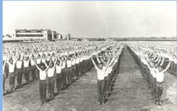
Physical fitness exercises for flight cadets at Maxwell Field during World War II

facilities. The center provided candidates for pilot, bombardier, and navigator training with classification and preflight instruction. In mid-1942, the center became the preflight school for pilots and later expanded to include preflight training for bombardier and navigator trainees.