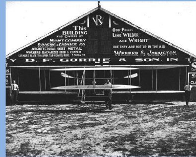
Wright Flying School Hanger and Maintenance Workshop, 1910

The history of Maxwell Air Force Base began with Orville and Wilbur Wright, who, wanting to take advantage of their 1903 historic flight, decided in early 1910 to open a flying school to teach civilians how to fly and to promote the sale of their airplane. Wilbur, after looking at locations in Florida, came to Montgomery, Alabama in Feb 1910. The Wright Brothers decided to open the nation's first civilian flying school on an old cotton plantation near Montgomery that subsequently become Maxwell Air Force Base (AFB). Unfortunately, the school closed after ten weeks