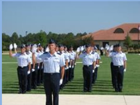
Commissioning Ceremony at Officer Training School

In 2006-2007, AU's structure and program effectiveness underwent an in-depth review that led to major changes in AU's structure. In April-July 2008, the Air Force activated the Carl Spaatz Center for Officer Education with AWC, ACSC, SOC and SAASS as subordinate units. It also redesignated the College of Enlisted Professional Military Education as the Thomas E. Barnes Center for Enlisted Education with the Community College of the Air Force (CCAF), the Air Force Senior Noncommissioned Officer Academy, and the First Sergeants Academy as subordinate units. The Air Force Doctrine Development & Education Center became the Curtis LeMay Center for Doctrine Development & Education, and Air Force Officer Accessions and Training School became the Jeanne M. Holm Center for Officer Accession and Citizen Development. AU also created the Air Force Research Institute to provide independent analysis and scholarship in support of the Air Force's mission and contribution to national security.