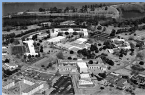
Chennault Circle in the 1970s with Air University Library in the Center

These changes placed a heavy strain on facilities at Maxwell. In early 1951, AU officials began planning for a modern, integrated academic campus for the command's expanding educational, research, and doctrinal development requirements. Over time, Academic Circle, renamed Chennault Circle in May