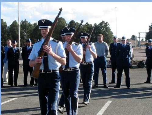
Air Force ROTC Unit Practicing Drills

The outbreak of the Korean War on 25 Jun 1950 interrupted AU's growth and stability. Air Force commanders argued they needed the personnel attending AU for operational commitments and that the Air Force should close AU. However, Air Force leaders, rather than closing AU completely, reduced its operations, suspended the AWC and the Air Tactical School, and reduced the length of the ACSS to less than four months.