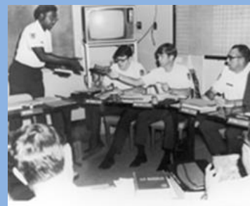
Air Force SNCO Academy Seminar at Gunter Annex

Secretary of the Air Force Donald B. Rice and the Chief of Staff of the Air Force General Merrill A. McPeak created a vision of an Air Force office that would inculcate the principles of total quality management across the Air Force. This concept, later known as the Quality Air Force (QAF), led to the establishment of the Air Force Quality Center on 1 August 1991 under AU at Maxwell. The center provided the Air Force with the concepts, methods, tools, and advice to aid them in attaining a QAF culture, as well as QAF education programs, consulting services, training resource materials, and related research and analysis services.