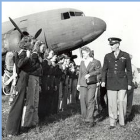
Jacqueline Cochran, Chief of the WASP, inspects women pilots at Maxwell

Maxwell Field, like other AAF installations, had its own segregated African American unit, the 4 th Aviation Squadron, established on 10 Jun 1941. Located near the Alabama River on the north edge of Maxwell Field, the present site of the federal prison camp, this segregated squadron had its own facilities. Although its official mission was stated as “security,” the squadron’s primary duties consisted of service as buglers, custodians, chauffeurs, drummers, foot messengers, hospital and mess hall attendants, military police, and truck drivers.