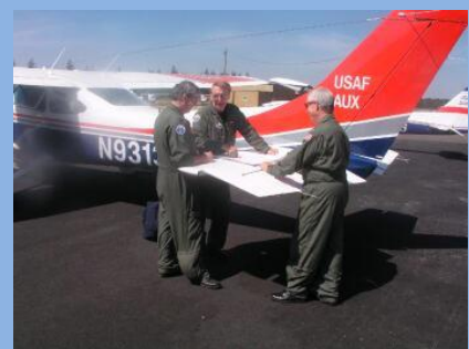
Planning a Civil Air Patrol Mission

During the 1970s, AU continued to grow. The Air Force established the Air Force Logistics Management Center (AFLMC) and assigned it to Air University on 1 October 1975. On that same day, the Leadership and Management Development Center (LMDC), HQ Civil Air Patrol-USAF, and the Air Force Judge Advocate General School joined the AU family. The following year, LMDC was merged with the AU Institute for Professional Development but retained its name.