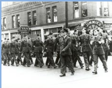
RAF cadets from Maxwell in Armistice Day parade, Montgomery AL, Nov 1941

In 1941, the War Department expanded Maxwell's flying training mission. The Air Corps established an advanced flying school at Maxwell and a basic school at Montgomery's Municipal Airport, became Gunter Field to honor the recently deceased mayor of Montgomery, William A. Gunter. By the end of the war, these schools graduated more than 100,000 aviation cadets.