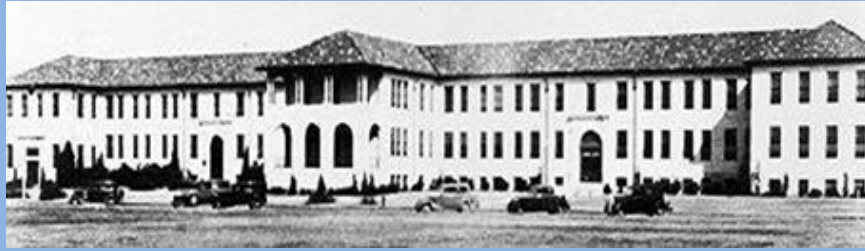
Austin Hall, Air Corps Tactical School, 1931, now Headquarters Air University

developed the basic concepts of high altitude, daylight precision bombing of industrial targets that became the basis for the strategic bombing of Germany and Japan during World War II.