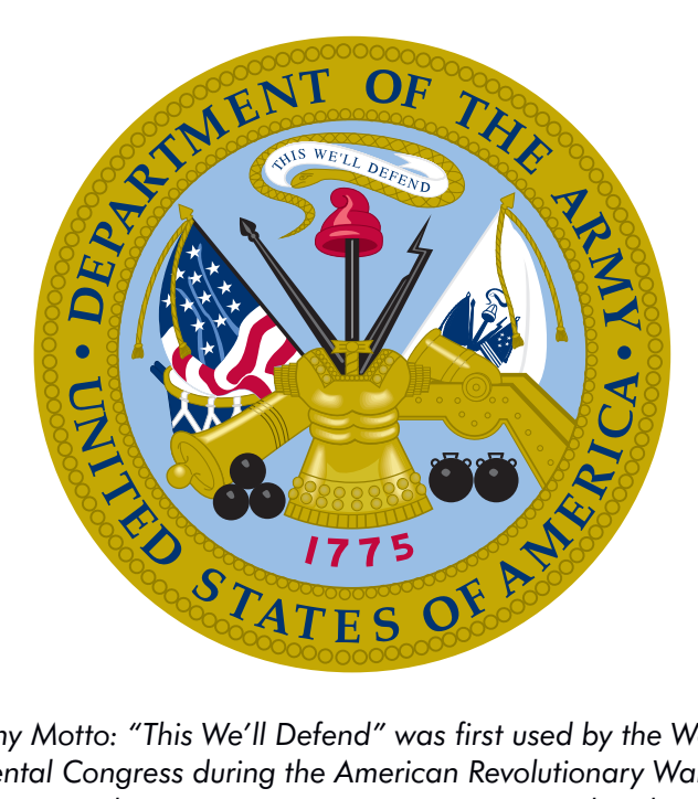
The US Army Motto: "This We'll Defend" was first used by the War Office of the Continental Congress during the American Revolutionary War. "This We'll Defend" is our simple motto stating our commitment and oath to defend the Constitution of the United States and the citizens therein.

The primary mission of the Army is "to fight and win our Nation's wars by providing prompt, sustained land dominance across the full range of military operations and spectrum of conflict in support of combatant commanders."