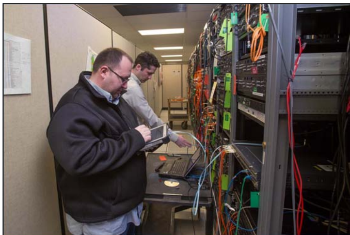
CANES submarine team members test new hardware.