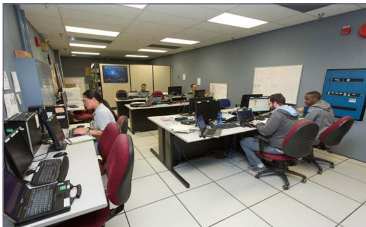
The Consolidated Afloat Networks and Enterprise Services (CANES) submarine team performs software analysis

Both CANES and CSRR are scheduled to be demonstrated at the Navy's Information Warfare Pavilion during the Sea Air Space Exposition in May 2016.