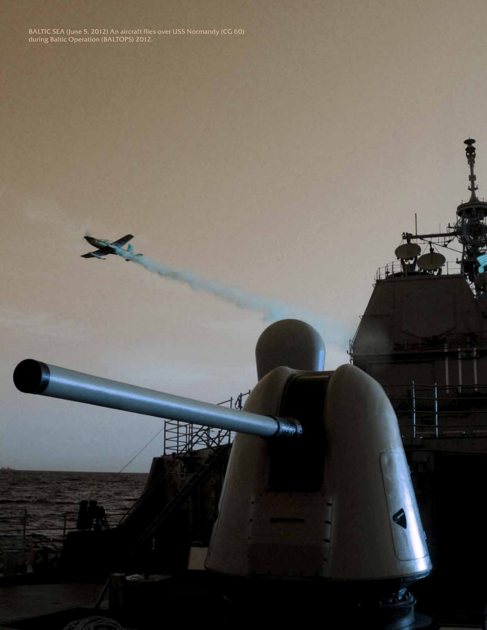
BALTIC SEA (June 5, 2012) An aircraft flies over USS Normandy (CG 60) during Baltic Operation (BALTOPS) 2012.