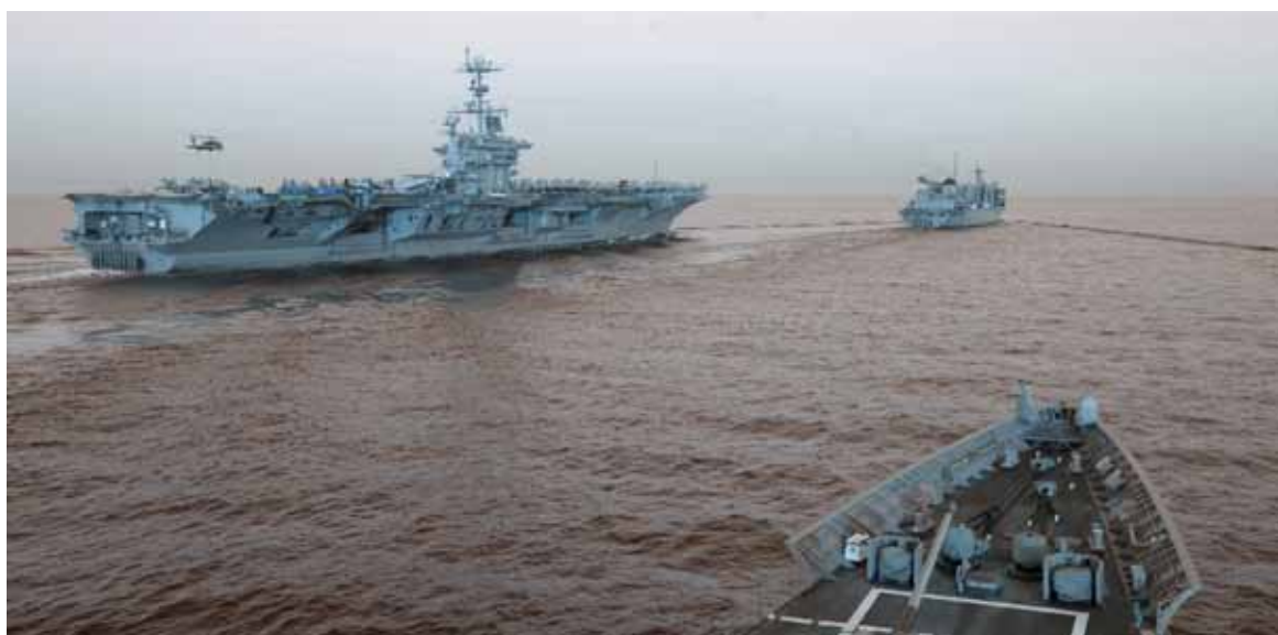
U.S. 5TH FLEET AREA OF RESPONSIBILITY (Jan. 2, 2013) USS John C. Stennis (CVN 74), USNS Bridge (T-AOE 10), and USS Mobile Bay (CG 53) (foreground) conducting theater security cooperation efforts.