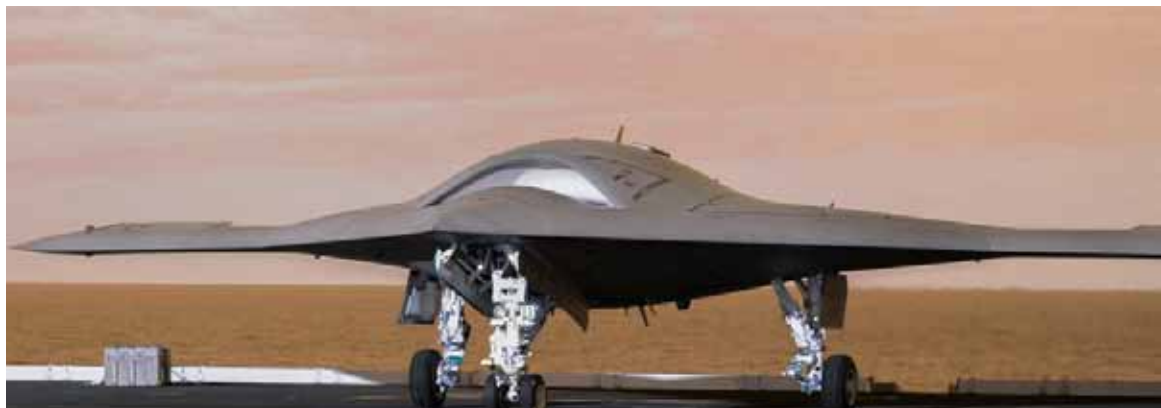
ATLANTIC OCEAN (Dec. 9, 2012) The X-47B Unmanned Combat Air System (UCAS) demonstrator taxies on the flight deck USS Harry S. Truman (CVN 75).

The projected operational and informational environments outlined above are driving the need for significant changes and improvements in how the Navy will use and protect its current, planned and forecasted information-based capabilities. Achieving Information Dominance under the three areas of Assured C2, Battlespace Awareness and Integrated Fires will require significant changes and improvements in the Navy's approach to managing its information infrastructure, content and effects, respectively. Navy's approach for advancing its future information-based capabilities are further outlined and described in the three chapters that follow.