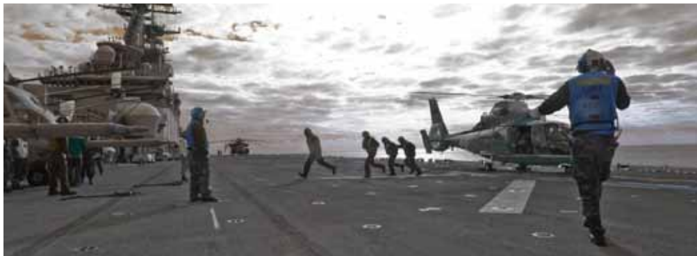
ATLANTIC OCEAN (Nov. 2, 2012) Flight deck operations aboard USS Wasp (LHD 1).