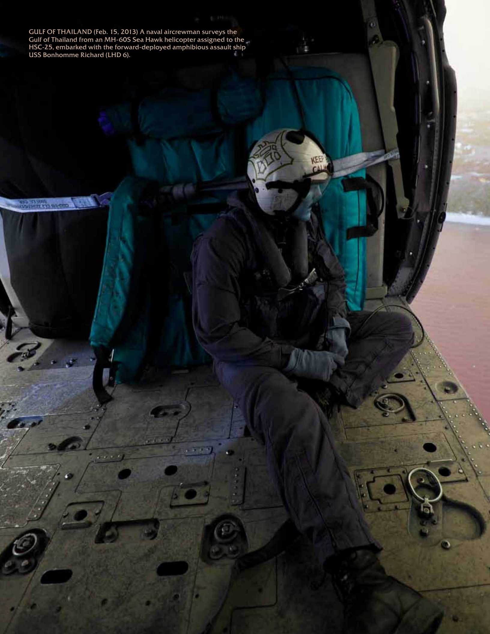
GULF OF THAILAND (Feb. 15, 2013) A naval aircrewman surveys the Gulf of Thailand from an MH-60S Sea Hawk helicopter assigned to the HSC-25, embarked with the forward-deployed amphibious assault ship USS Bonhomme Richard (LHD 6).