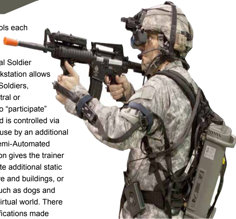
In Development: Dismounted Soldier Training System

New virtual scenarios are currently being developed to include the use of non-lethal systems and weapons. These scenarios will provide a realistic environment in which Soldiers will have non-lethal options to apply and enhance their escalation-of-force