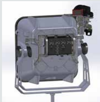
HALLTS large system (front and back)

Hailing, Acoustic, Laser, and Light Tactical System, known as HALLTS, is a single-operator, man-portable, hailing and warning system developed with Physical Security Equipment Action Group funding in FY12-14. HALLTS integrates an acoustic hailing device, a high-intensity white light and a dazzling green beam laser—all currently utilized by the U.S. Navy—with a common user control mechanism to enhance the ability of security forces to effectively execute escalation-of-force procedures. Scalable with three variants: small, medium, and large—for various mission scenarios.