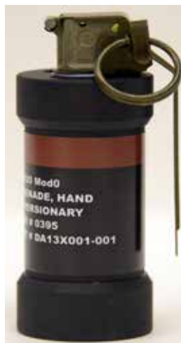
In Production: Improved Flash-Bang Grenade

Like the improved flash-bang grenade, the multi-bang grenade will provide flash incapacitation and reduced smoke output, with the additional capabilities of longer diversion and distraction induced by multiple bangs. The U.S. Special Operations Command intends to qualify an existing commercial off-the-shelf/non-developmental initiative system.