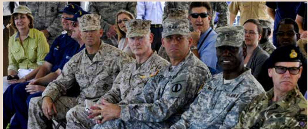
Department of Defense and Department of Homeland Security personnel, along with NATO representatives and professional staff members from the House Armed Services Committee, watch a maritime demonstration of the Active Denial System at Joint Base Langley-Eustis.

The long range non-lethal effects of Active Denial Technology can be used to clearly warn personnel on small vessels that are approaching too close to U.S. naval vessels and thereby exhibiting potentially hostile or threatening behavior.