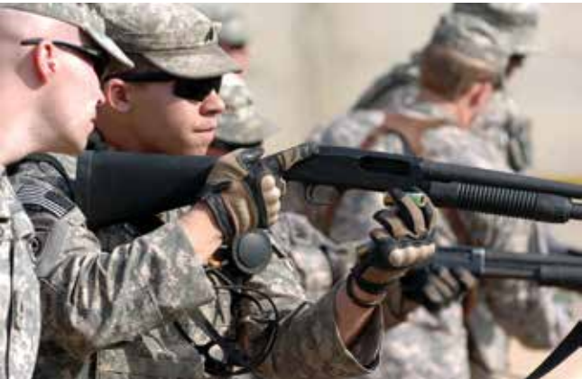
A non-lethal weapons instructor (far left) observes a Soldier as he loads a shotgun with non-lethal rounds during range training.