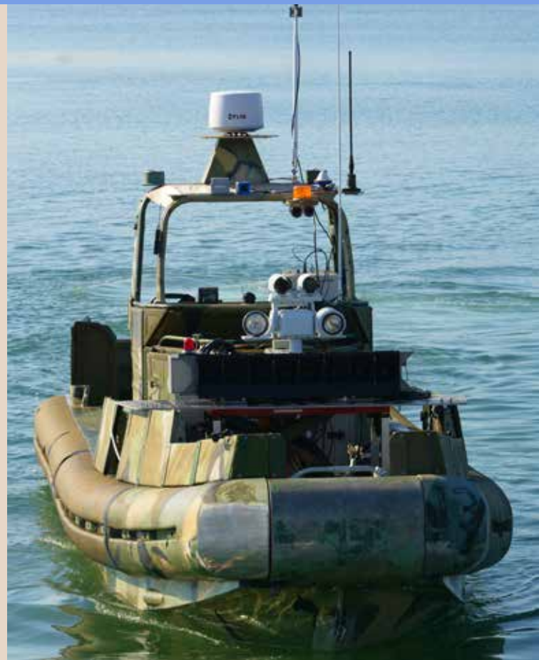
▲ Mini-DSLAs, a non-lethal, long-range acoustic/optical hailing device, was integrated onto a small unit riverine craft for a fleet experimentation at Marine Corps Base Camp Pendleton, Calif. (above and below)

This experiment was part of the U.S. Navy's Fleet Experimentation program directed by U.S. Fleet Forces Command. The FLEX program provides a holistic approach to collaborative and synchronized experimentation among government agencies, Joint and coalition partners, industry and academia.