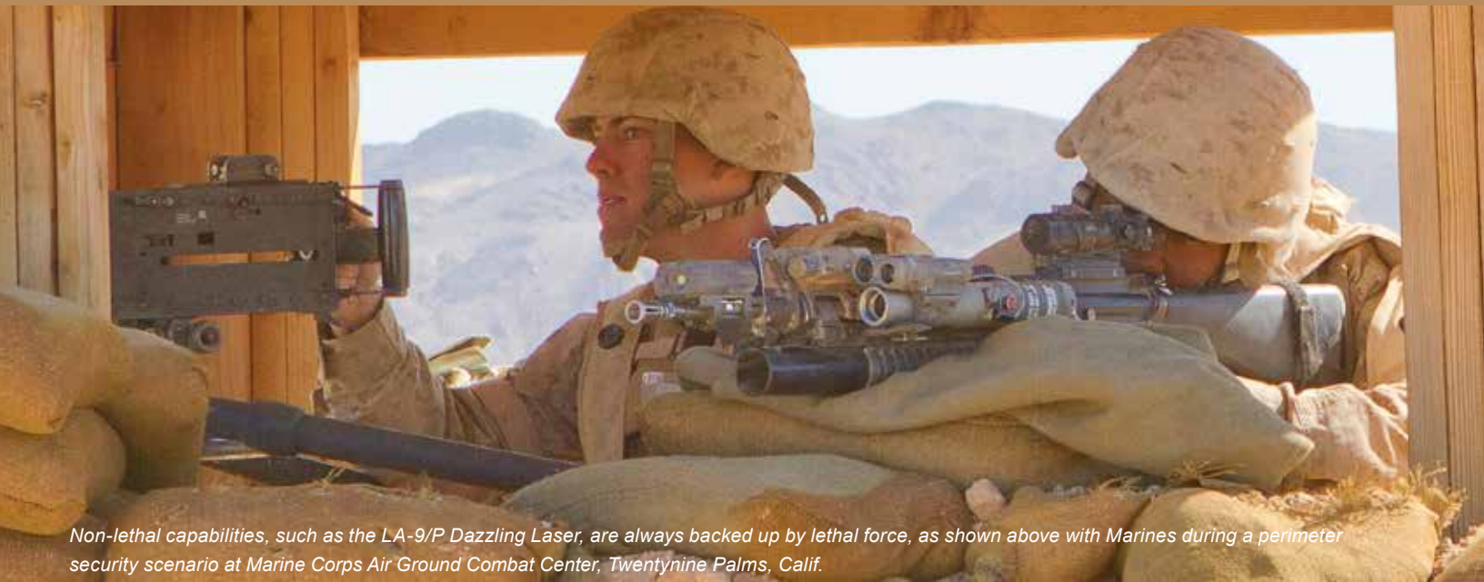
Non-lethal capabilities, such as the LA-9/P Dazzling Laser, are always backed up by lethal force, as shown above with Marines during a perimeter security scenario at Marine Corps Air Ground Combat Center, Twentynine Palms, Calif.