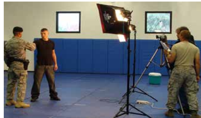
The Joint Electronic Tactics, Techniques, and Procedures Guides instructional videos, like the one being filmed below, help provide our Service members with state-of-the-art training.

There are six additional joint non-lethal modules and videos planned for 2014. Joint non-lethal e-TTPGs are critical investments to maintain core expertise in non-lethal capabilities and provide a library of standardized, state-of-the-art training materials.