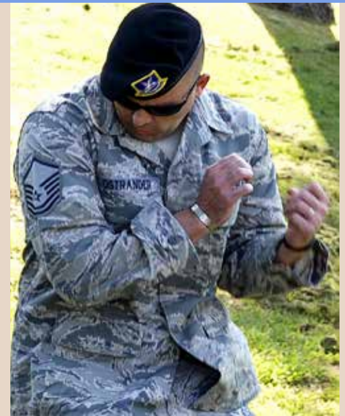
A U.S. Airman from Air Combat Command Security Forces reacts to a sudden "heat wave" produced by the Active Denial System.