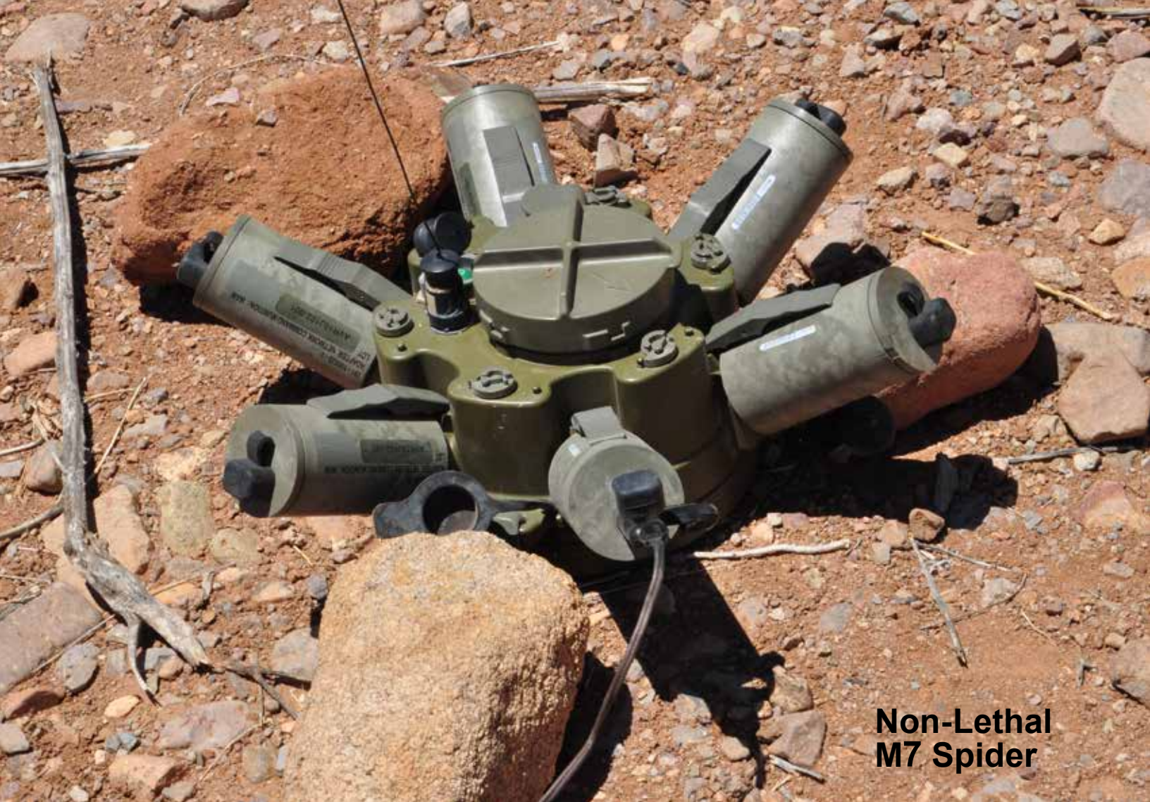
Non-Lethal M7 Spider