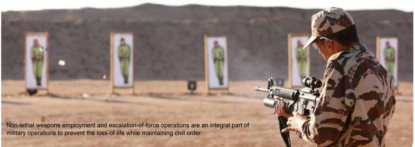
Non-lethal weapons employment and escalation-of-force operations are an integral part of military operations to prevent the loss-of-life while maintaining civil order.

can provide scalable solutions to deescalate and deter aggressors. By training and exercising forces in the use of non-lethal capabilities, commanders can potentially achieve not only tactical tasks, but operational goals and set conditions for achieving national strategic goals with the minimal required force,” Colonel Packer said.