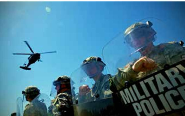
Charlotte, N.C.—A UH-60 Blackhawk flies over the Franklin Water Treatment Plant during a Rapid Reaction Force (RRF) exercise. The RRF exercise is an opportunity for the National Guard to highlight special skills such as non-lethal capabilities.

One of the three pillars of the Defense Department's defense strategy as highlighted in the 2014 Quadrennial Defense Review is to "Protect the homeland, to deter and defeat attacks on the United States and to support civil authorities in mitigating the effects of potential attacks and natural disaster."