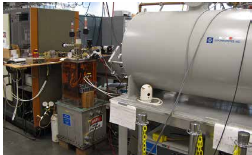
University of California–Davis Millimeter-Wave Research Center