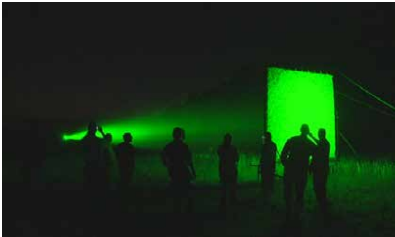
Long-Range Ocular Interrupter

The U.S. Navy is transitioning its Long-Range Ocular Interrupter, known as LROI, to a rapid deployment capability program for initial fielding.