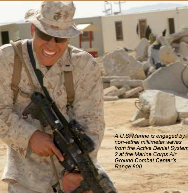
A U.S. Marine is engaged by non-lethal millimeter waves from the Active Denial System 2 at the Marine Corps Air Ground Combat Center's Range 800.

The DoD's Non-Lethal Weapons Program conducts rigorous military utility assessments to assess the utility and effectiveness of non-lethal capabilities as well as operational demonstrations to showcase potential value to the warfighter.