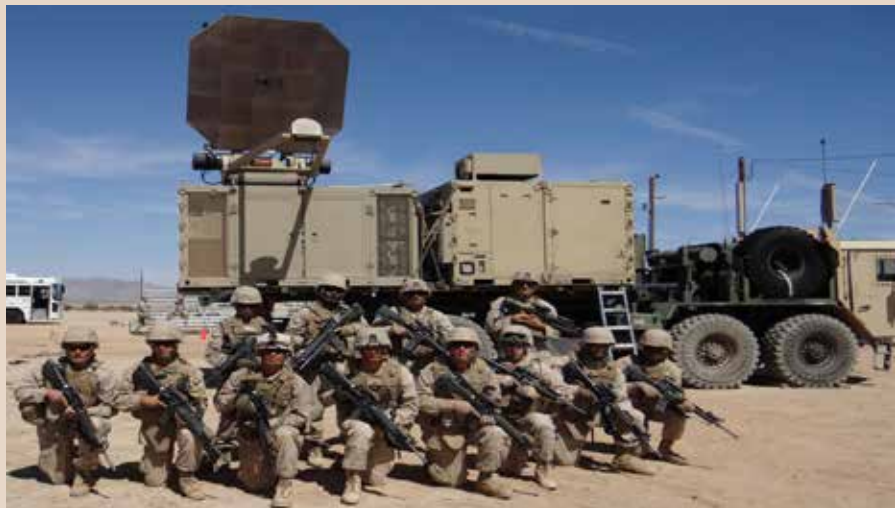
U.S. Marines supported a non-lethal weapons Perimeter Security Assessment for the U.S. DoD Non-Lethal Weapons Program at the Marine Corps Air Ground Combat Center's Range 800. Used in the assessment, the Active Denial System 2 provided advanced non-lethal direct-fire support.

During the demonstration, U.S. Marines conducted a foot patrol into a simulated village. The Marines employed ADS 2 to successfully move and suppress armed gunmen and snipers who were hiding among innocent civilians.