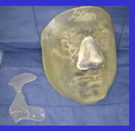
Figure 4: In Operating Room (Right) Example of the stereolithography face with an "ideal nose." The ideal nose has been covered in foil to achieve a grafting template. The "half nose" rhinoplasty guide, laying next to the face, is made from PMMA. The transparency of the PMMA is an added benefit to the surgical procedure. Cheek and forehead indexing tabs are located on the guide to verify proper translation/rotation with respect to the patient's face.

Nose Templates are digitally offset from the face and digitally cut to the desired shape. After verification and minor modifications, these guides are rapid prototyped and molded. Molds are then used to manufacture guides in PMMA. It has proved beneficial in the operating room to have both the entire nose and half-nose guides of the patient's "ideal" nose.