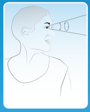
Blink often, focus on distant objects. Look up, down, sideto-side. Rotate your eyes.

For more information, visit www.cap.mil, or contact CAP T 703-614-8416, Videophone 571-384-5629, F 703-697-5851, Email cap@mail.mil