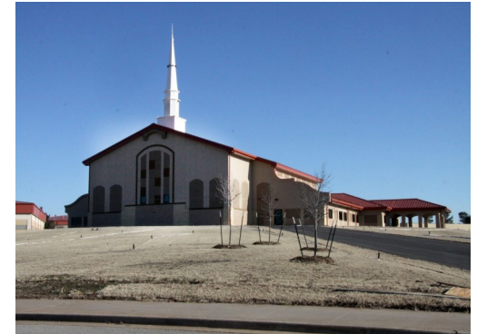
The New Cache Creek Chapel, Headquarters of The Fort Sill Religious Service Office

IET = Initial Entry Trainees (Basic Training soldiers)