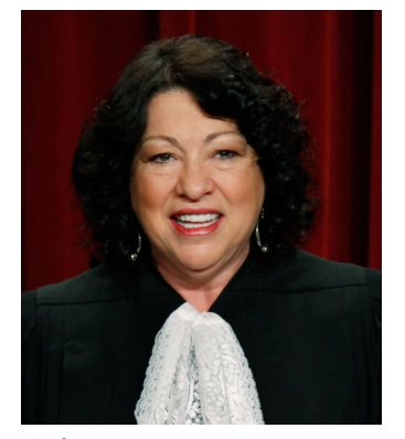
Baby Boomer Sonia Sotomayor Associate Justice, U.S. Supreme Court June 25, 1954—