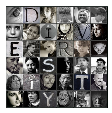
Our differences are something to be celebrated

Diversity is easy to understand – we share similarities and differences. Inclusion is the real challenge. The story goes this way. A tractor trailer driver stood outside his vehicle on a rural road wondering how he would get his vehicle and cargo under a low clearance bridge. He blasted himself for