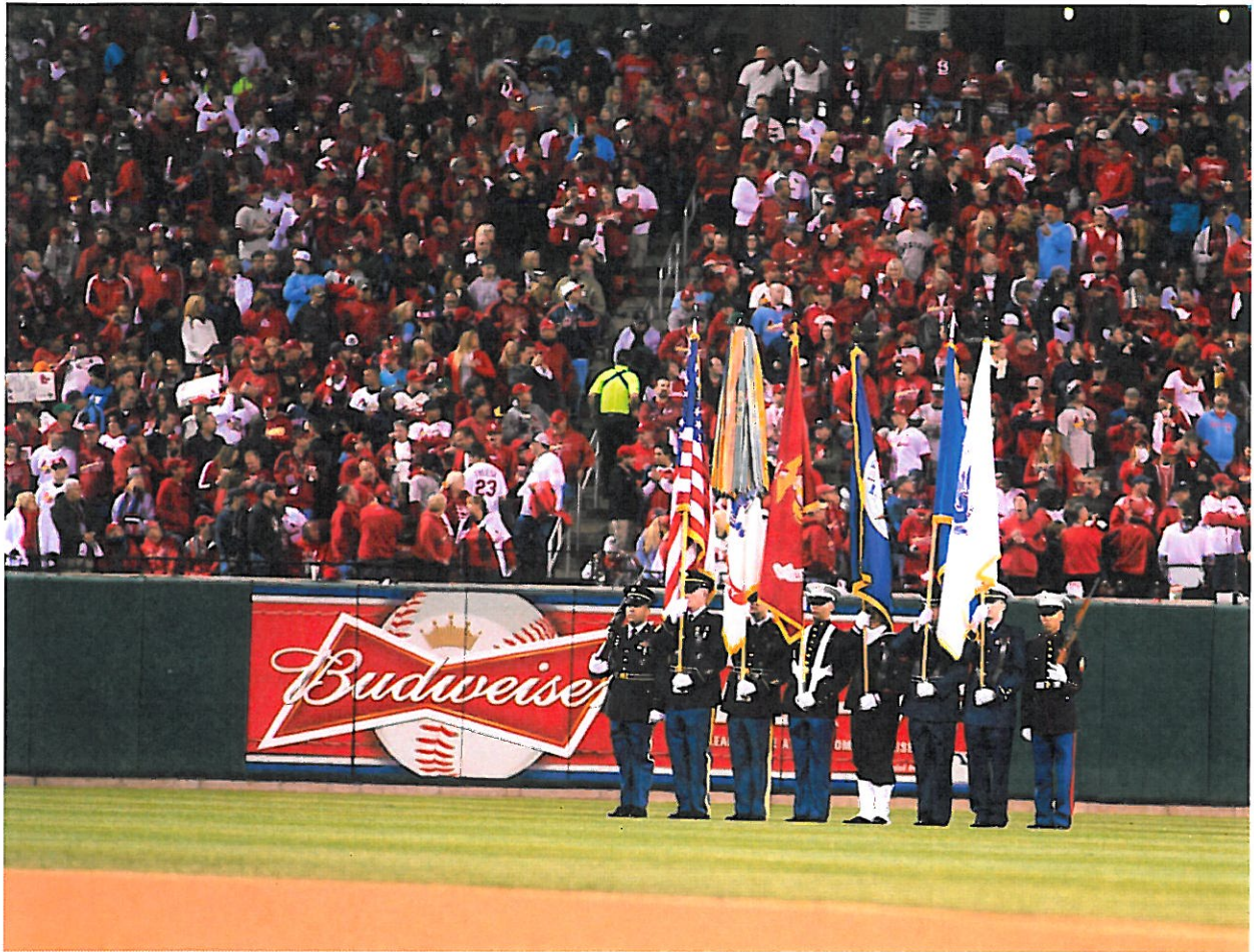
The Maneuver Support Center of Excellence and Fort Leonard Wood Joint Services Color Guard posts the colors at Game 4 of the 2013 Major League Baseball World Series, Oct. 27.