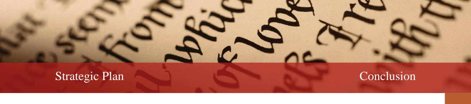
Figure 3: Strategic Planning Process