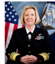
AFN –AFG, December 29, 2013 (Click on image to play video)