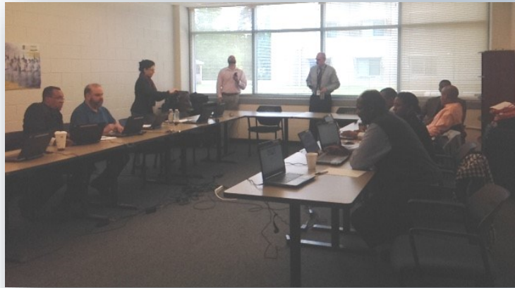
Members of the RCAS Training Team and the RCAS Prime Integrator DL Support Staff, set up and used the MDLC equipment to train various RCAS applications at the 260th Regional Training Institute (RTI), Fort Belvoir, VA.

The Army National Guard (ARNG) Distributed Learning (DL) Program creates content for Guard-specific training requirements, provides access to the content through GuardU (an online learning portal), and enables delivery through a nationwide network of 379 ARNG DL Classrooms. PL RCAS supports the ARNG DL Program as the fielding office for the ARNG DL Classrooms, providing workstation and audio/video equipment refresh, modernization fielding, sustainment services, and technical support to the State DL Program Administrators and the State DL Classroom Administrators.