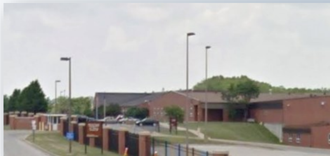
Multi-Component JAC location at the Kansas National Guard Armory, Fort Leavenworth, KS.