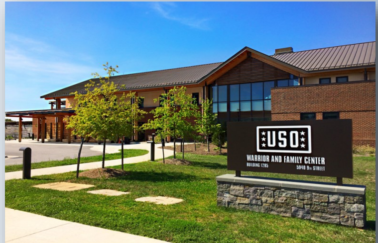
USO Warrior and Family Center, 5940 9th Street (Corner of 9th and Belvoir Drive), Fort Belvoir, VA 22060.

Strategic initiative updates were provided by the ARNG G6 and USAR CIO/G6 leadership teams, both highlighting current organizational structures and respective responsibilities. The USPFO Data Processing Advisory Committee representative communicated the desire for the State Data Processing Managers