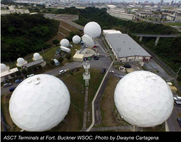
ASCT Terminals at Fort. Buckner WSOC.