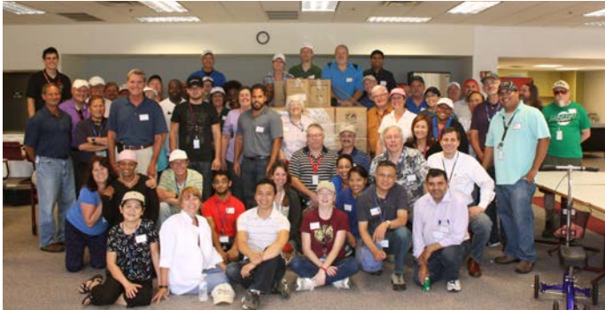
Participants pose in front of the pallet of food they packaged.