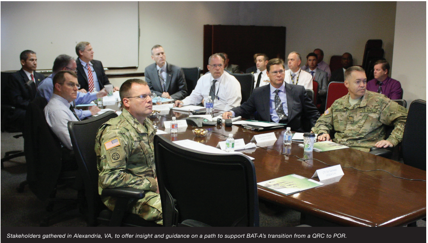
Stakeholders gathered in Alexandria, VA, to offer insight and guidance on a path to support BAT-A's transition from a QRC to POR.

BAT-A may be one of the first QRCs to transition to a POR, but the DOD does not intend for the trend to decline, as it has emphasized the need to develop efficient and effective methods to accelerate POR transitions. With that in mind, the PSM IPT developed their BAT-A strategy with the underlying intent that it will pave the way for future QRC transitions. As the BAT-A transition goes forward, the team will continue regular meetings with key stakeholders to ensure the process is handled diligently and that Soldiers feel no ill effects while moving into the new method of operation.