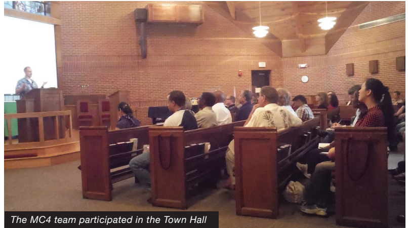
The MC4 team participated in the Town Hall