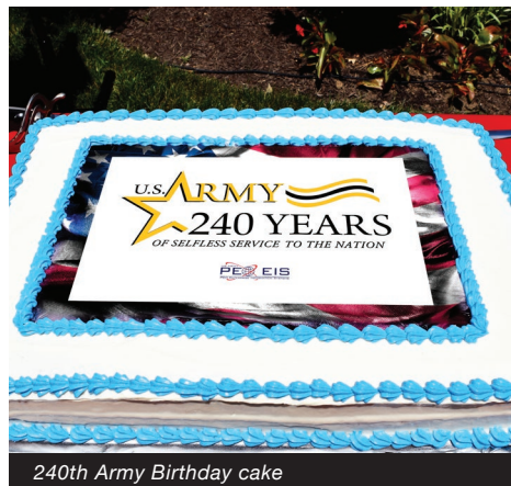
240th Army Birthday cake