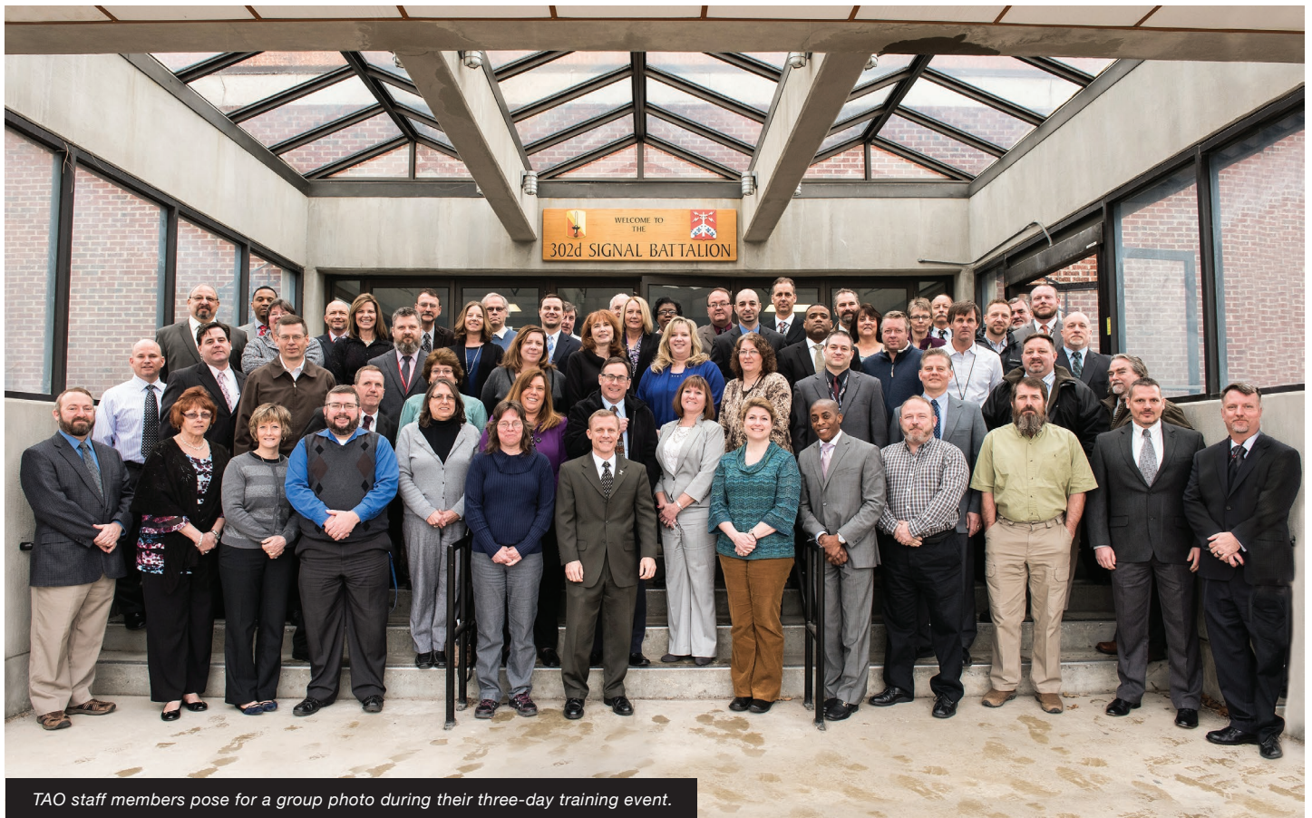
TAO staff members pose for a group photo during their three-day training event.