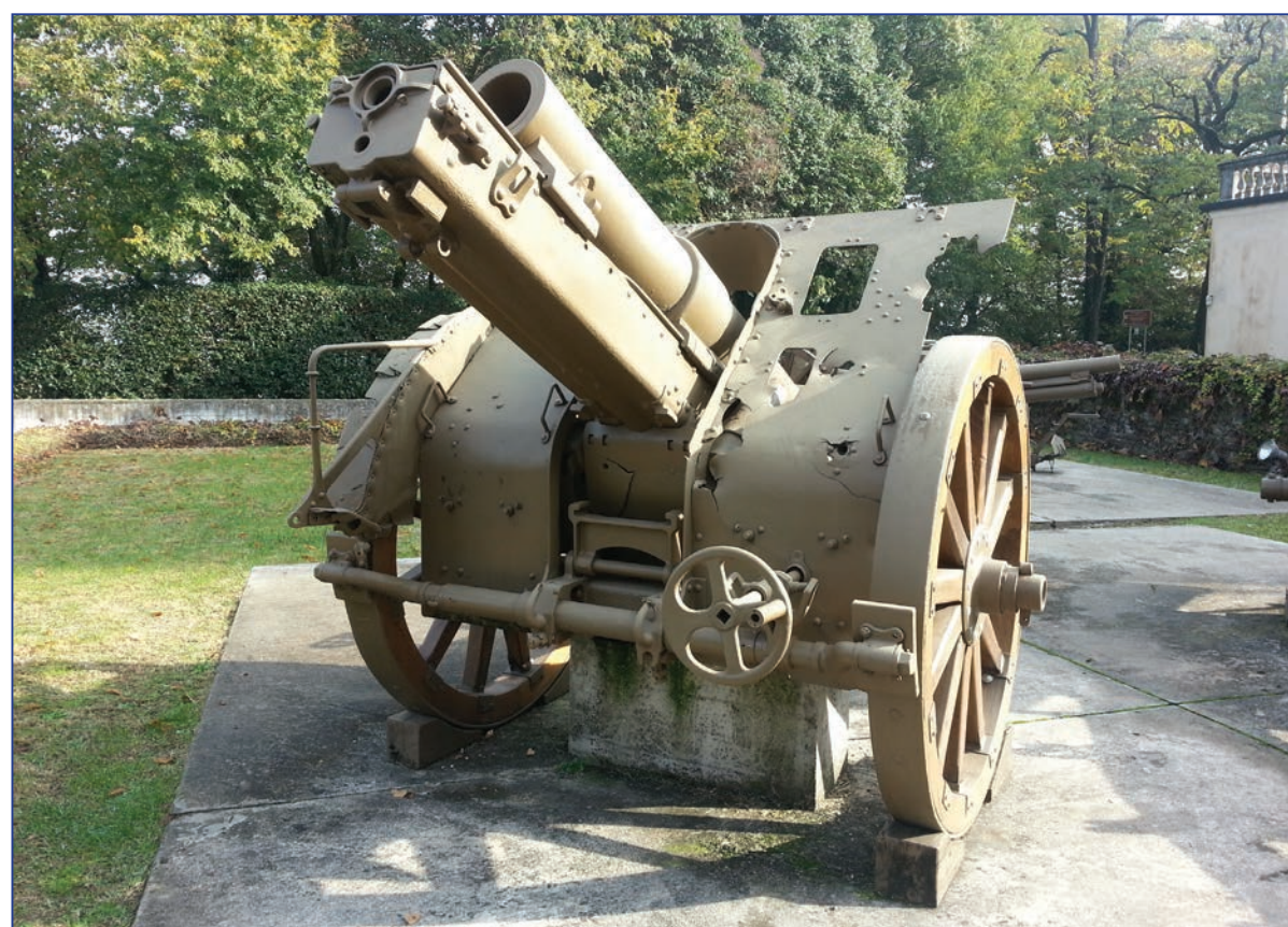
Above are two of many items on display at the Museo Del Risorgimento e Resistenza in Vicenza. Artwork, weaponry, uniforms and more are part of the exhibit.

Its first king Victor Emanuel II, as a monumental painting reveals, paid tribute in person to Vicenza's sacrifice in 1848.