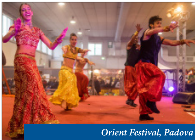
Orient Festival, Padova