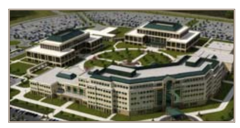
This rendering depicts how the Von Braun Complex at Redstone Arsenal will look when completed.