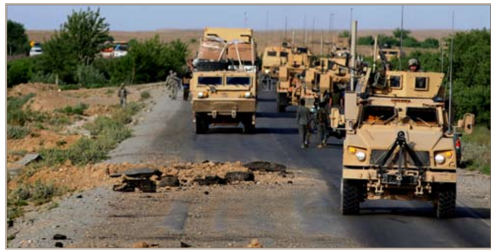
Reducing water and energy consumption at forward operating bases could reduce the number of supply convoys, placing fewer Soldiers in harm's way.

With Executive Order 13514's release in October 2009, CASI has become very active in helping USACE, the Army and the Department of Defense address the EO's many challenges. CASI formed a team, involving experts from ERDC and the Institute for Water Resources, to assist Headquarters, USACE, in the