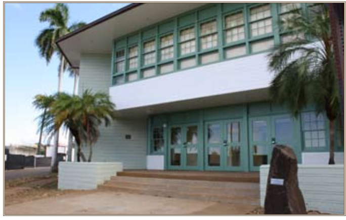
Fort Shafter's Aloha Center entrance, following the recent rehabilitation project, matches the original from the 1940s.

Federal law requires that all repairs, renovations and alterations to federal buildings are reviewed under the National Historic Preservation Act of 1966. The review process also requires consultation