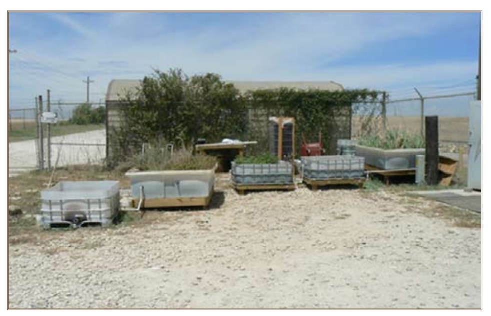
A novel microbial mat and polishing system did not meet pilot test goals for treating leachate from Fort Hood's landfill.

Collection , describes current Army solid waste collection and disposal practices. Because private contractors usually provide solid waste services, this PWTB presents alternative performance-based and resource management contracting concepts designed to save money and promote waste reduction.