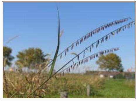
This closeup shows some of the native vegetation in CERL's demonstration plots.

In the final step in the process, the COR prepares a termination for default letter for the contracting officer's signature. The termination for default letter includes a summary of the termination decision and the findings of fact. The letter is very specific and detailed and incorporates supporting documentation. The COR also completes the contractor's final unsatisfactory performance rating for Office of Counsel