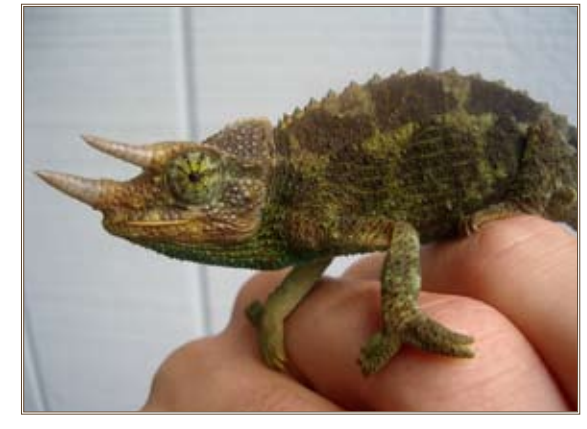
Native to East Africa, Jackson's chameleons were introduced to the Hawaiian Islands in the 1970s as pets but now may be a threat to an endangered snail.