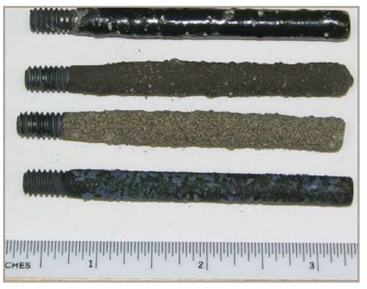
Engineer Research and Development Center has a patent pending for a novel vitreous enamel coating that prevents rebar corrosion.

It affords longer service life and less maintenance, and it allows builders to use 30 percent less steel, lowering construction costs. The product has multiple potential uses for infrastructure.