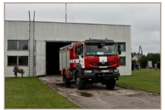
The Limbaži fire station is among 10 stations in Latvia that Europe District is renovating.

This year, Europe District's International Engineering Branch executed $8.9 million