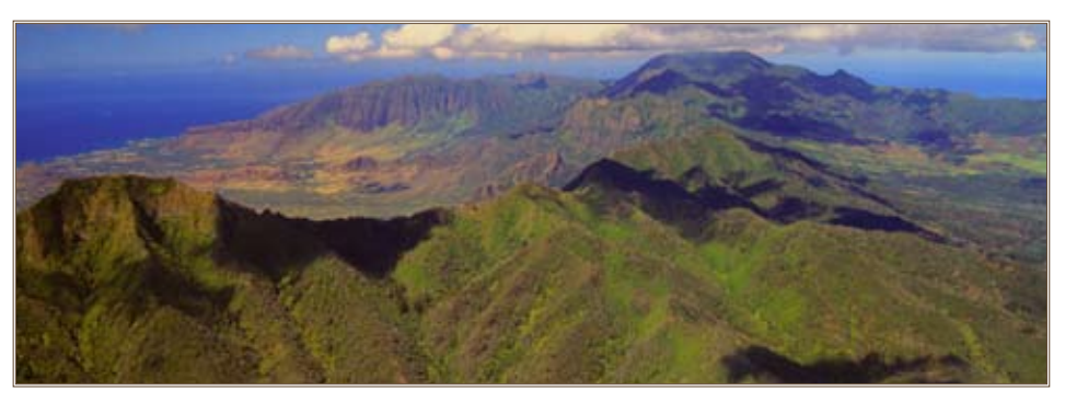
On the eastern slopes of the Waianae Mountains, U.S. Army Hawaii establishes and protects endangered species on the Honouliuli Forest Reserve, home to 39 threatened and endangered species, 16 of which are found nowhere else in the world.