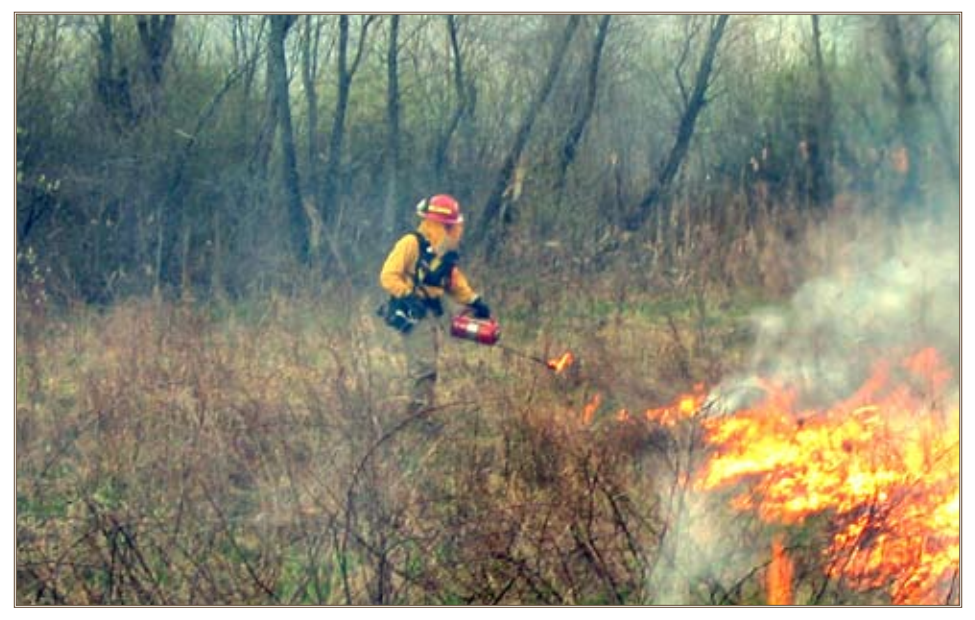
One PWTB reports on a study to model ozone precursors produced by prescribed burns at Fort Bragg.

Recycling at Fort Bragg , N.C. , reports the results of a JP-8 fuel recycling feasibility study performed for the fort.