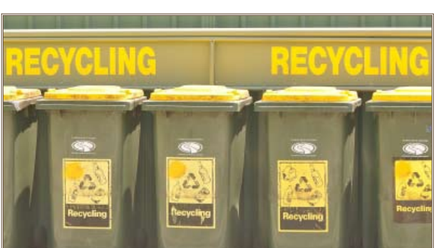
Recycling is now a common practice but not the only way the Army is diverting waste.

The long wait is over. The Qualified Recycling Program Handbook has been