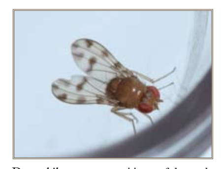
Drosophila montgomeryi is one of the newly identified taxa at Schofield Barracks.

OANRP staff remains concerned about the potential threat Jackson's chameleons have to the endangered snail. The public has been urged not to release pets, especially Jackson's chameleons, into the wild because of the potential threat to