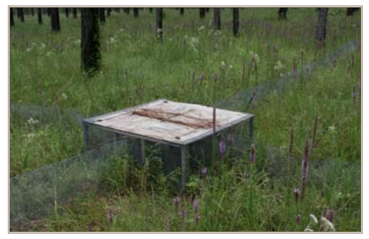
Traps are used to capture Louisiana pine snakes throughout areas of prime habitat, so that data can be collected from each captured snake.