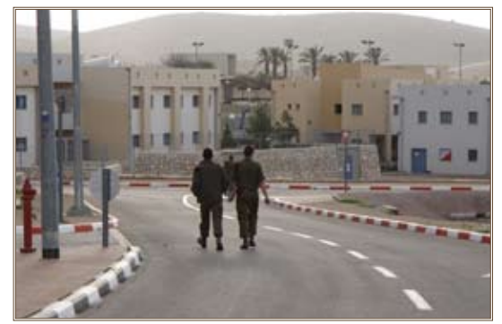
Israeli soldiers walk through Shomria, an Israeli basic training base constructed through the Corps' Europe District.

The district completed a $444,000 community center for children with special needs in Varvarin, Serbia, for Right to Smile, a Belgrade-based nongovernmental organization for parents of children with special needs. The school is one of roughly 26 projects the district is managing in Europe and Africa, including sites in Albania, Armenia, Croatia, Estonia, Georgia, Latvia, Moldova, Serbia, Mauritania and Kenya.