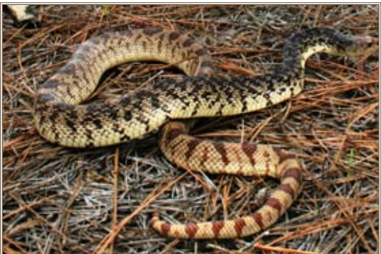
The Louisiana pine snake, a candidate endangered species, is a large, nonvenomous constrictor, usually 4 to 5 feet long and dependent for habitat on herbaceous layers and sandy soil like the longleaf pine ecosystems at Fort Polk, La.