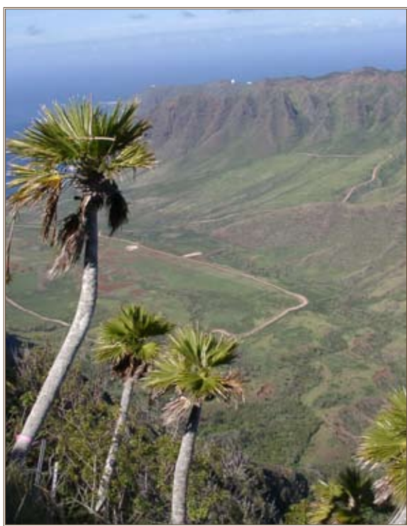
Wild Pritchardia kaalae grows at Ohikilolo, above Makua Military Reservation, Hawaii.

Jackson's chameleons, undeniably charismatic critters native to Kenya and Tanzania, have perhaps laid their final