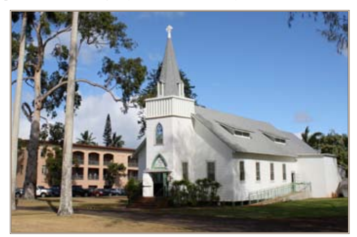
The renovated Soldiers Chapel at Schofield Barracks awaits rededication ceremonies.

with the State Historic Preservation Office for all properties 50 years old or older.