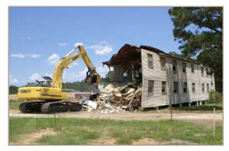
A backhoe takes down a 4,830-square-foot building, one of two structures at Fort Polk, La., demolished in 60 days by Huntsville Center's Facilities Reduction Program.

"Hazardous material such as asbestos was abated immediately, and sent to a separate facility," Hughes said. "We made