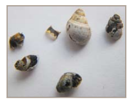
Fragments of endangered Kahuli tree snail shells are recovered from the stomach of one of the Kumakalii Jackson's chameleons.

Fence Unit, an area proposed for fencing to protect endangered species from threats by wild pigs and goats.