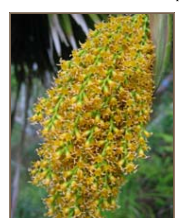
First documented flowers bud on a reintroduced Pritchardia kaalae.

Before management of P. kaalae began, only mature trees were found in the wild, with no