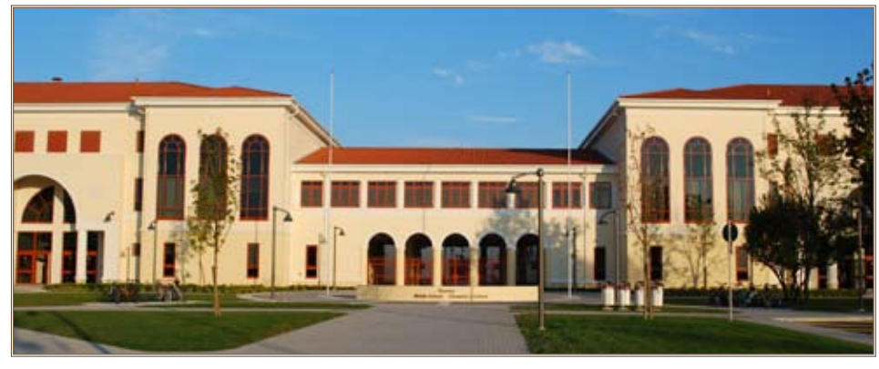
The USAG Vicenza military community's new school complex awaits the arrival of elementary and middle school children at the start of the school year.

In fact, the center provides several services that had been available only at the Landstuhl facility in Germany, saving Army patients an inconvenient 12-hour drive from Vicenza.