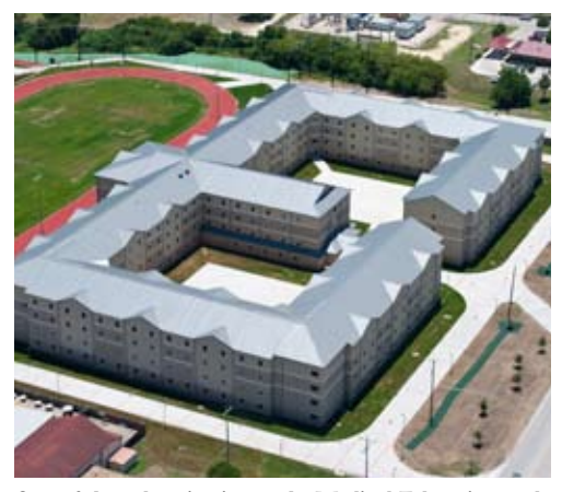
One of three dormitories on the Medical Education and Training Campus, which is geared to attain LEED Silver certification, is under construction.

Representatives of the Joint Program Management Office overseeing construction of the Medical Education and