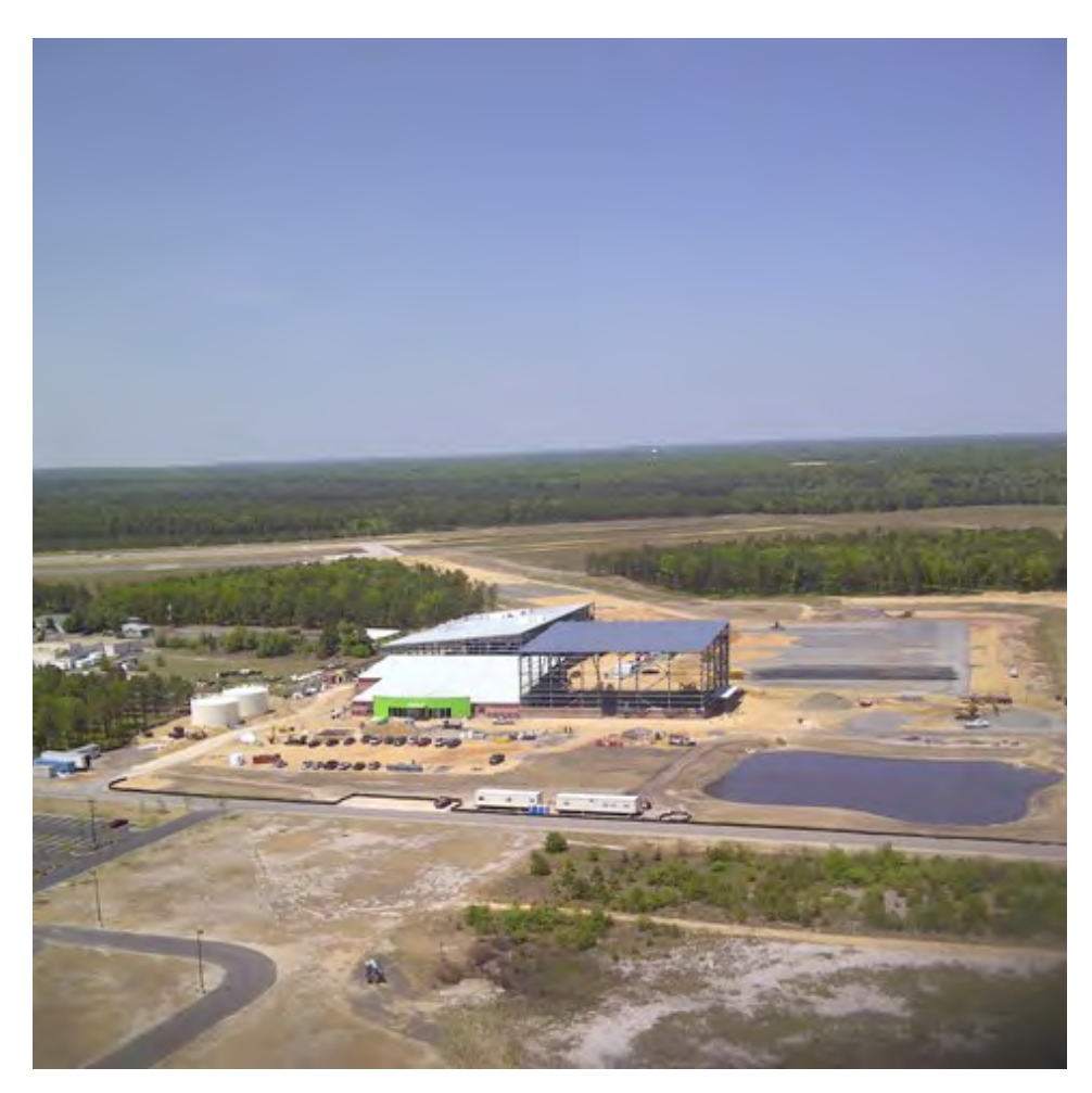
Aerial of complex under construction in May 2015.

"This will reduce the complex's energy consumption by approximately 44