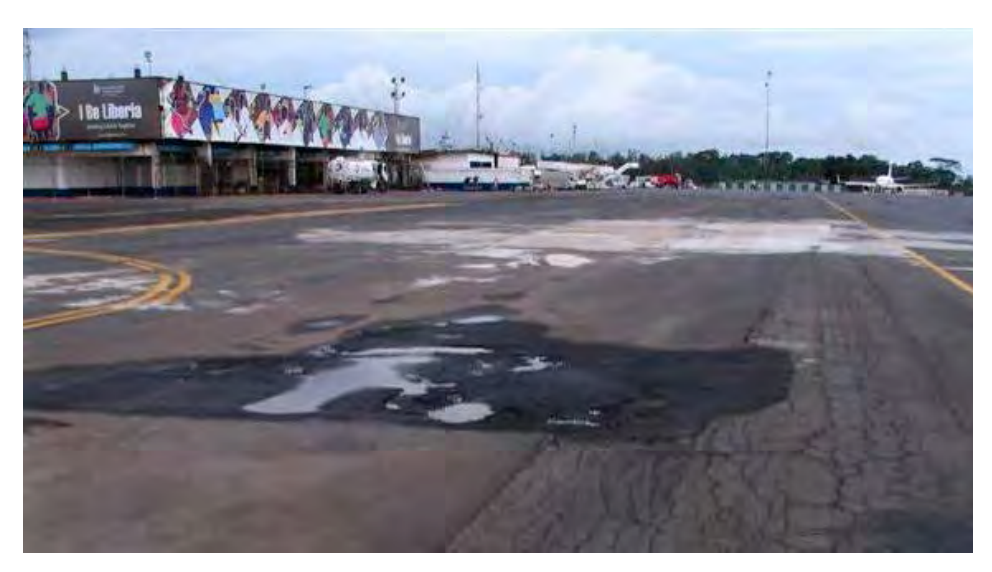
With pavement that is roughly 40 years old, Liberia's Roberts International Airport struggled under the demand for humanitarian aid in the midst of the Ebola Virus crisis.

Roberts International Airport remained in use throughout the evaluation.