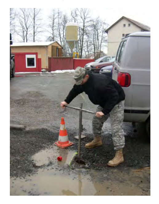
An Army lieutenant checks value operation on a 12" line at an installation.

Within this broadened paradigm, the degradation of distribution system piping and appurtenances and the existence of inadvertent contamination sources have been identified as vulnerabilities or critical concerns at many installations. These