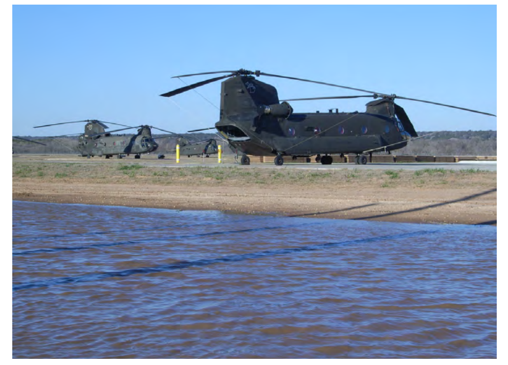
Ponding near Longhorn Airfield could create potential damage to important infrastructure and military equipment. A plan to improve stormwater was needed to reduce damages from storm events.

After repetitive flooding of real property and frequent complaints from Soldiers and civilians, Fort Hood made a change: budgeting a portion of Sustainment Restoration and Modernization funds