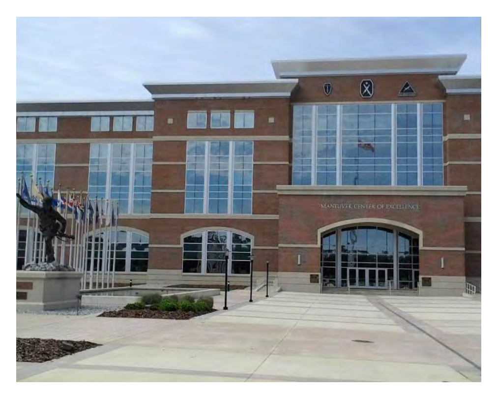
The newly renovated McGinnis Wickam Hall (headquarters for the Maneuver Center of Excellence), Fort Benning, Georgia.

However, due to budget constraints for this multimillion dollar renovation, utilities such as chillers and cooling tower units were not replaced. Upon completion of the renovation, the building was much better insulated, thus reducing demand on the existing 700-ton and 1,400-ton chillers