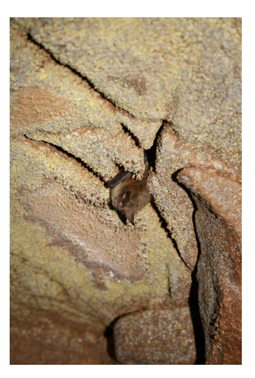
The northern long-eared bat hibernates in caves and mines in the winter and roosts underneath bark, and in cavities or crevices of both live and dead trees in the summer. The population has decreased significantly due to white-nose syndrome.

When the NLEB was listed by the USFWS as a threatened species under the ESA, the Army immediately recognized the impact this could have on operations. The NLEB has a historic range that covers all Canadian Provinces, 37 of the United States and the District of Columbia. In recent years the NLEB has seen up to a 99 percent population decline in surveys in the northeast. Declines are attributed to white-nose syndrome caused