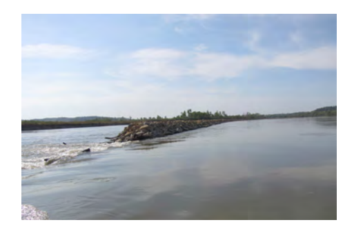
Revetment notch on Missouri River.

The annual Missouri River inspection, along with congressional funding to support needed repairs, are two key