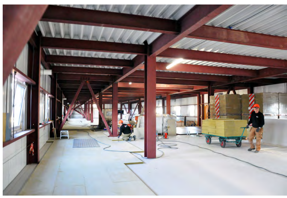
Contractors working inside one of the dormitories.

Fort Hood's increased focus on stormwater master planning has allowed the installation to realize a more cost effective and efficient approach to the management of surface water conveyance assets. The hydraulic models provide the necessary data to allow