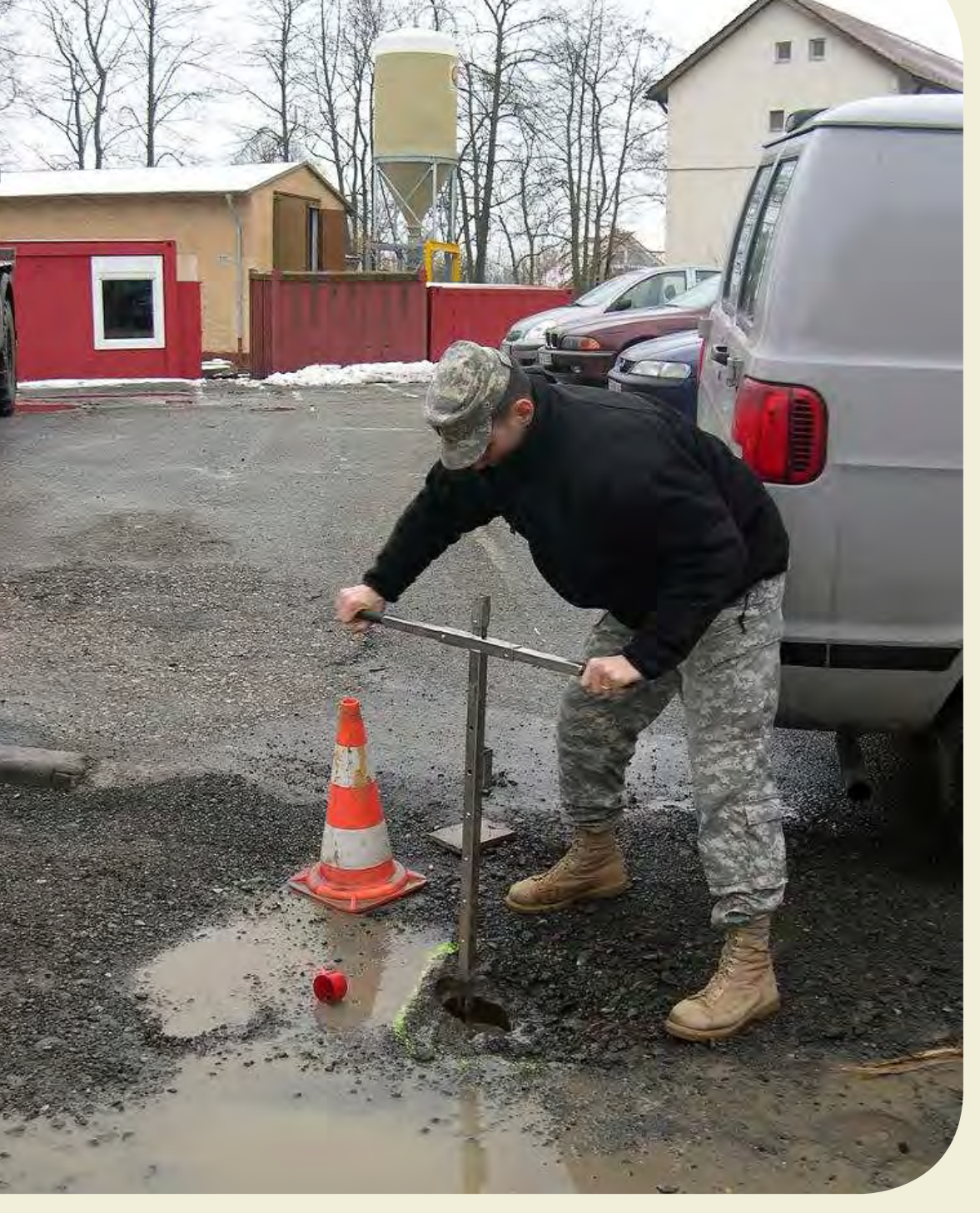
An Army lieutenant checks value operation on a 12" line at an installation.