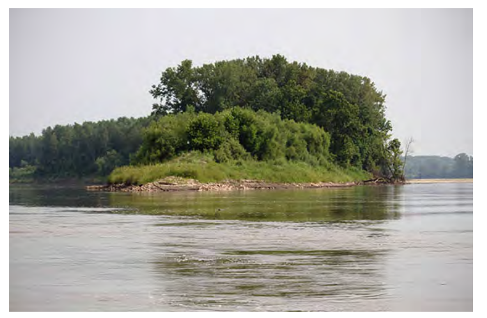
Missouri River Recovery Program Tadpole Island project site.

Annual inspections of the structures are intended to provide an overall assessment of maintenance needs for the BSNP. This effort begins after the water levels drop in