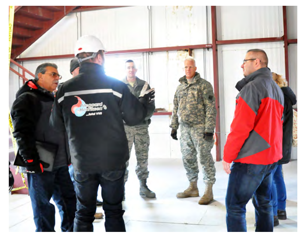
Engineering team discussing one of the dorm construction projects.

Because of permafrost, both dorms are being constructed with a special elevated Arctic foundation. If buildings are not constructed off the ground, the heat from inside the building can melt the permafrost, making the ground unstable and causing buildings to sink. The buildings need to be elevated 1 meter (39 inches) from the ground. Buildings are elevated with the use of spread footings that go down about 10 feet deep and concrete columns that come up and