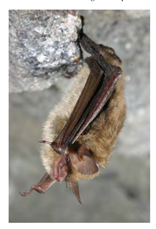
The northern long-eared bat has been listed as threatened by the U.S. Fish and Wildlife Service. The listing became effective May 4. The northern long-eared bat is one of the species of bats greatly affected by white-nose syndrome, which has spread rapidly across the eastern U.S. and been detected as far west as Oklahoma.

The regional programmatic approach was coordinated with Region 3 experts