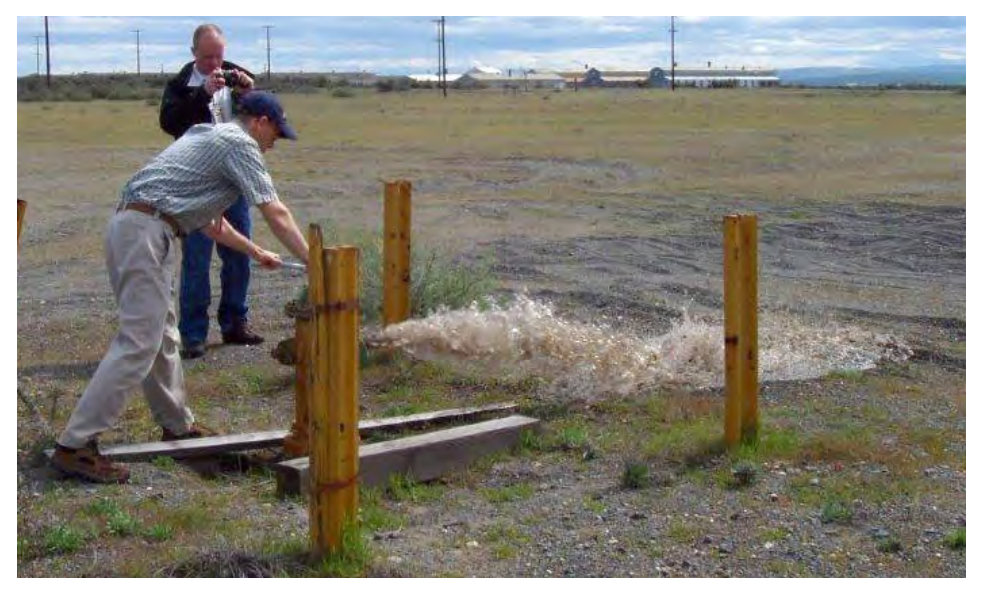
Personnel at Umatilla performing annual flushing. Courtesy photo

potential hazards create a majority of the disruptions seen in water systems, and they adversely impact the utility's ability to quickly respond and recover. Routine system maintenance has always been part of the operational plans and procedures for every distribution system; however, such programs have been significantly curtailed or completely eliminated as a result of prolonged reductions in Operation and Maintenance funding. In the short term, curtailing maintenance programs may save money with minimal effects immediately noted; however, within a very few years, the system will become quite impaired operationally and its ability to deliver consistent, high-quality water deteriorates.