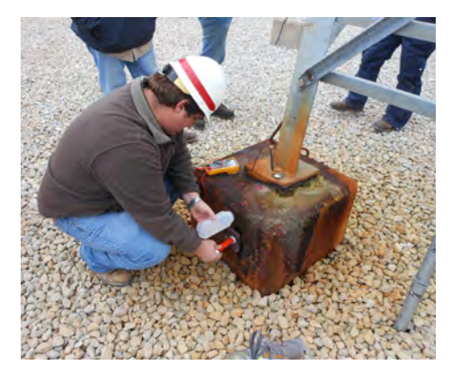
An ERDC engineer takes measurements on corrosion-damaged power transmission towers at Sam Rayburn Dam near Jasper, Texas.