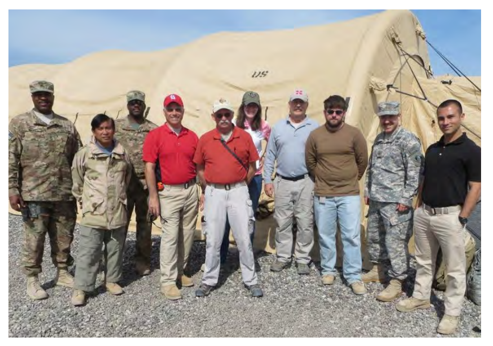
Members of the 542nd Forward Engineering Support Team – Advanced gather for a group photo at a camp in Iraq April 2015. The team is completing a six-month deployment supporting the Combined Joint Task Force with a wide array of engineering missions across the U.S. Central Command area of responsibility.