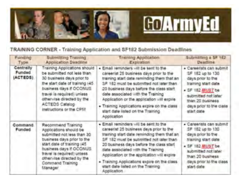
Army Civilian Training and Leader Development Division GoArmyEd Chart

Step five helps careerists maximize their competencies by encouraging them to use the GoArmyEd system (https:// www.goarmyed.com/) to apply for civilian education, training and leader development events.