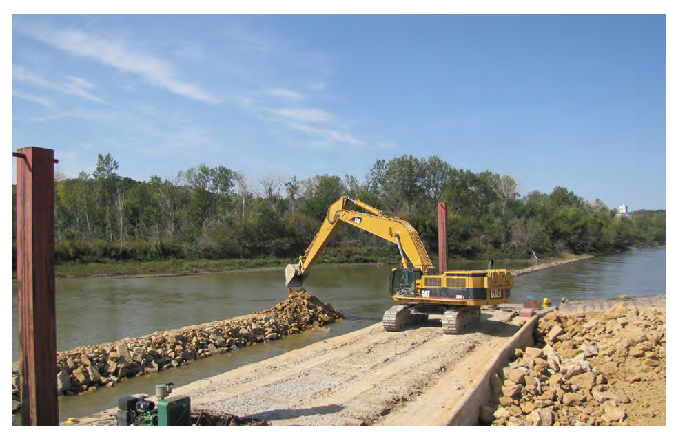
Contractor placing rock on a Missouri River revetment.