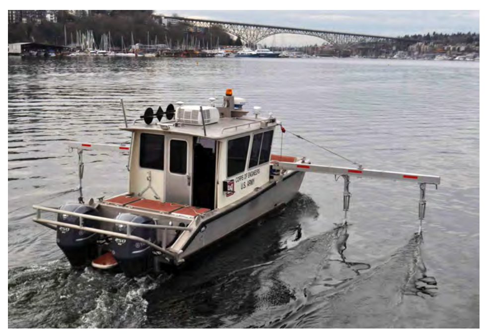
The 26-foot RGV-1 Munson boat undergoes a sea trial after being retrofitted with the Ross Sweep System. The vessel, equipped with a drop gate on the bow, can run a sweep-type survey along channels and single beam surveys when weather prevents deployment of the sweep booms. The Galveston District acquired this vessel in March to assist with its survey mission along the Texas coast.

Military training, aircraft operations and recreation are covered without restriction for all locations through meeting a determination of "May affect, but not likely to adversely affect" coded as NLAA. NLAA is a keystone principal of the informal consultation process to ensure "take" of a threatened