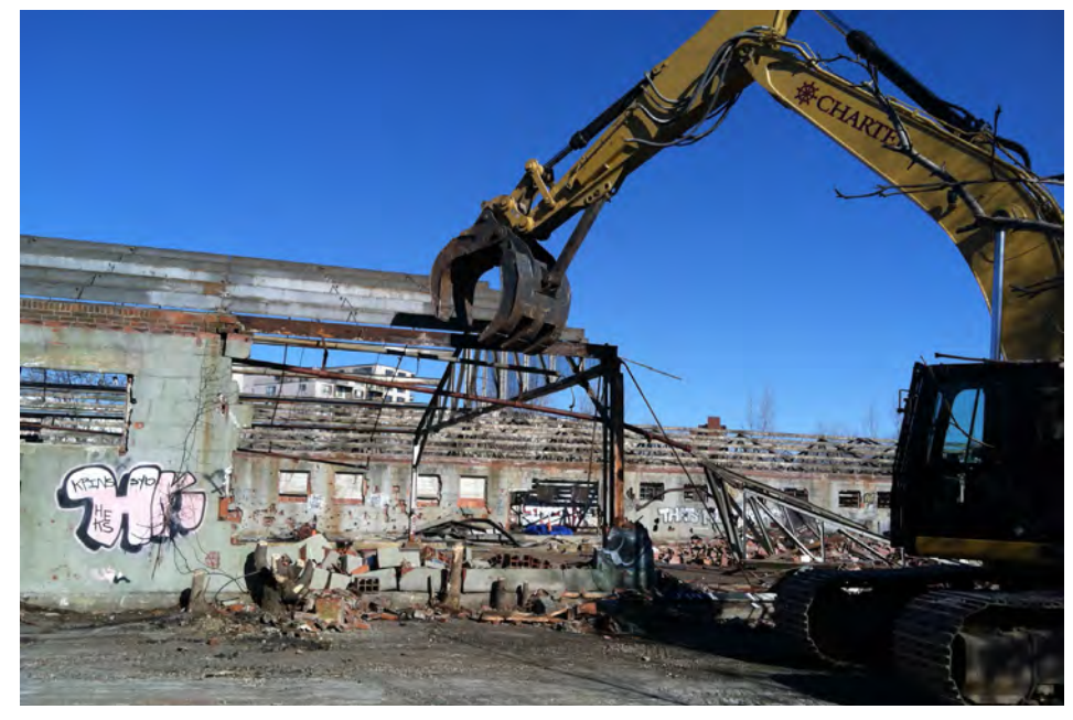
Buildings are demolished as part of the remedial action plan for the Watertown GSA Formerly Used Defense Site.

18 at the Marriott Hotel in Newton, Massachusetts. The U.S. Army Corps of Engineers, New England District along with contractor Charter Environmental and partners, GSA, the Massachusetts Department of Conservation and Recreation, Nobis Engineering, and the Massachusetts Department of Environmental Protection all had representatives at the event. According to the EBC, the team received