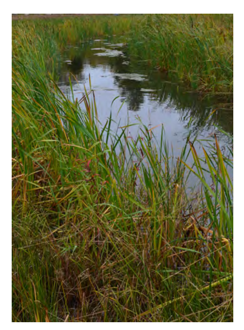
Remediated wetland at the Watertown Arsenal FUDS Site in Watertown, Massachusetts.

Charter Environmental of Boston, Massachusetts, and its subcontractor, Nobis Engineering of Concord, New Hampshire, mobilized to the site in November 2012. Remedial action work on the site included demolishing all the structures that were unoccupied and deteriorated, excavation and off-site disposal of 450 cubic yards of PCBcontaminated soil above 50 parts per