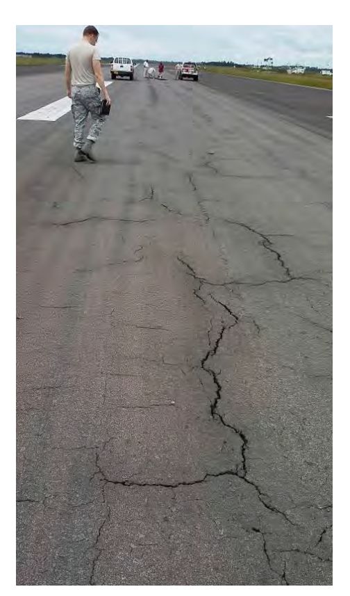
Severe block cracking and possible delamination can be seen throughout a runway at Roberts International Airport, Monrovia, Liberia.

were a number of critical issues with the pavements that had to be resolved before the humanitarian airlift operations intensified," Anderton said. "We provided three potential courses of action, with each one depending upon the projected mission timetable – short-term or three to five months; mid-term or six to 12 months; and long-term or years of