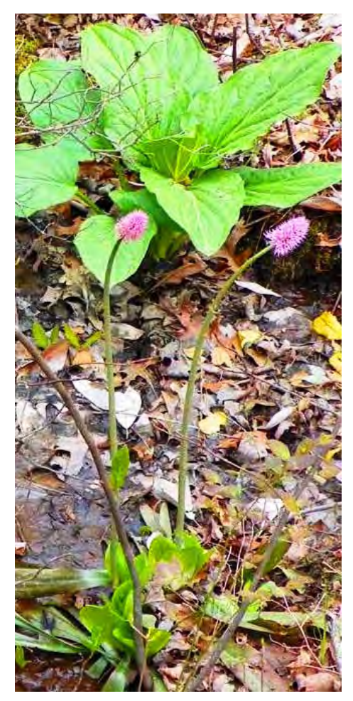
Swamp pink, Helonias bullata, a federally threatened and state-endangered plant, is protected on Fort A.P. Hill, Virginia, and included in their Integrated Natural Resources Management Plan.

The Department of Defense now requires military installations to consider climate change when updating their Integrated Natural Resource Plans. In response, A.P. Hill planned to update their INRMP with information about the