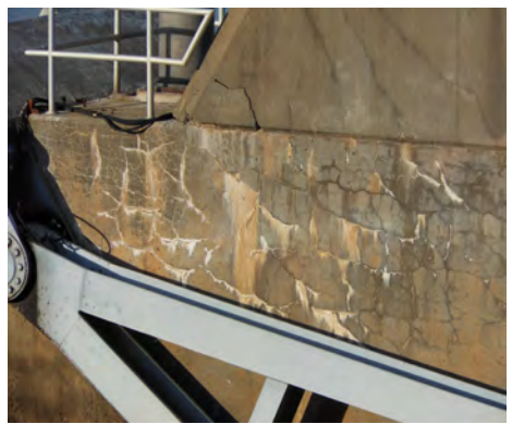
A severe alkali-silica reaction is shown in a dam pier at David Terry Lock and Dam in Pine Bluff, Arkansas.