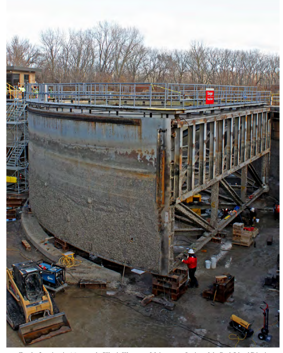
For the first time in 35 years, the Illinois Waterway Maintenance Section of the Rock Island District dewatered the gate bays at the Thomas J. O'Brien Lock in Chicago, Illinois, to raise and repair the 255,000pound sector gates. The large sector gates found at the T.J. O'Brien Lock are different from other gates used throughout the district because they have the ability to move water both directions through the lock.

raising the 255,000-pound structure. Typically when repairs are needed at the other locks and dams in the district, the Maintenance Section uses a large crane to lift the gates and take them to an offsite location for repairs. Due to limited access to the T.J. O'Brien Lock and Dam