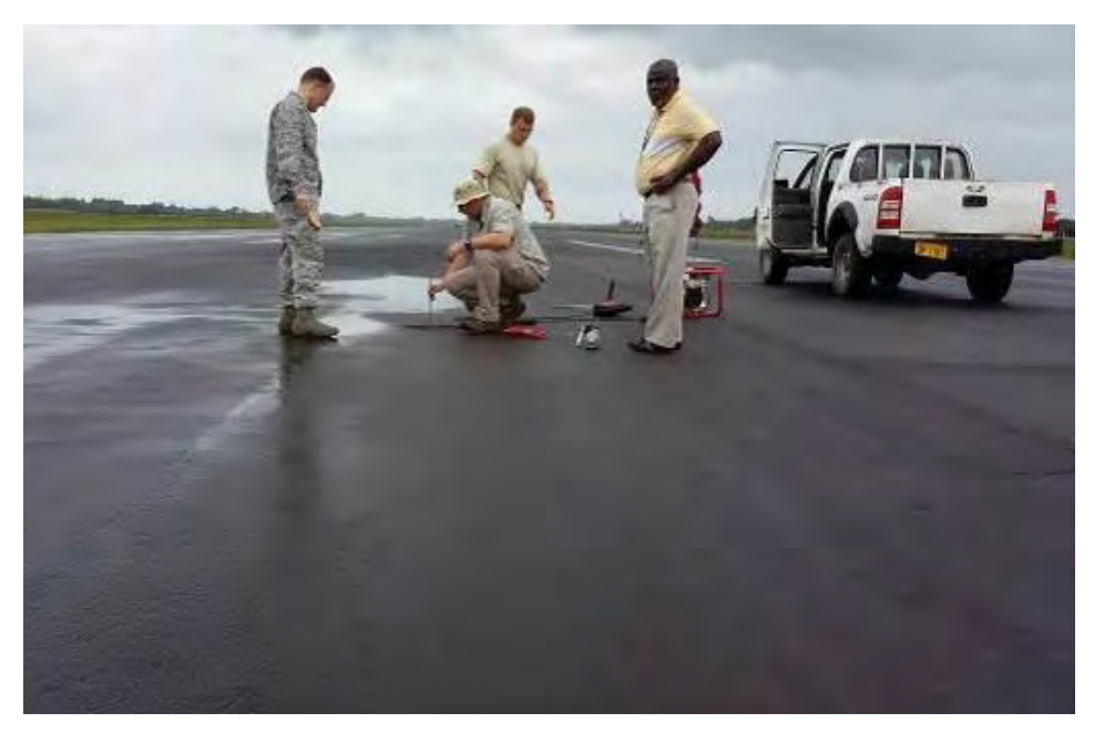
A depression, the result of a failed subgrade and the source of multiple issues, is examined at Roberts International Airport, Monrovia, Liberia.

Humanitarian aid flows heavily through the area in the form of doctors, medicine and supplies and clinics have been built near the airport site for easy access. Continued operations are vital to the people of Liberia – of those 27,000 plus cases, almost 11,000 have occurred in