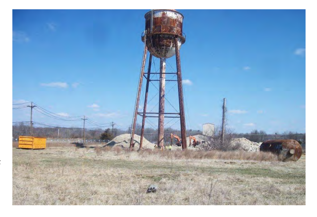
The U.S. Army Corps of Engineers, Huntsville Center's Facilities Reduction Program completed a project to demolish a water tower that was originally part of an old boiler plant at Aberdeen Proving Ground, Maryland.

"FRP has a programmatic landfill diversion rate of approximately 72 percent by weight on all demolition over the last 10 plus years," Shockley said. "FRP uses competition between expert demolition contractors to maximize the salvage value of recyclable materials to offset the cost of demolition. On this project, workers recycled uncontaminated concrete and asphalt, stone, steel, grass and soil from the water tower and surrounding area. The contaminated materials were disposed of in the proper manner.