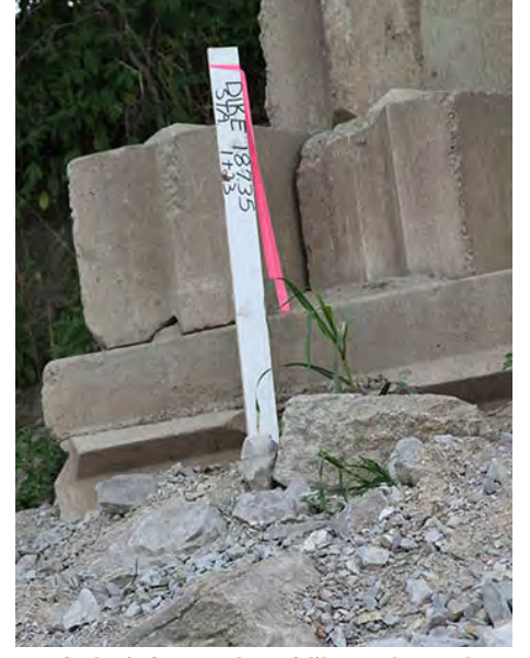
Stakes inform workers of dike numbers and locations.