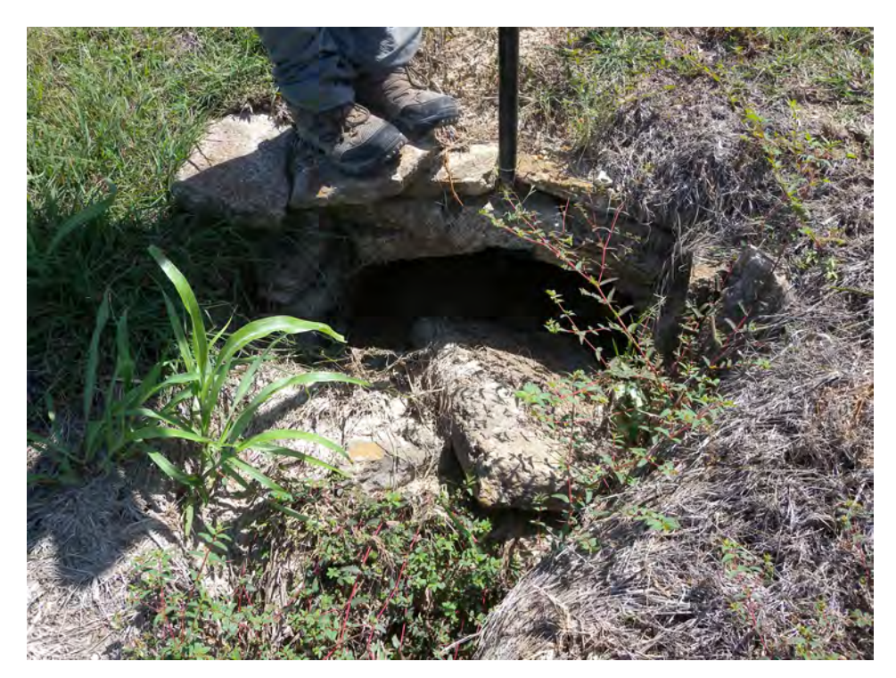
Inventory and Aging Infrastructure. Survey grade information of stormwater infrastructure was taken. Examples of aging stormwater systems was evident and recorded during the inventory.

Once flooding locations were identified, the models were used to determine what types of improvements could prevent or alleviate potential and existing flooding issues. After considering preventative maintenance, aesthetics and environmental impacts, chosen alternative solutions