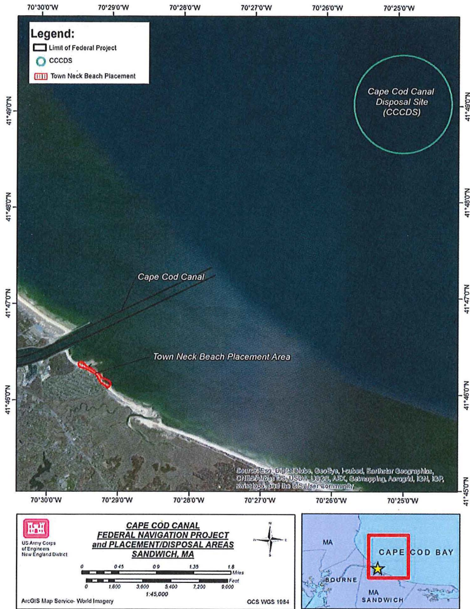
Map of Proposed Placement/Disposal Sites