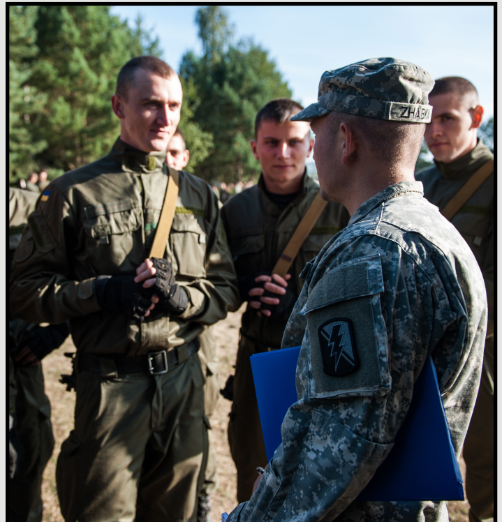
A California National Guardsman talks to a group of Ukrainian National Guard Soldiers during Rapid Trident 16 in Ukraine.