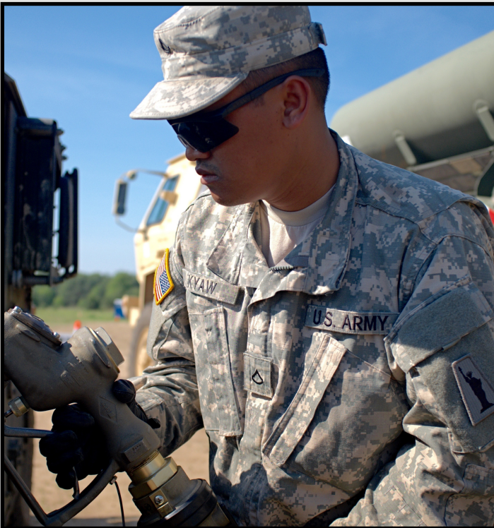
A U.S. Army Reserve Soldier from 716th Quartermaster Company fuels a HMMWV during Anakonda 16 in Poland.