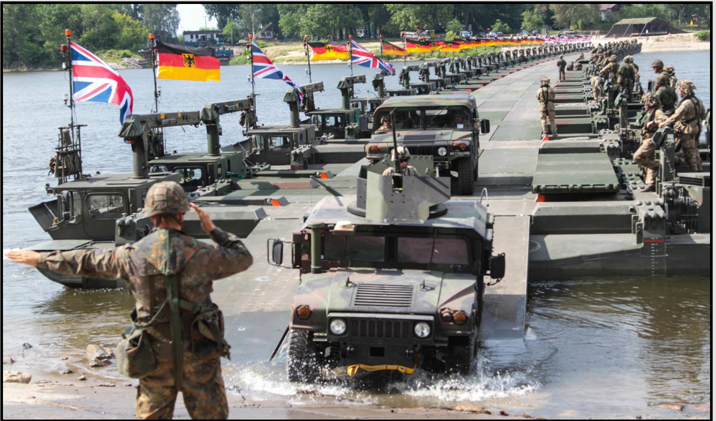
U.S. Soldiers drive vehicles over an M3 bridge during a water crossing mission conducted as part of Anakonda 16 in Poland.