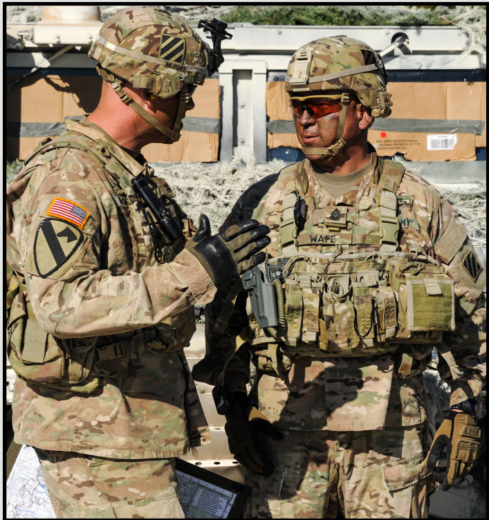
Soldiers from 3rd Infantry Division discuss their mission during Combined Resolve VII in Germany.