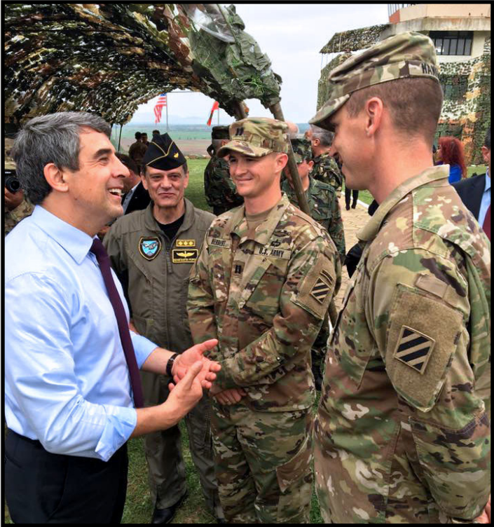
3rd Infantry Division Soldiers talk to the Georgian President at the Noble Partner 16 opening ceremony in Georgia.