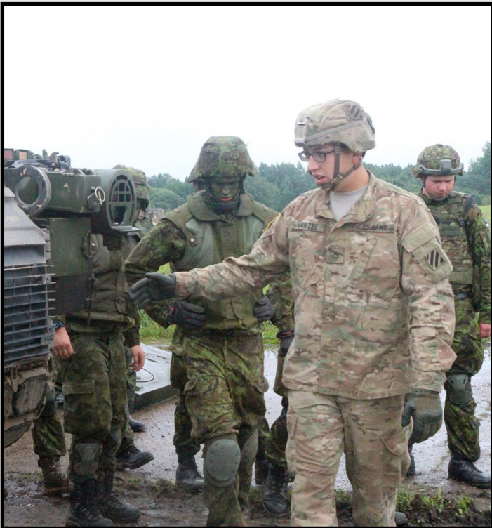
A 3rd Infantry Division Soldier discusses vehicle set-up with Estonian Soldiers in support of Atlantic Resolve in Estonia.