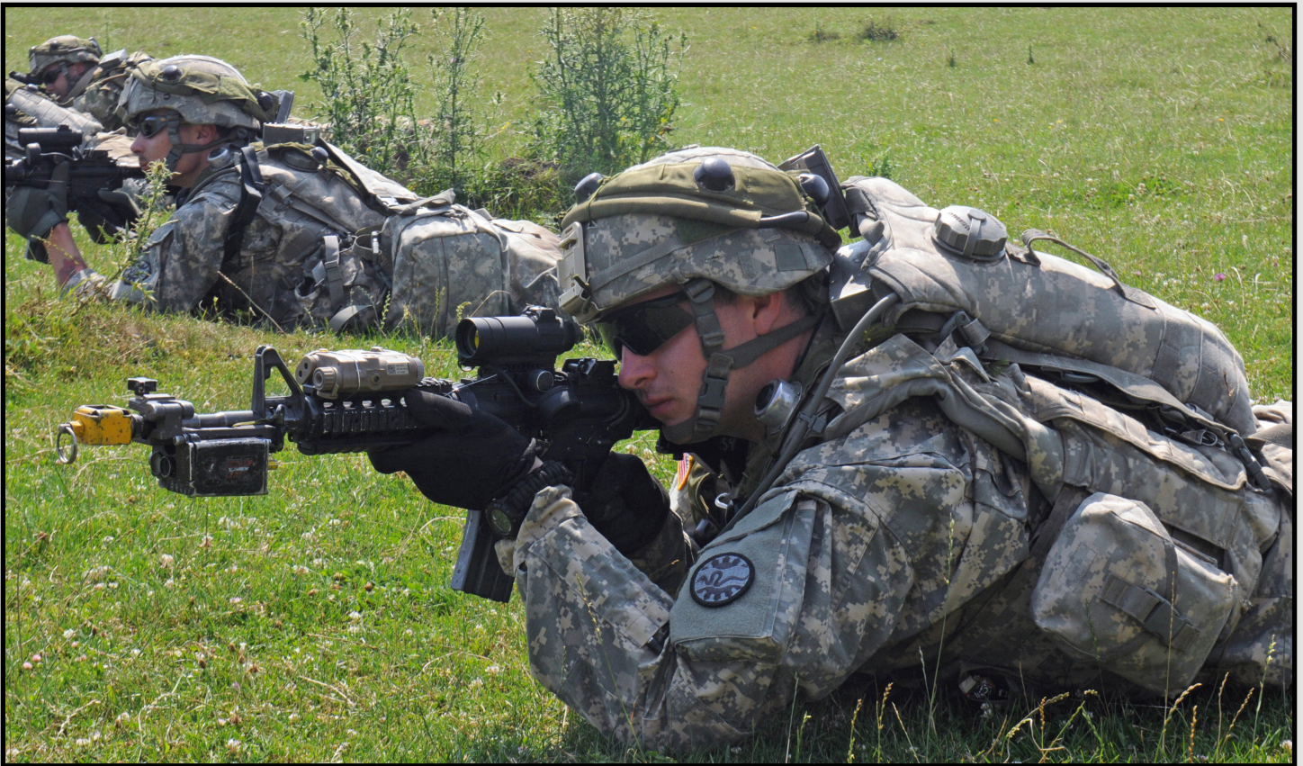
Idaho Army National Guardsmen take up defensive positions during a situational training exercise at Saber Guardian 16 in Romania.