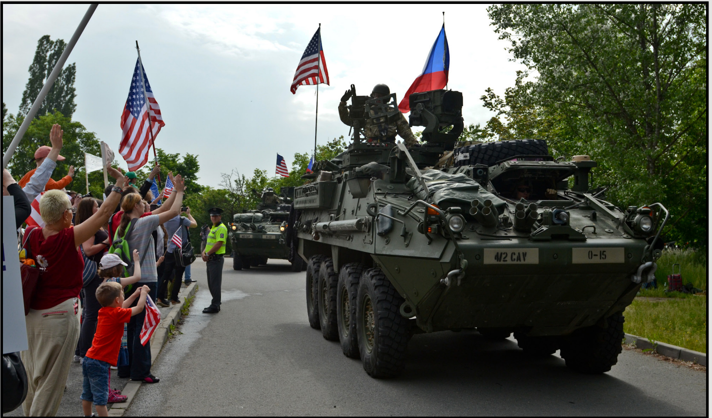
U.S. Army Europe Soldiers greet locals along the route of Dragoon Ride II.