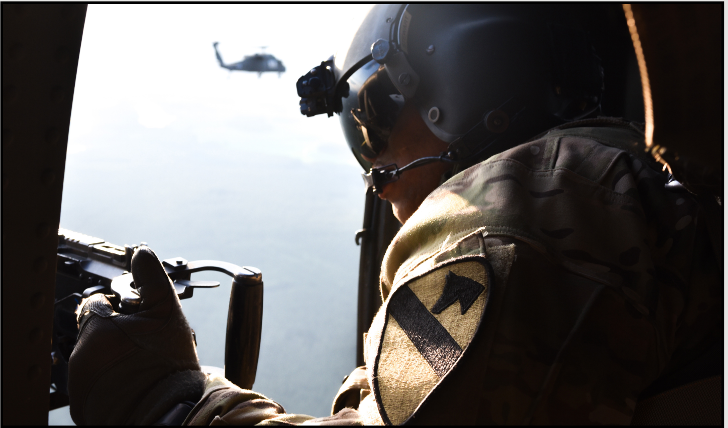
A 1st Air Cavalry Brigade Soldier scans the horizon during an air assault mission at Saber Junction 16 in Germany.