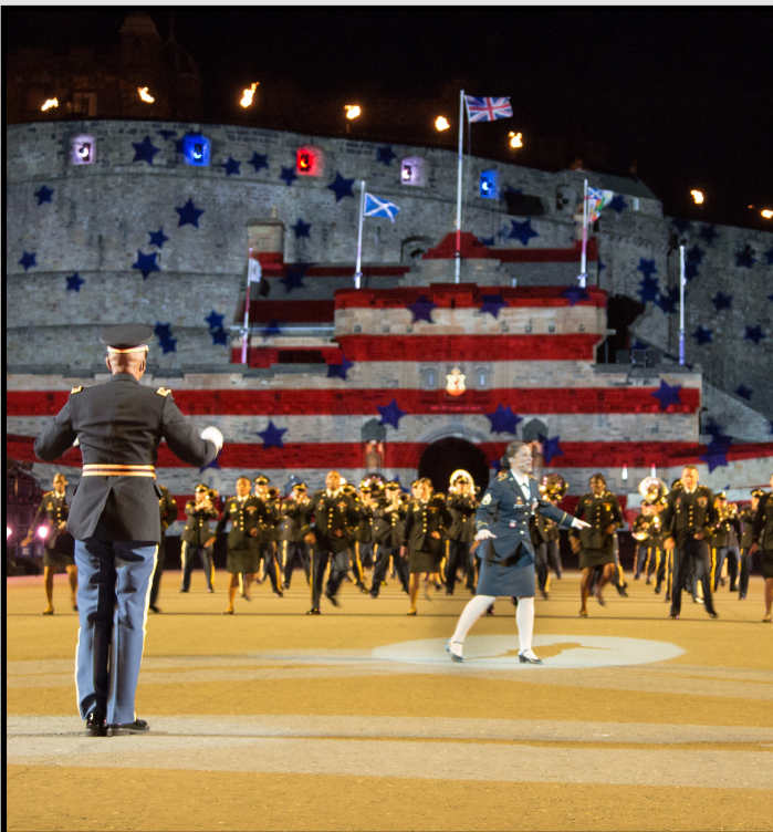
The U.S. Army Europe Band and Chorus performs during the Royal Edinburgh Military Tattoo in Scotland.