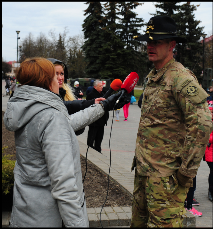
A 2nd Cavalry Regiment Soldier talks to media during a stop in Lithuania along Dragon Ride II.