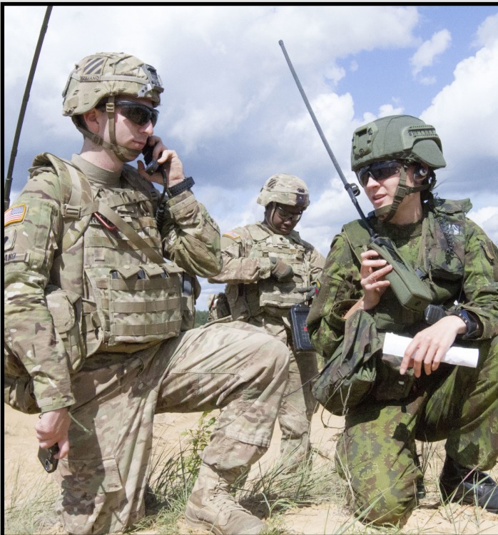
A 3rd Infantry Division Soldier and a Lithuanian Soldier radio their forces during a joint live fire exercise.