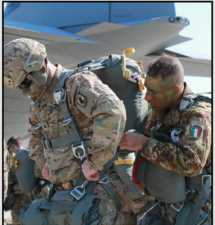
A 173rd Airborne Brigade Soldier and an Italian paratrooper prepare for a Joint Forcible Entry during Swift Response 16.