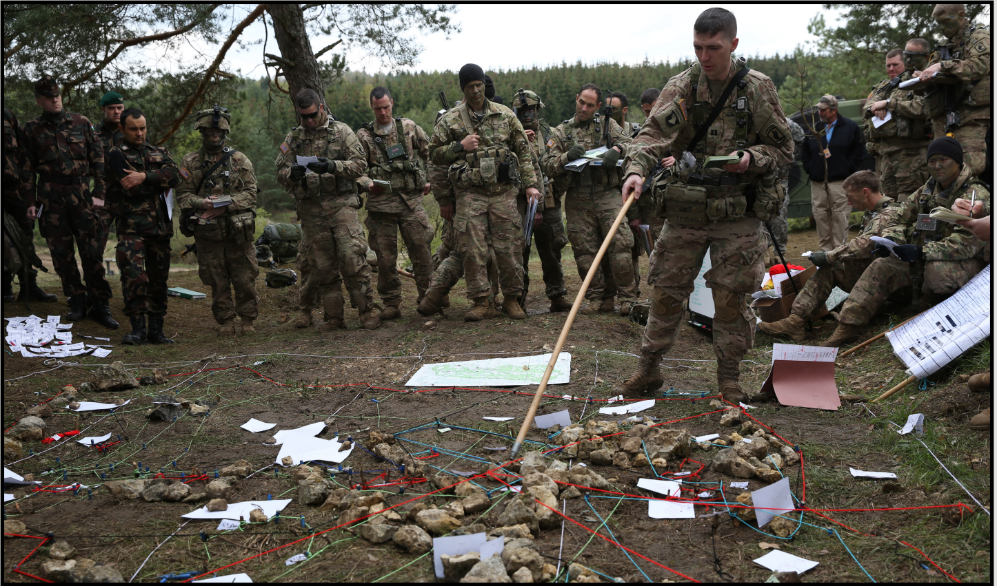
A 173rd Airborne Brigade Soldier briefs during a combined arms rehearsal at Saber Junction 16 in Germany.