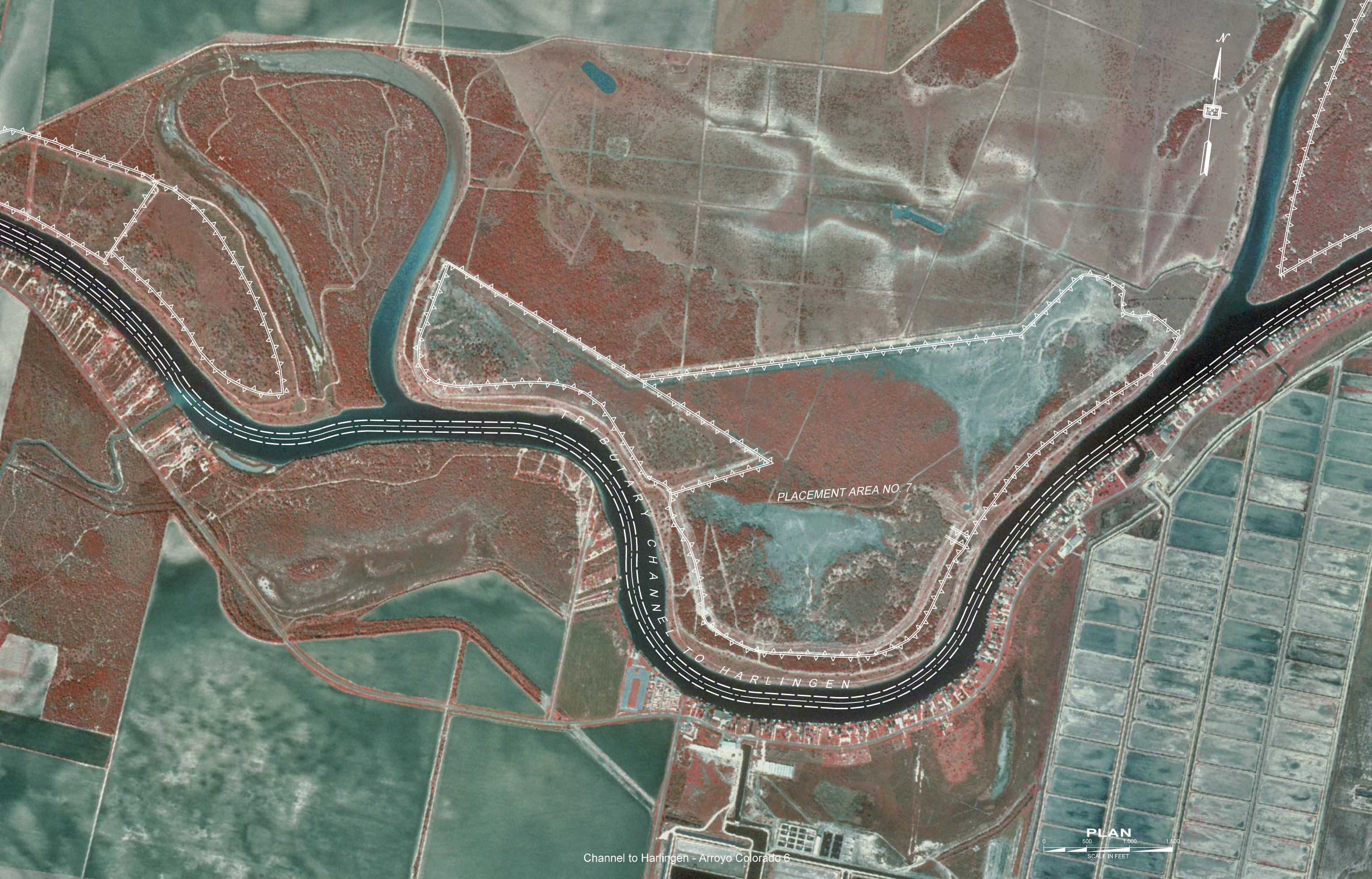
Channel to Harlingen - Arroyo Colorado 6