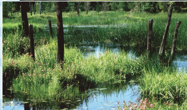
Photo by Elinor Osborn, winner in EPA's 2002 wetland photography contest