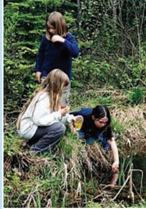
Photo by Michael Corey, finalist in EPA's 2002 wetland photography contest