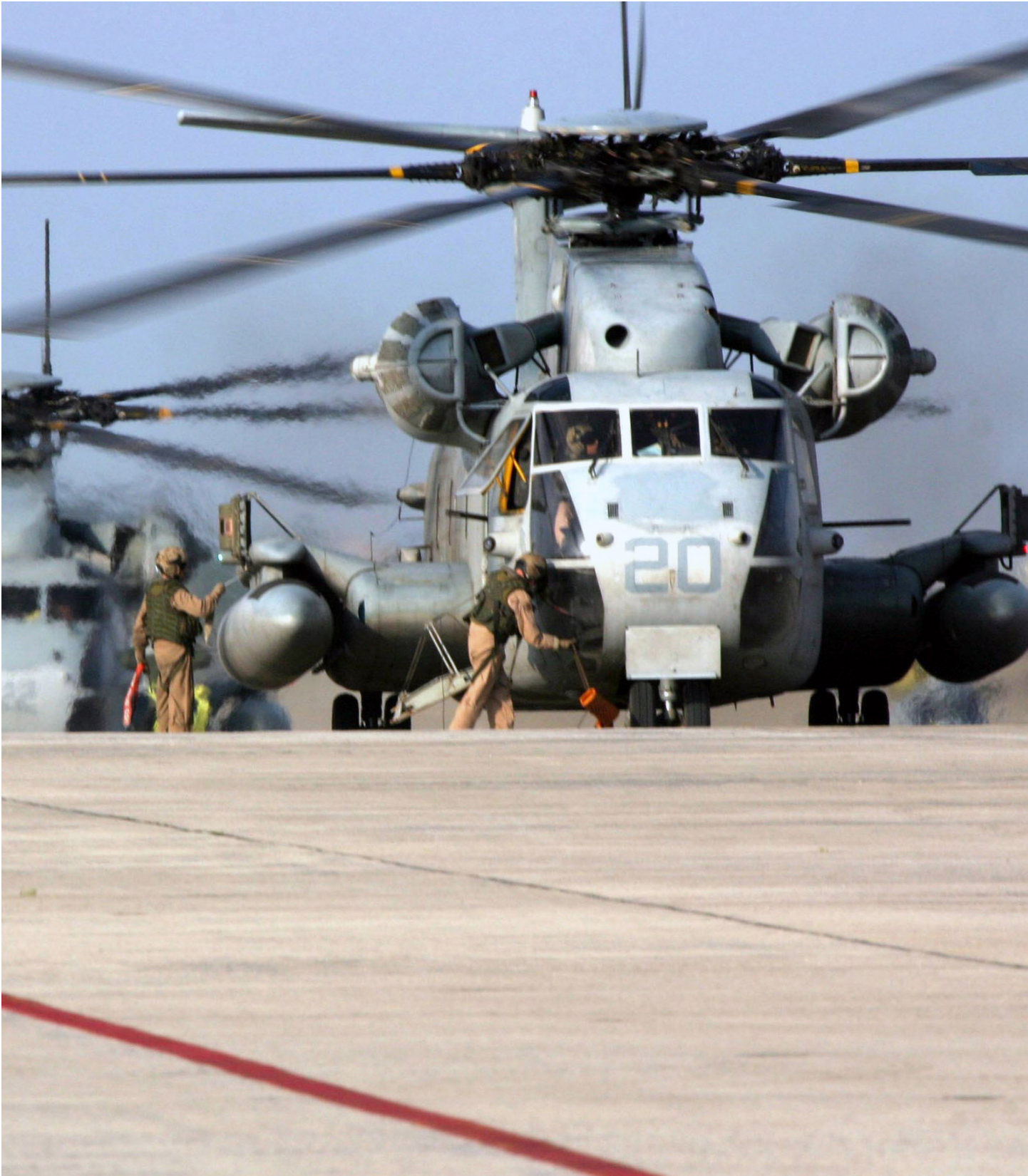
Marine Corps CH-53 helicopters prepare for flight.