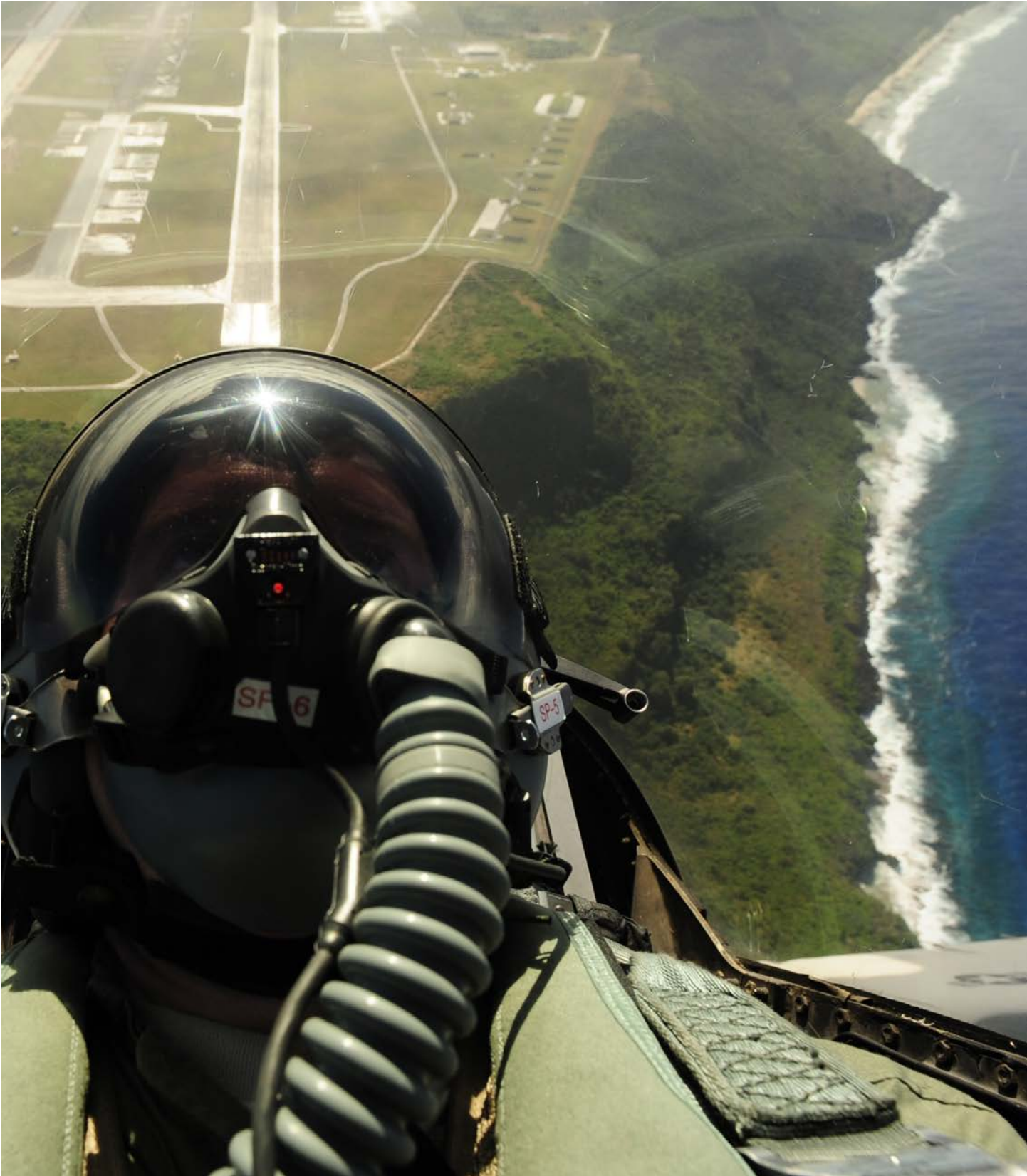
A U.S. Air Force F-16D Fighting Falcon aircraft departs the runway at Andersen AFB, Guam.