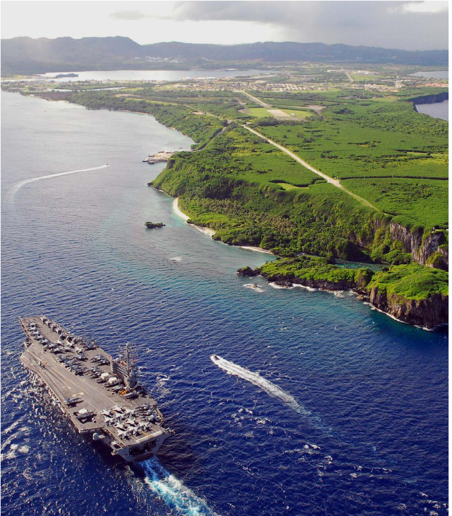
U.S. Navy aircraft carrier navigates to the Port of Guam.