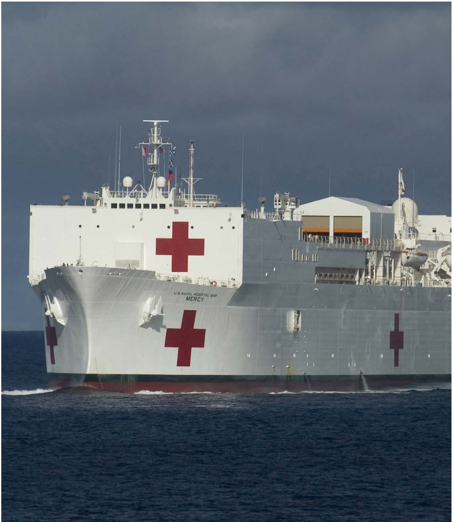
U.S. Naval Hospital Ship Mercy at sea.