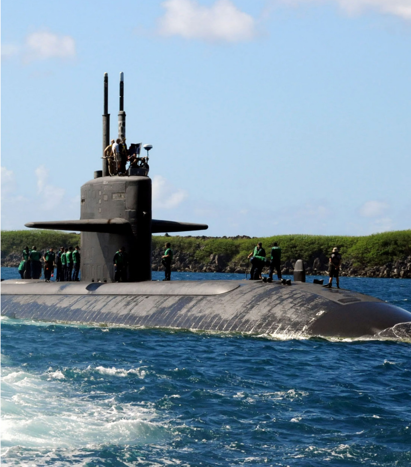
U.S. Navy attack submarine in the Port of Guam.