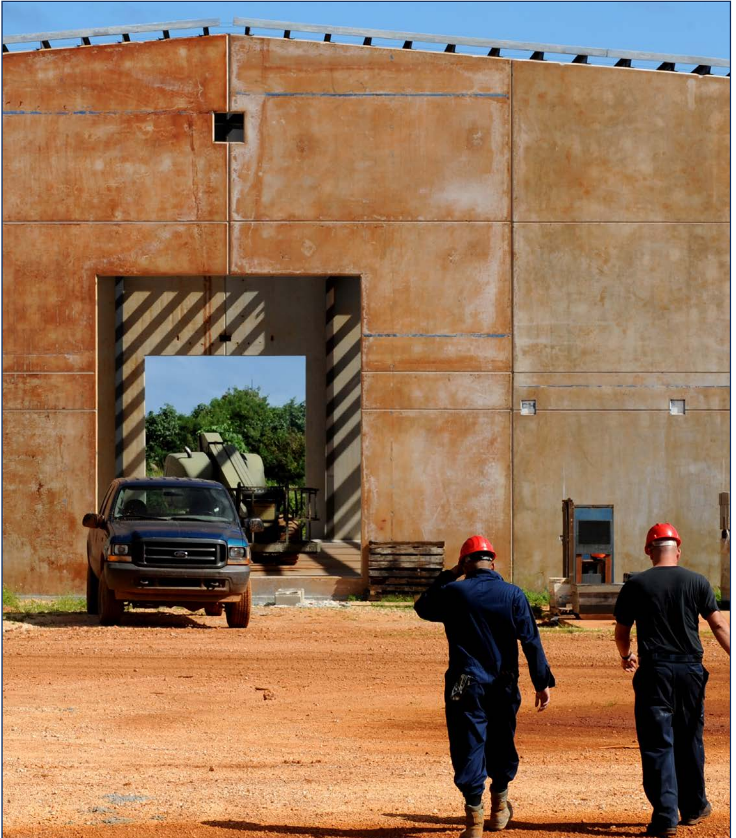
U.S. Air Force personnel perform ongoing construction at Andersen AFB, Guam.