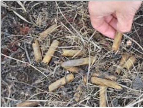
Rifle casings lie on the ground on Engineer Hill, one of the remnants of the Battle of Attu.