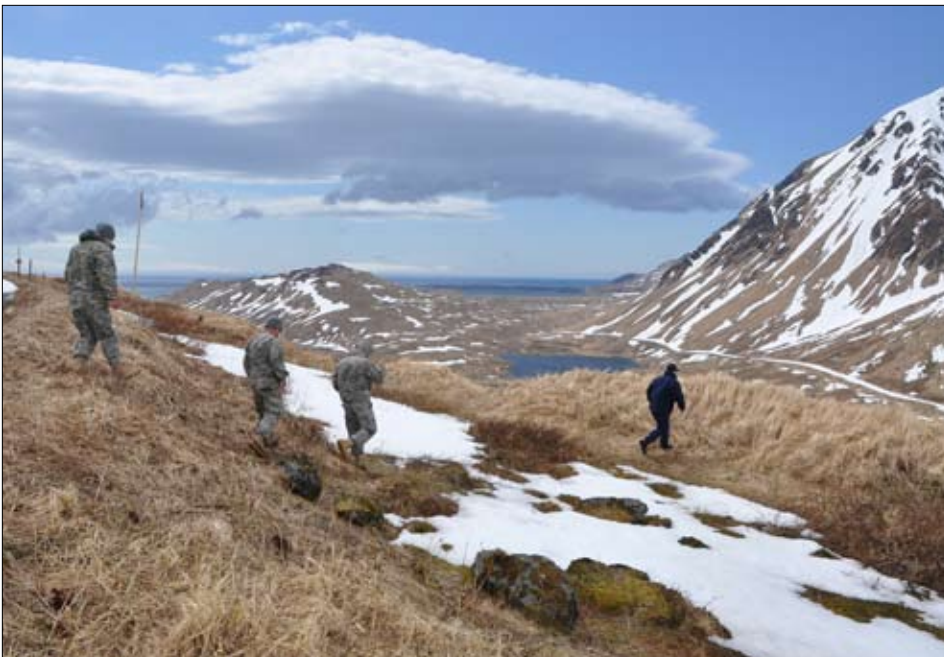
During a professional development trip to Attu, district officers and noncommissioned officers traverse the valley that leads to Jarmin Pass in the area where U.S. forces fought Japanese soldiers during the World War II.