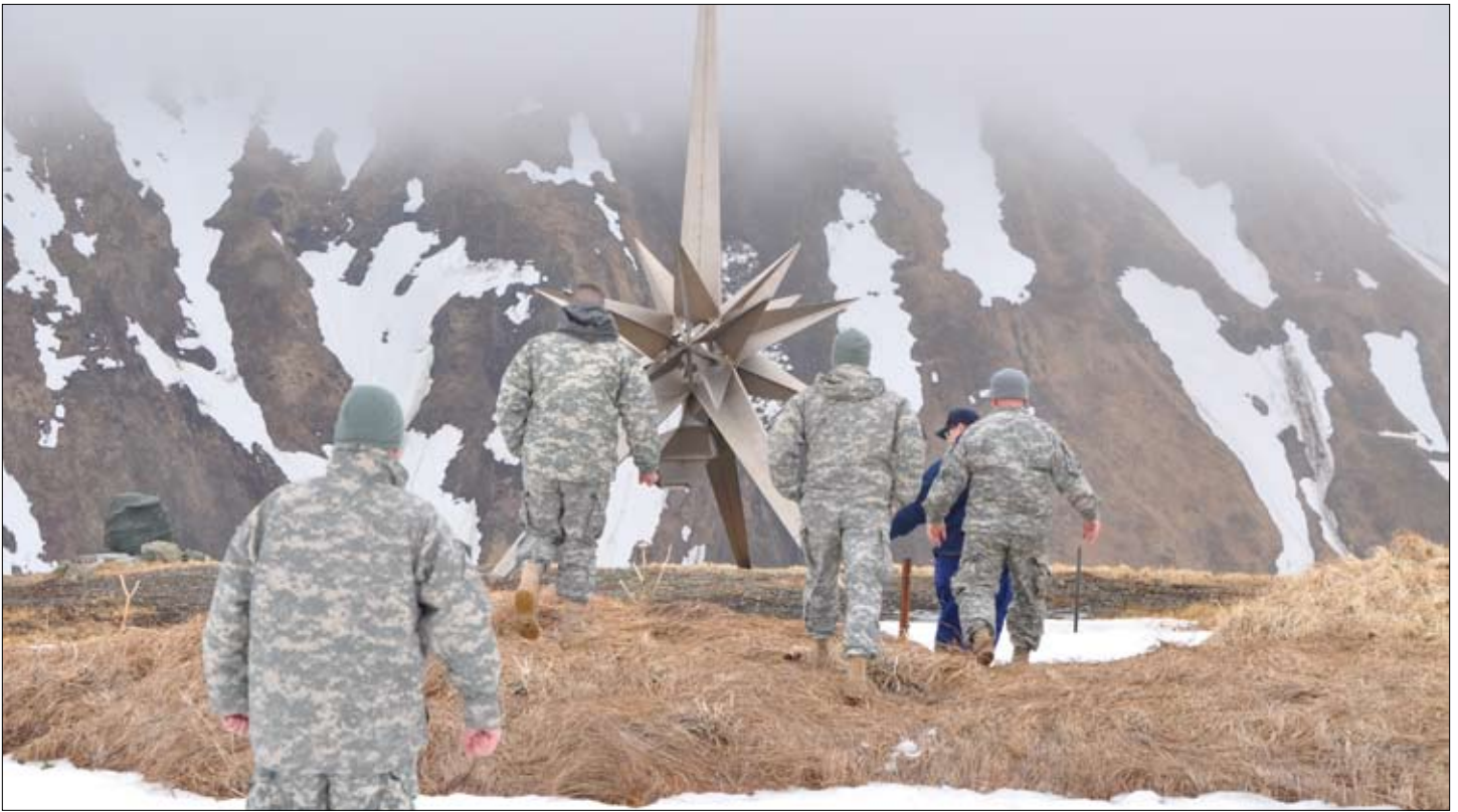
Alaska District officers and noncommissioned officers view a 20-foot titanium starburst memorial atop Engineer Hill at Attu during a military professional development trip to the Aleutian Islands May 25-28.