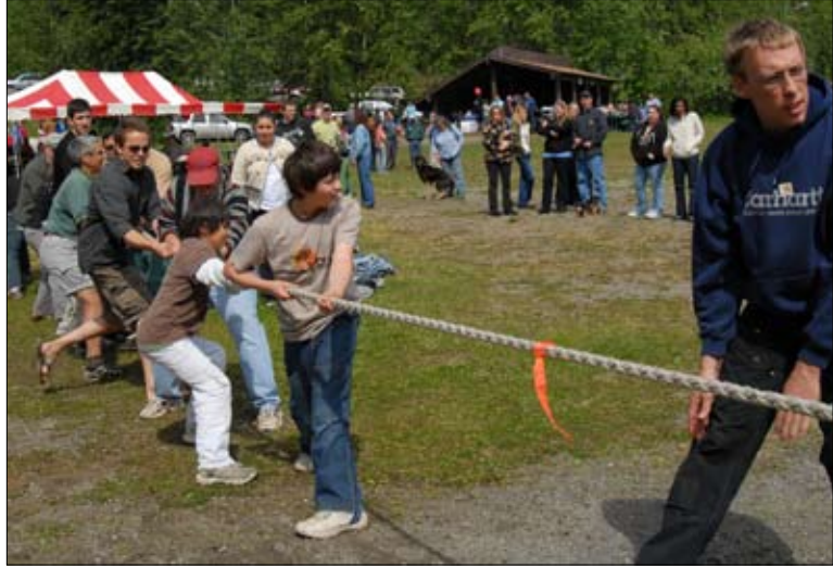
Members of the Engineering Division compete in the tug of war during the district picnic at Fort Richardson's Otter Lake in June.