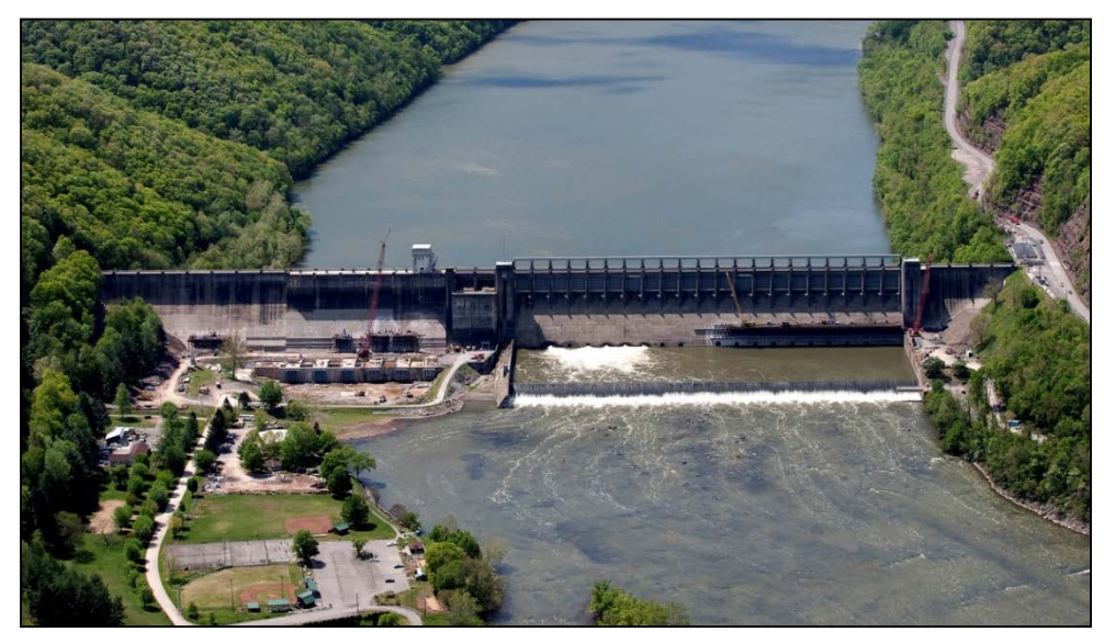
Figure 2: Bluestone Dam

As seen in Figure 2, Bluestone Dam is a straight, concrete gravity structure with an overall length of 2,060 feet and a maximum height of 165 feet above the streambed. The top of dam elevation is 1535 feet. Discharge capacity of the existing structure is accomplished through gated sluices and a gated auxiliary spillway. The spillway section is 790 feet long with a crest elevation of 1490 feet. Spillway flow is controlled by 21 crest gates. The total design discharge capacity of the dam is 430,000 cubic feet per second (cfs). Normal operation of the reservoir is by 16 gated sluices with a maximum total discharge capacity of 72,000 cfs.