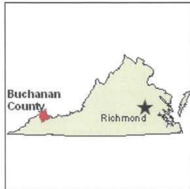
Figure 1 – General location of Buchanan County, Virginia