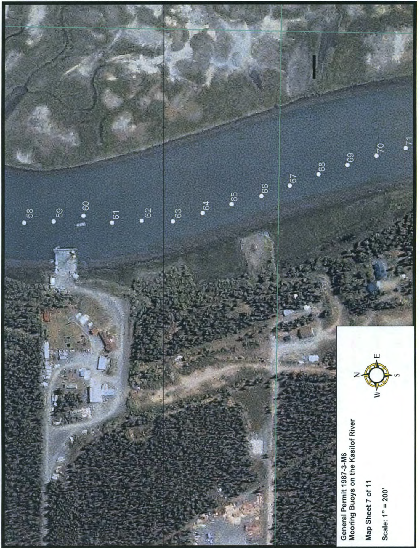
General Permit 1987-3-M6 Mooring Buoys on the Kasilof River Map Sheet 7 of 11 Scale: 1" = 200'