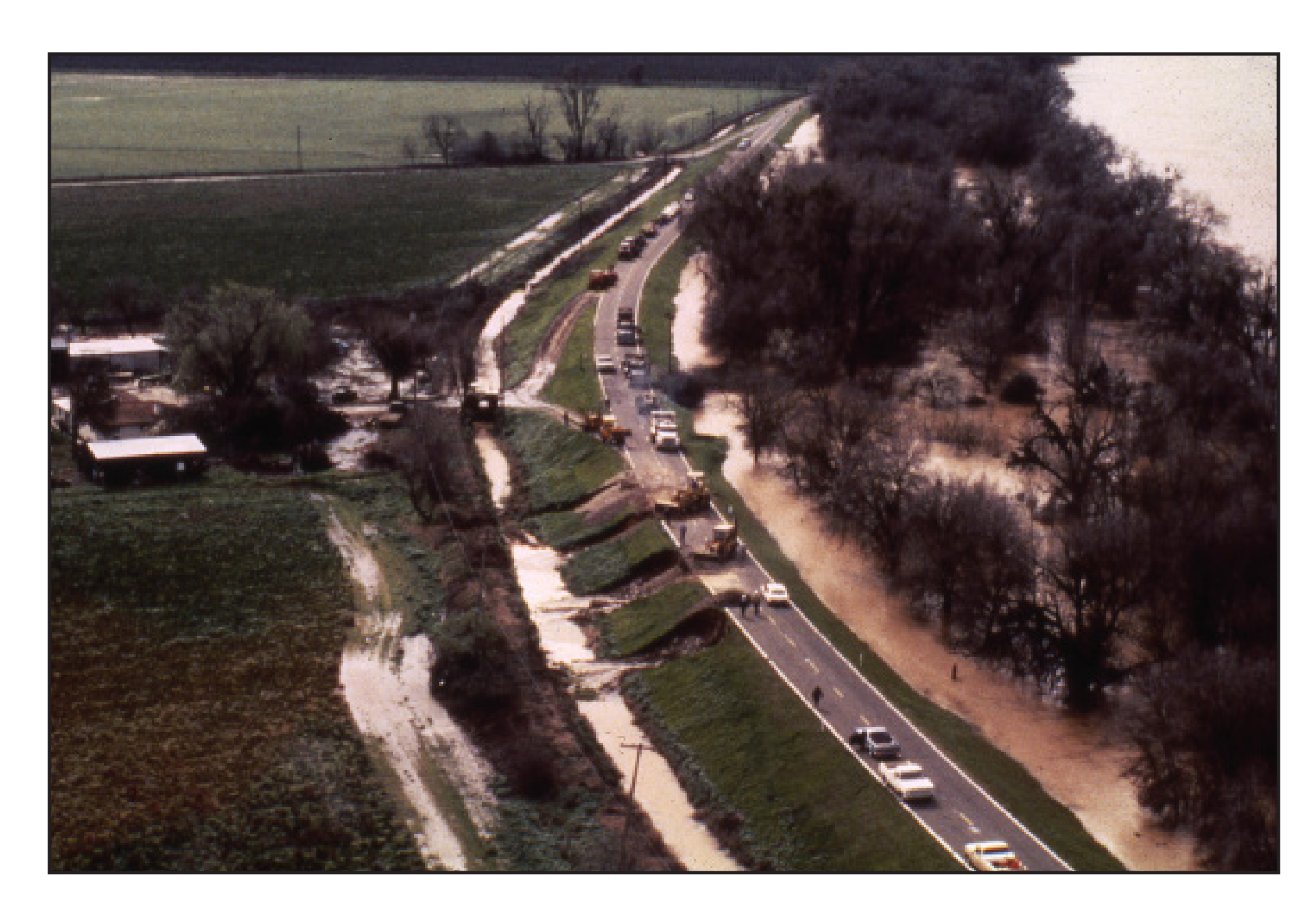
Seepage and stability problems

High river levels lead to seepage through sandy and gravelly soils. High water pressure beneath the surface can emerge at the landside levee toe, causing sand boils, and can also appear at the surface up to several hundred feet landside of the levee. Sand boils could cause loss of levee foundation, and eventual collapse of levee.