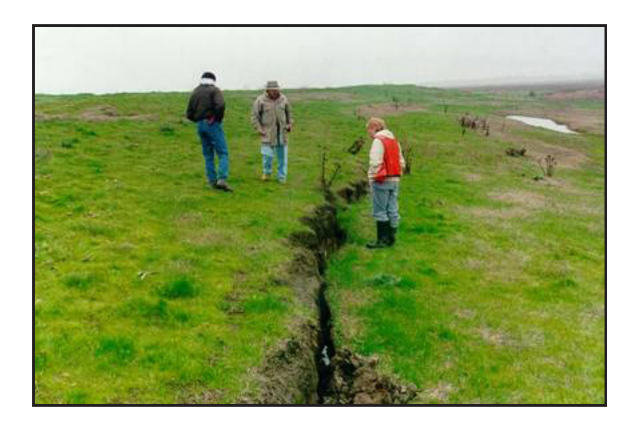
Levee instability problem