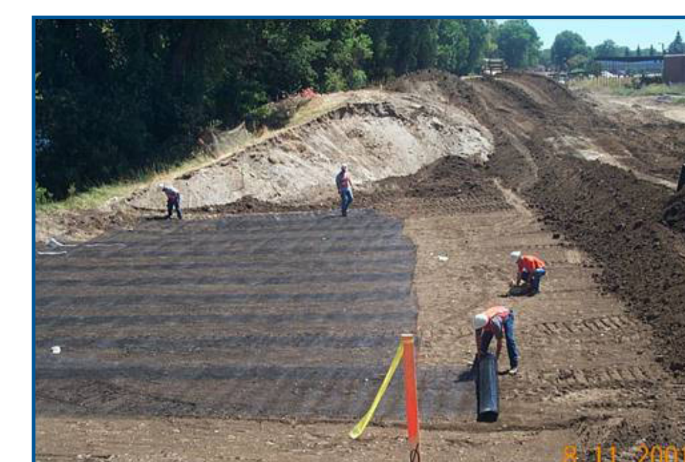
ABOVE: Levee instability repair