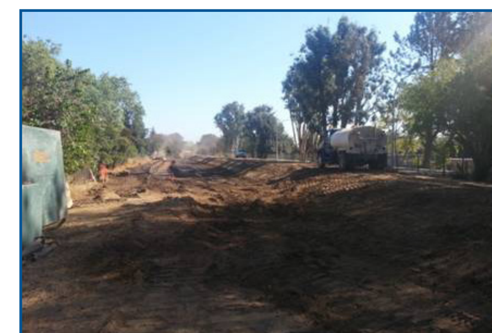
BELOW: Levee instability repair