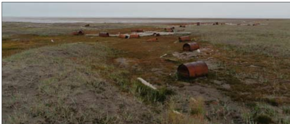
(Top photo) Drums scattered across the Jago River delta were deposited by storms moving through the area. The removal of more than 1,400 drums will help to eliminate future releases of petroleum product into the Arctic Ocean.

The site is located in the Arctic National Wildlife Refuge, so extra precautions were necessary to obtain a permit to access the area from the U.S. Fish and Wildlife Service, including