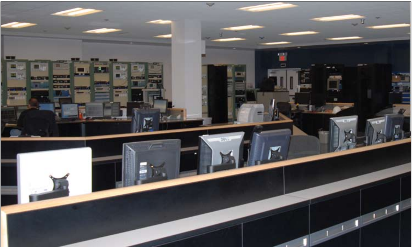
The National Oceanic and Atmospheric Administration's Fairbanks Command and Data Acquisition Station collects information from 26 spacecraft for uses such as weather forecasting, and search and rescue.

Missions include national security and defense as well as saving lives and property. Data gathered at the Fairbanks station has saved the lives of hunters and fishermen in Alaska and around the