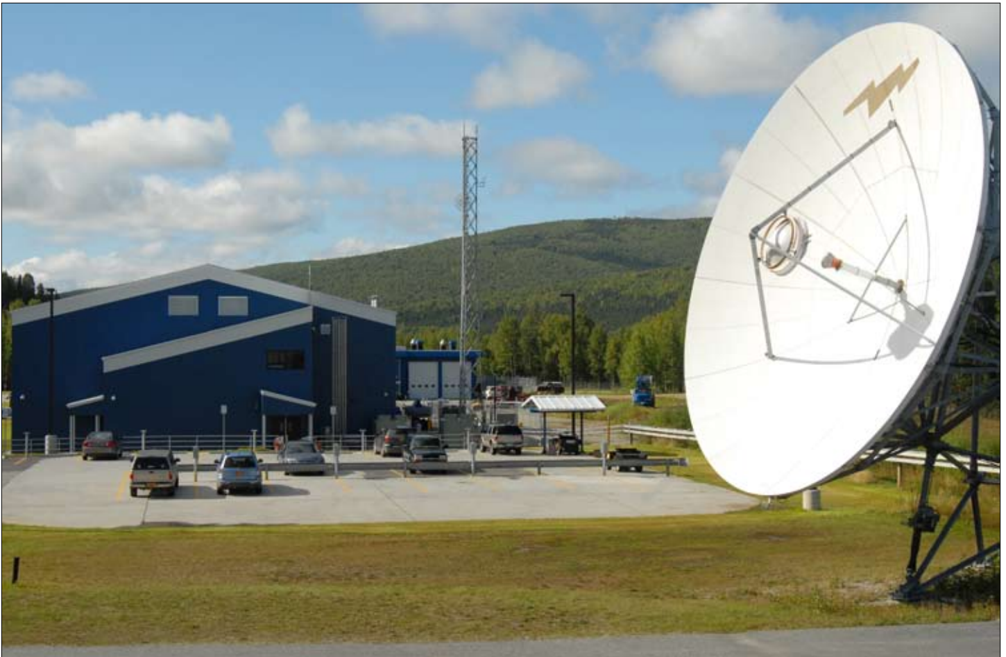
The NOAA Fairbanks Command and Data Acquisition Station's new 20,000 square-foot, $11.9 million facility was built to meet the U.S. Green Building Council's Leadership in Energy and Environmental Design Silver rating.

world. The facility is part of a global ground system that detects signals from people in distress who have activated their emergency beacons. In turn, these signals are transmitted to the Coast Guard, Air Force and local emergency departments to support a rescue.