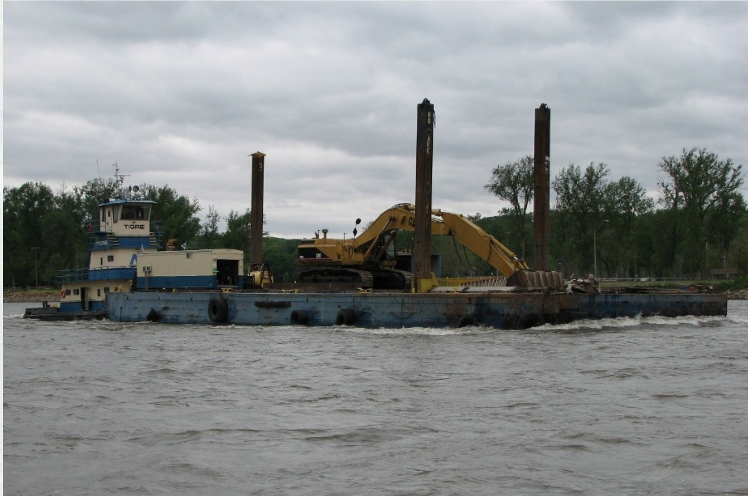
Newt Marine M/V Tigre upbound with equipment barge – May 2015