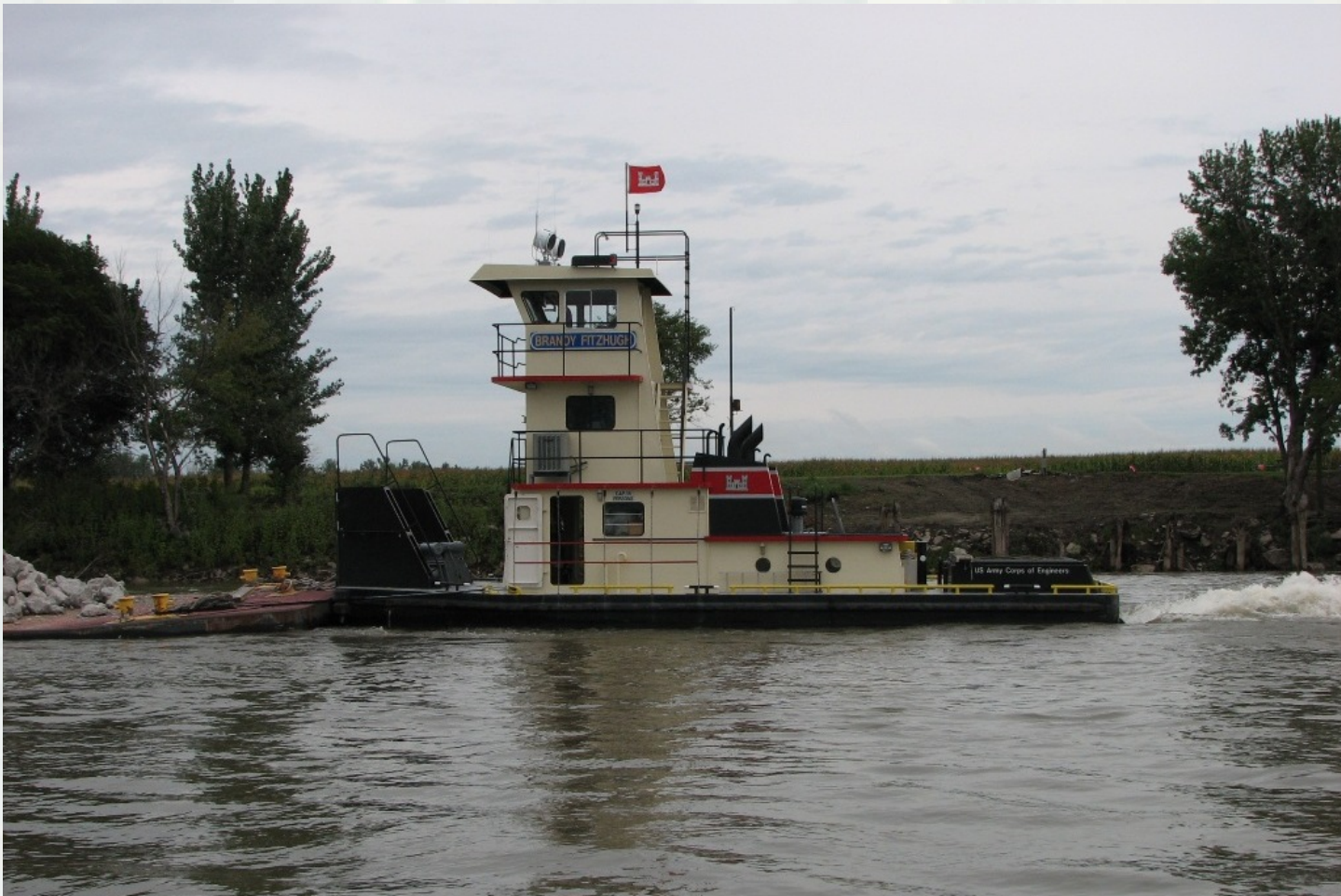
USACE M/V Brandy Fitzhugh upbound with rock barge