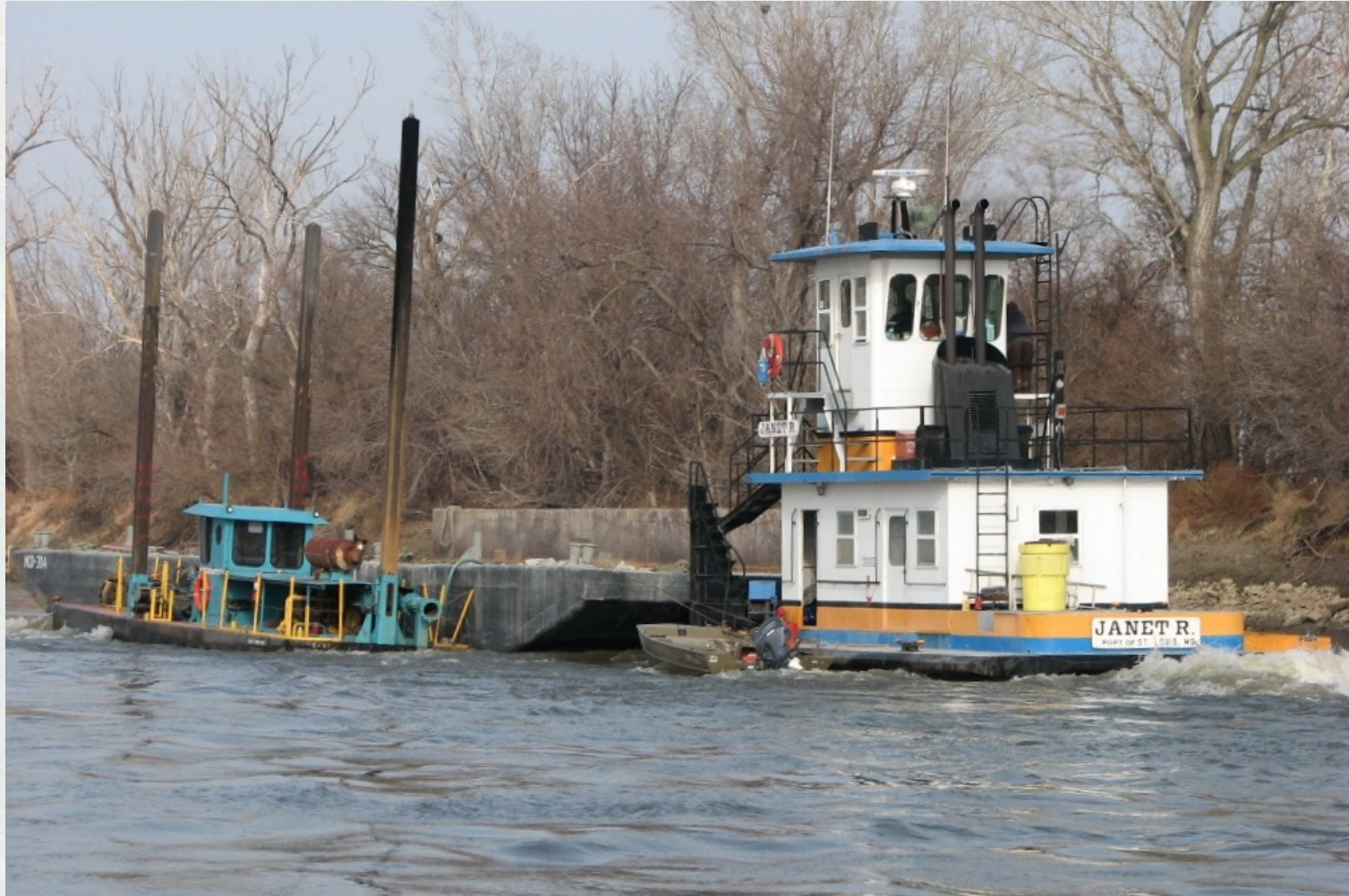
Upper Missouri Corporation M/V Janet R upbound with equipment barge – December 2014