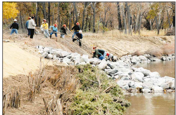
Volunteers installing bioengineering features on a restoration project near Carson, NV

While the technical notes are written for the Corps community, they are also directed at a broad audience that includes professionals at the state level and local sponsors of Corps projects. These technical notes will be posted on the WES Web site at www.wes.army.mil/el/emrrrp