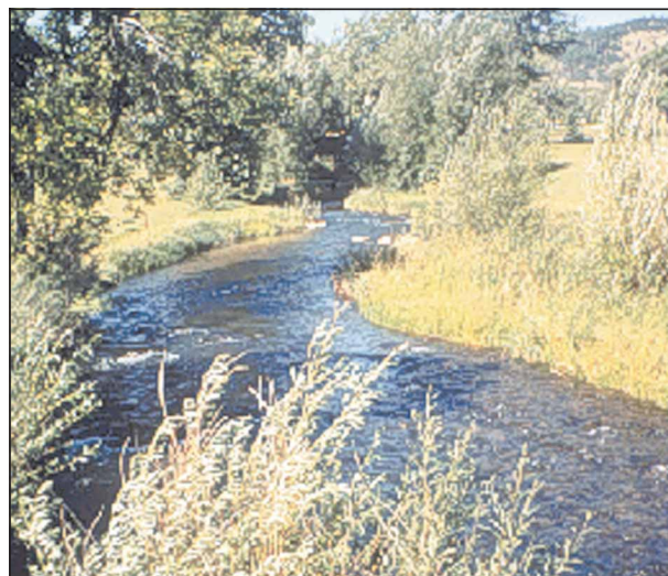
Figure 2. (After). Channel modifications provided relief and generated a 400-percent increase in Salmonidae biomass