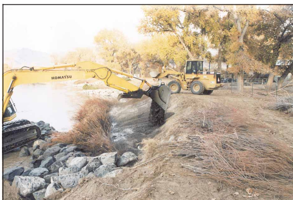
Streambank protection on Carson River, NV