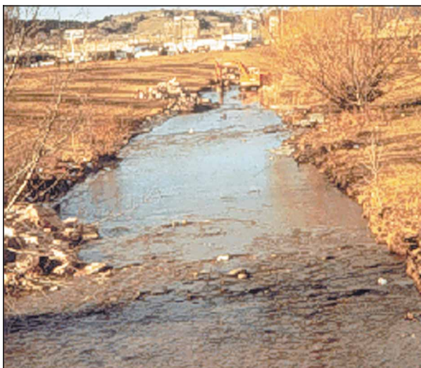
Figure 1. (Before). A flood control and stabilization project that successfully incorporated restoration objectives

The U.S. Army Corps of Engineers is playing a central role in the stream restoration effort. The 1986 Water Resource Development