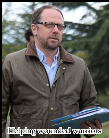
Helping wounded warriors