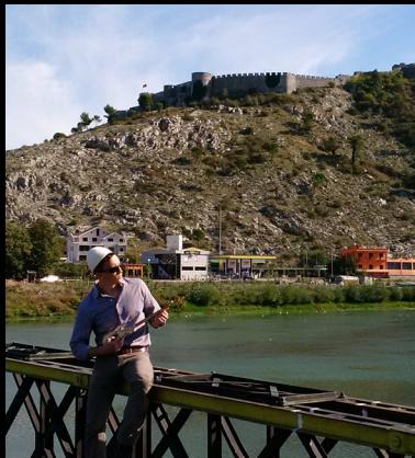
Embracing Albanian culture