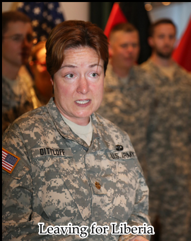
Leaving for Liberia