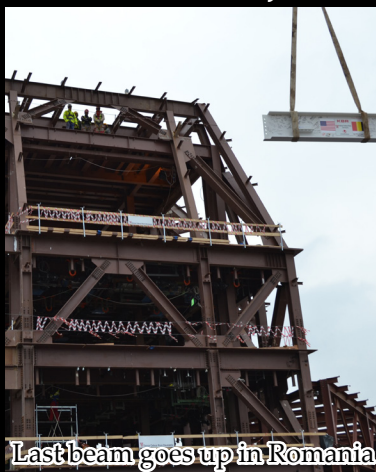
Last beam goes up in Romania