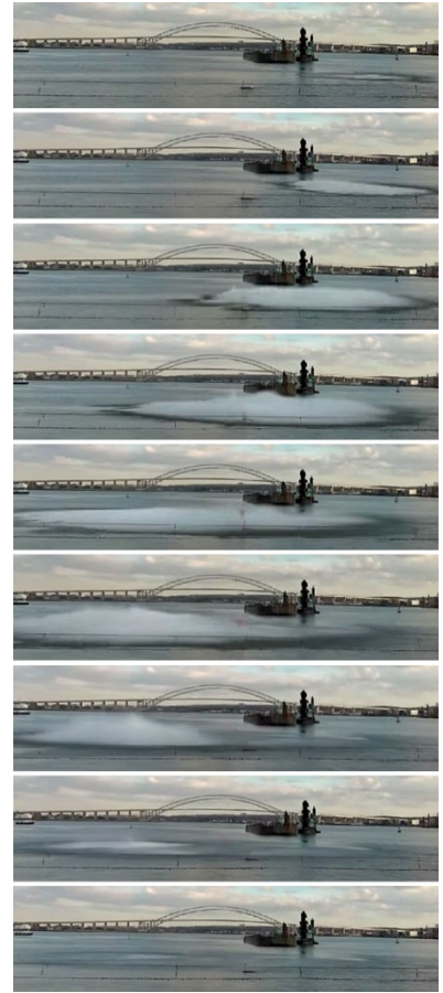
Since blasting is conducted underwater, visual effects on the surface are minimal – the video stills above show rock blasting in a similar 43-foot channel