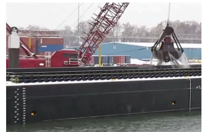
Bucket dredging operations