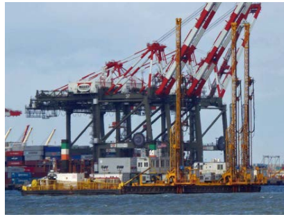
Typical drill barge (foreground)