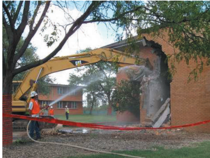
Dorms Demolition Work, FY10 Small Business Award Cannon AFB, Clovis (NM)

Department of Veterans Affairs http://www.vip.vetbiz.gov