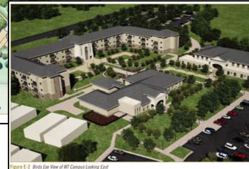
Figure E-2. Birds Eye View of WT Campus Looking East

The Savannah District Master Planning Section of Planners, Architects, Landscape Architects, and Engineers is experienced in working with proponents and stakeholders during the planning process to develop the Installation's vision and to establish the Installation's goals and objectives. Deliverables and fees are dependent on the scope of services required and are developed upon request.