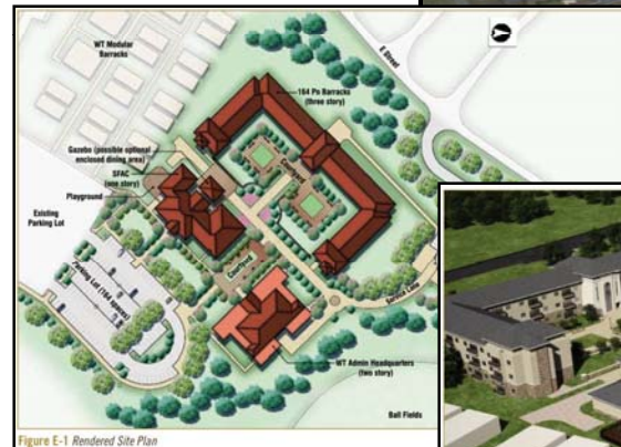
Figure E-1. Rendered Site Plan