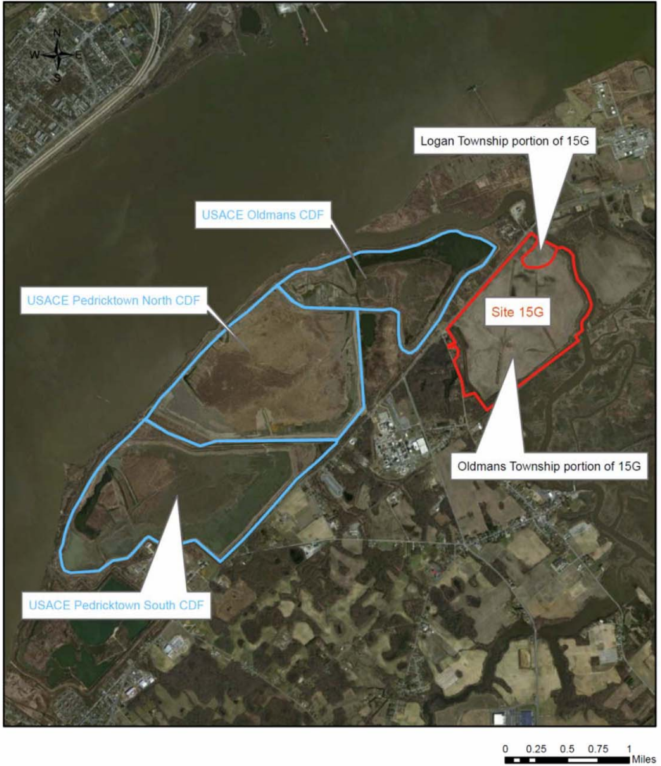
Figure 3. Proposed New CDF-Site 15G.