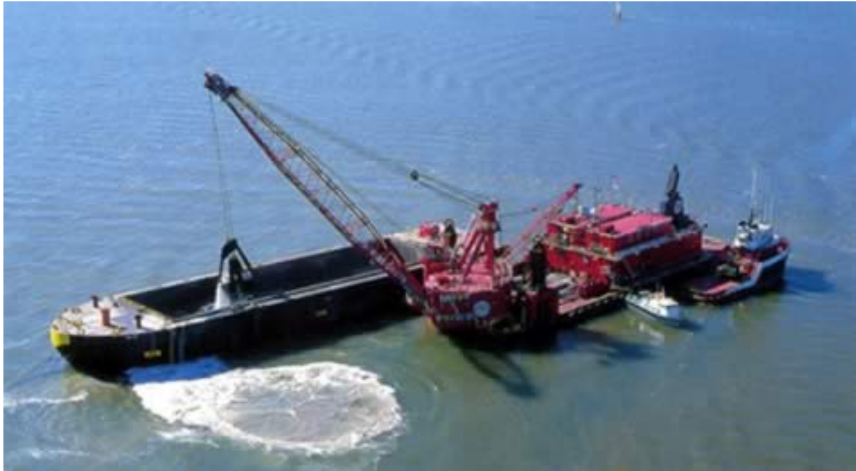
Figure 4. Clamshell Dredge