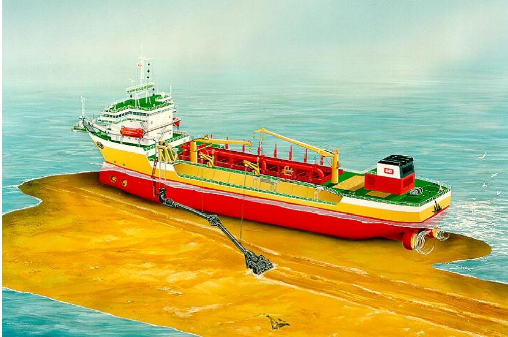
Figure 1. Hopper Dredge

Due to coastal conditions and the distance of the Delaware River Federal channel to the dredged material placement sites, it is unlikely that hydraulic cutter suction dredges with direct pump (pipeline) to the placement sites will be used to deepen Reach E; however, cutter suction dredges could be used in conjunction with a spider barge to load hopper scows with dredged material. When full, the hopper scows are transported by tugboats to the placement site or pumpout location. Hopper scows could also be loaded directly using mechanical dredges (see Section 5).