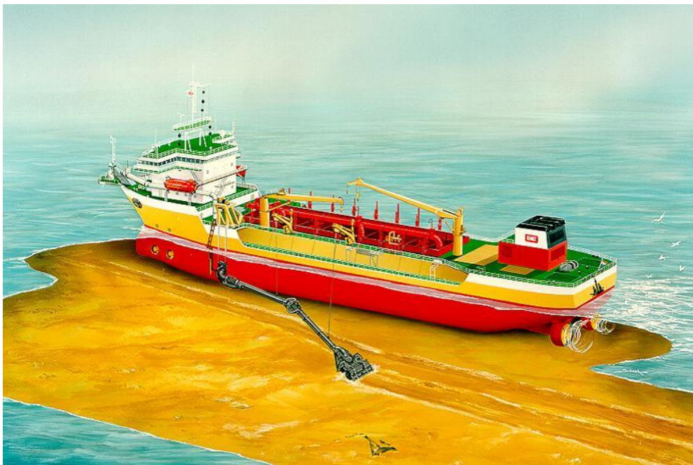
Figure 1. Hopper Dredge

Although different in size and shape, the primary component of hopper dredges and hopper scows is the hopper, which is used to contain and transport dredged material. During the dredging process, sediments are mixed with water to create slurry, which is typically about 25 percent solids and 75 percent water, and the slurry is pumped into the hopper. As the hopper fills with the slurry, the sediments begin to settle to the bottom of the hopper, creating a bottom layer of higher-density sediment with a top layer of lower-density supernatant. Coarse grained sediments (sediments with high percentages of sand/gravel) and consolidated clay sediments settle to the bottom faster than fine grained sediments (unconsolidated silts and clays).